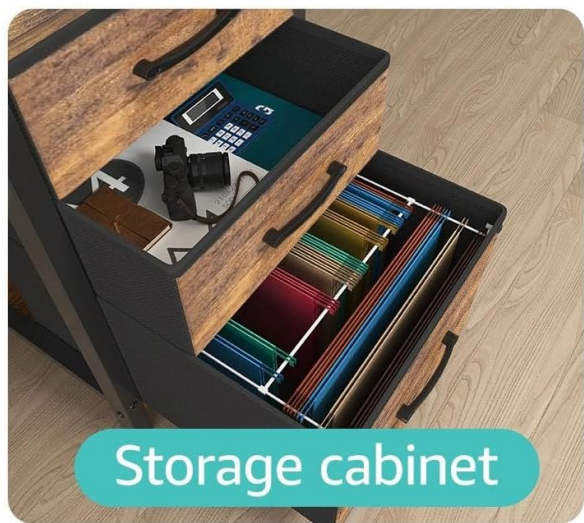
Image 4.2: Detail of the adjustable file drawer and smaller fabric drawers.