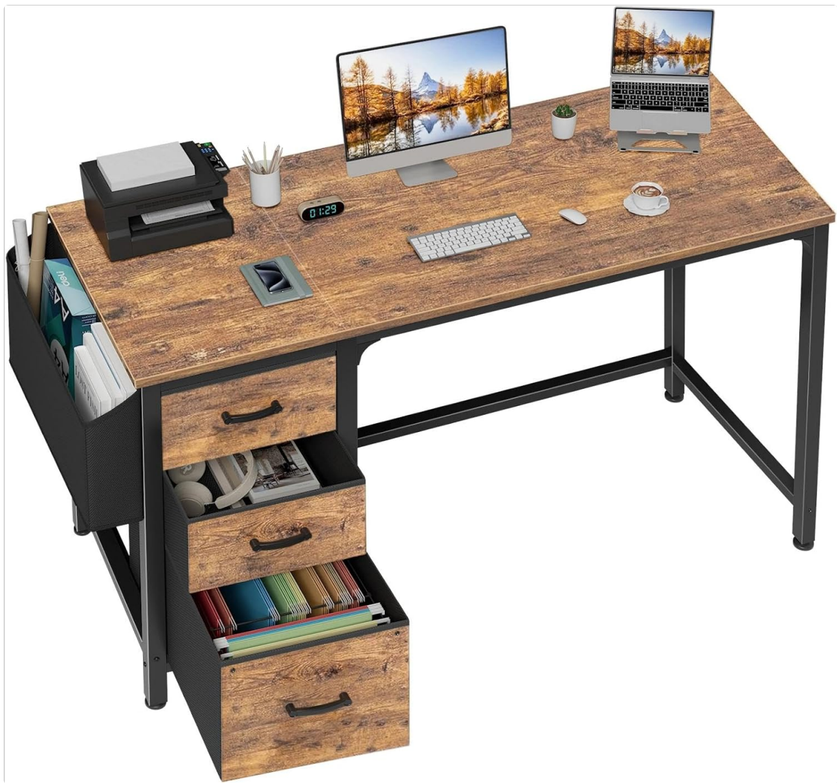
Image 1.1: The Lufeiya 55-Inch Reversible Computer Desk with Fabric File Drawers Cabinet.