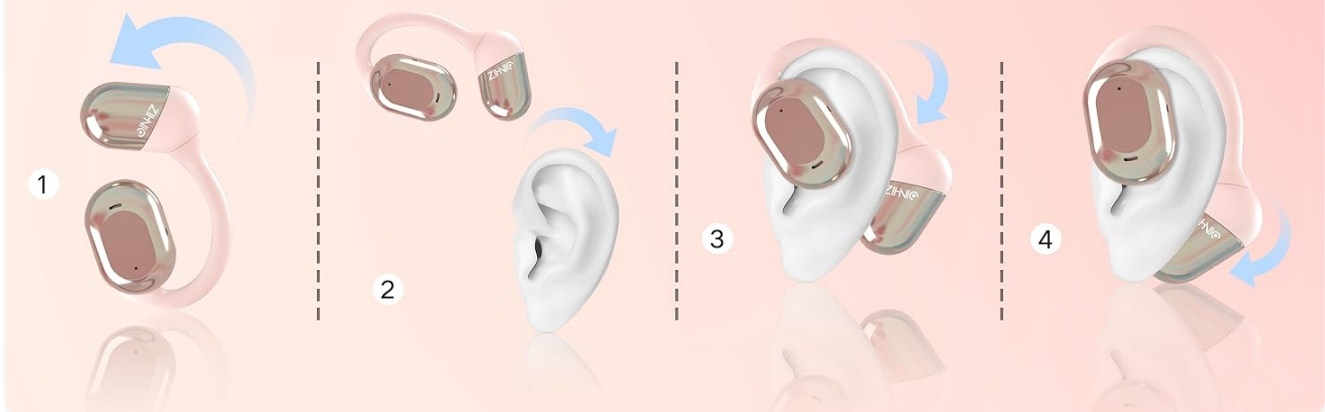
Image: Step-by-step guide on how to correctly wear the ZIHNIC Open-Ear Headphones.