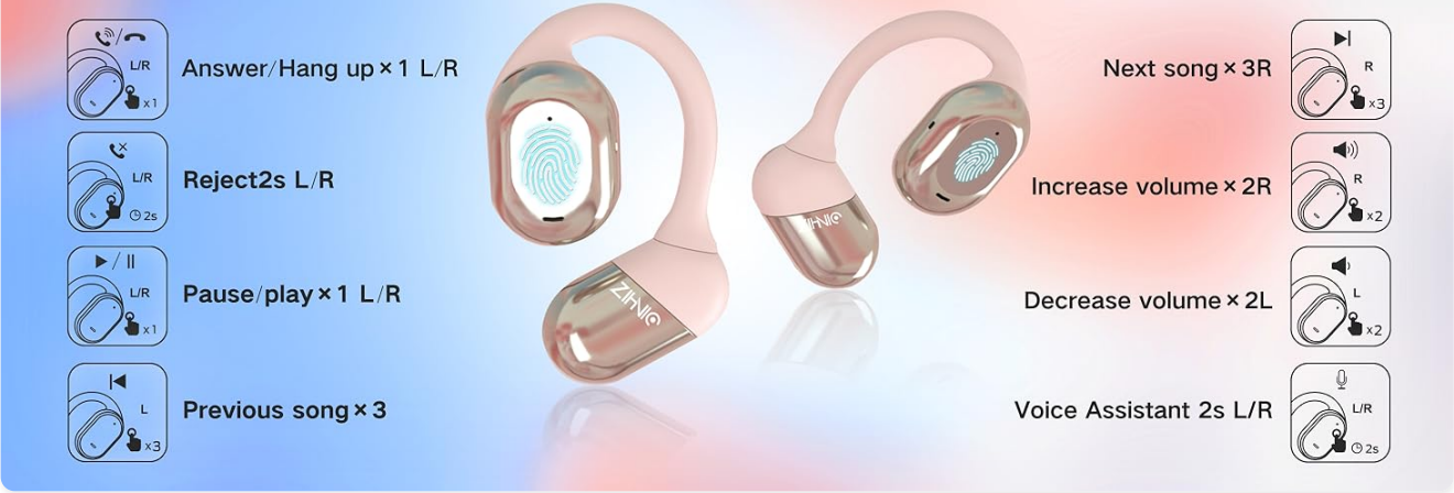
Image: Detailed guide to the touch control functions on the ZIHNIC S05 headphones.