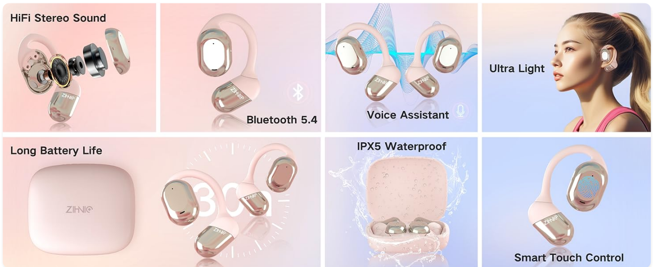
Image: Visual representation of key features such as HIFI Stereo Sound, Bluetooth 5.4, Voice Assistant, Ultra Light design, Long Battery Life, IPX5 Waterproof, and Smart Touch Control.