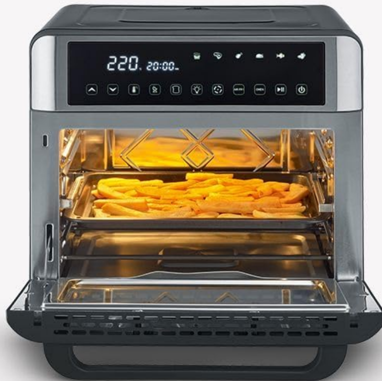
Figure 5: French fries being air-fried in the frying basket.