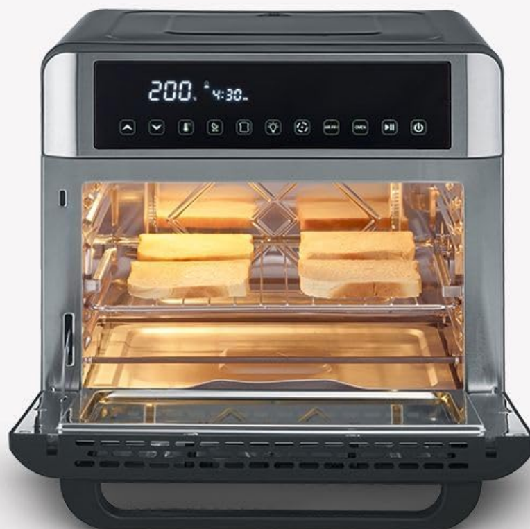
Figure 6: Bread slices being toasted on the cooking grate.