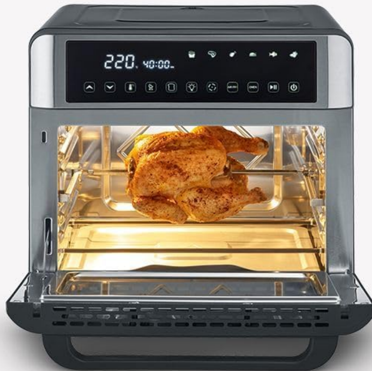
Figure 4: A whole chicken being roasted using the rotisserie function.