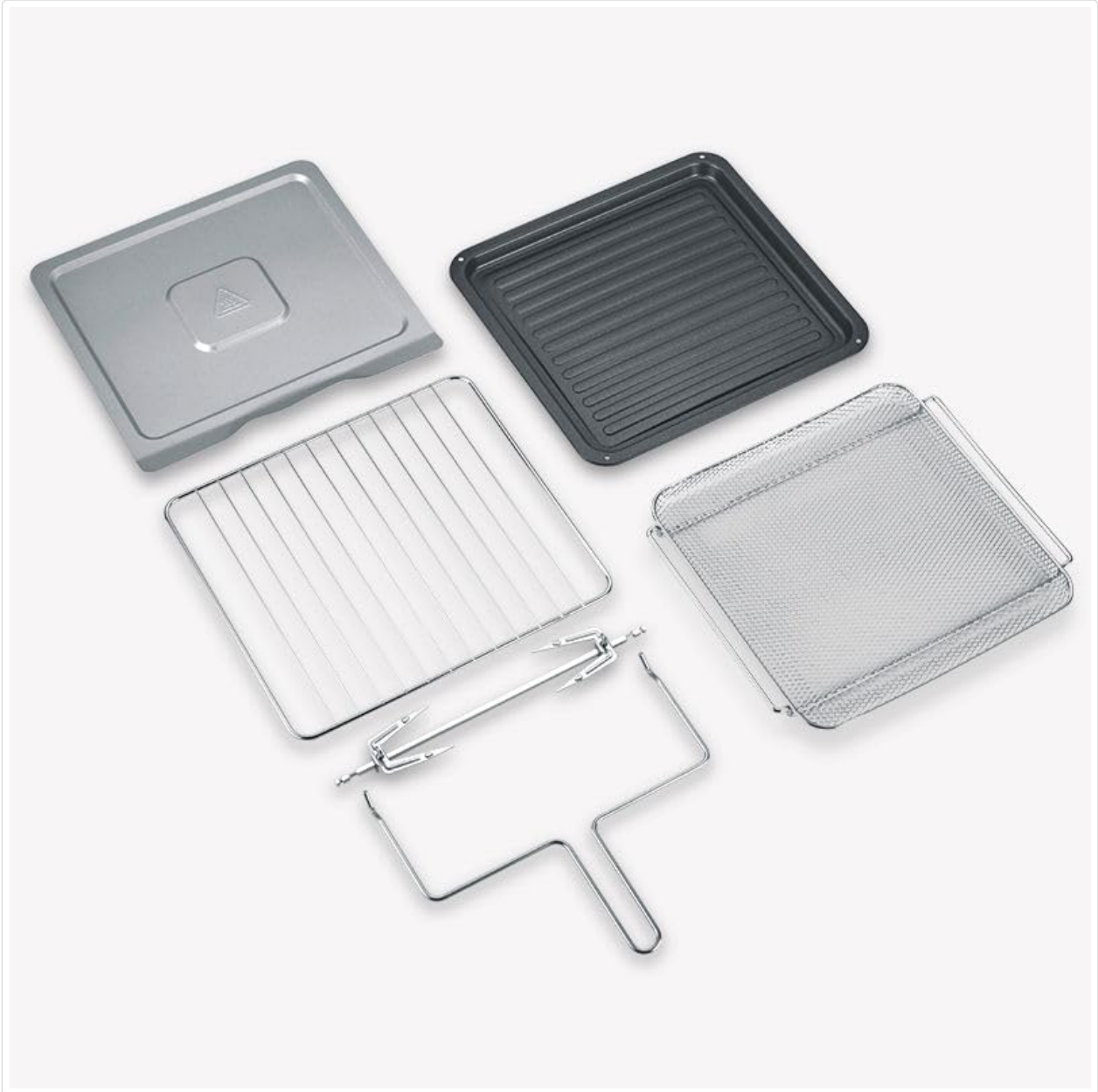
Figure 1: Included accessories, featuring the frying basket, grill grate, rotisserie skewer, baking tray, crumb tray, and accessory handle.