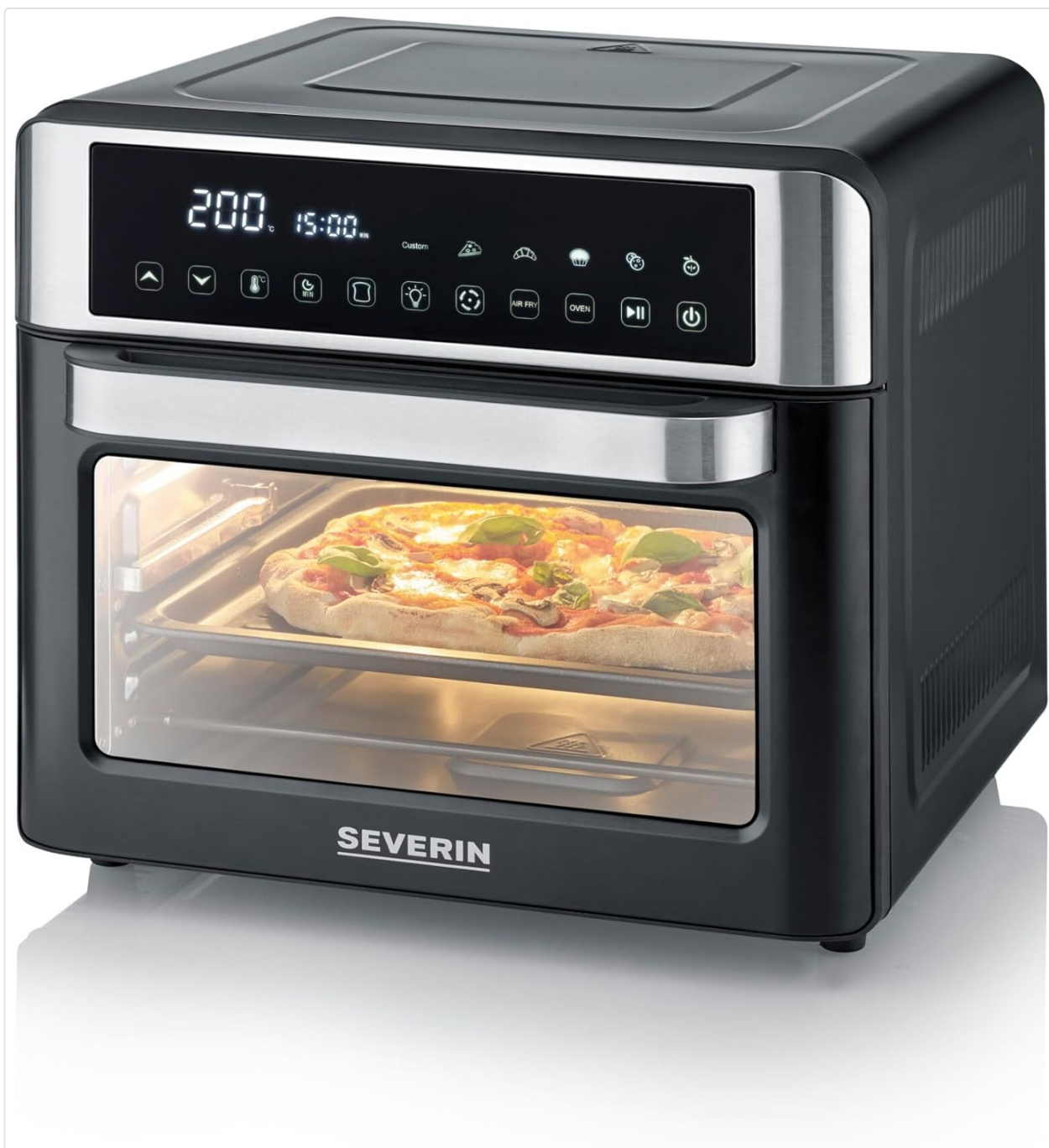
Figure 3: The oven in use, baking a pizza on the baking tray.