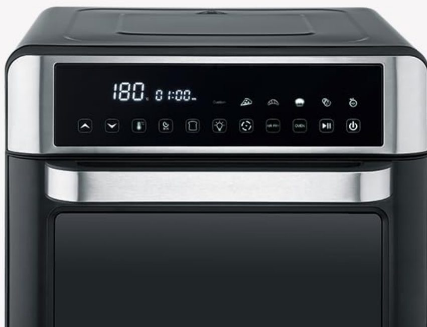
Figure 2: Detailed view of the touch control panel, showing temperature, time, and various function icons.