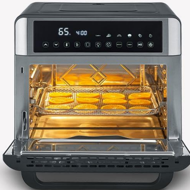
Figure 7: Small food items cooking on a rack, demonstrating versatile use.