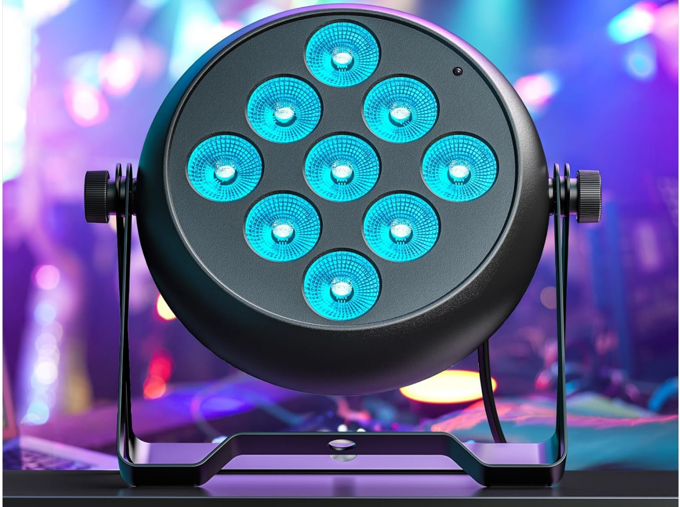
Image: A single DazzlingStage LED Par Light, showcasing its blue light output. This light features 9 individual LED elements and a sturdy mounting bracket.