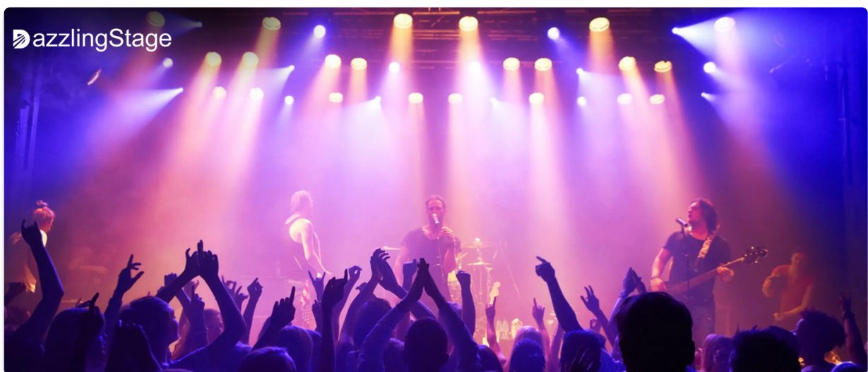
Image 9.1: A vibrant stage lighting setup, representing the DazzlingStage brand's commitment to quality stage lighting equipment.

For further assistance, please refer to the contact information provided with your purchase or visit the official DazzlingStage store online.