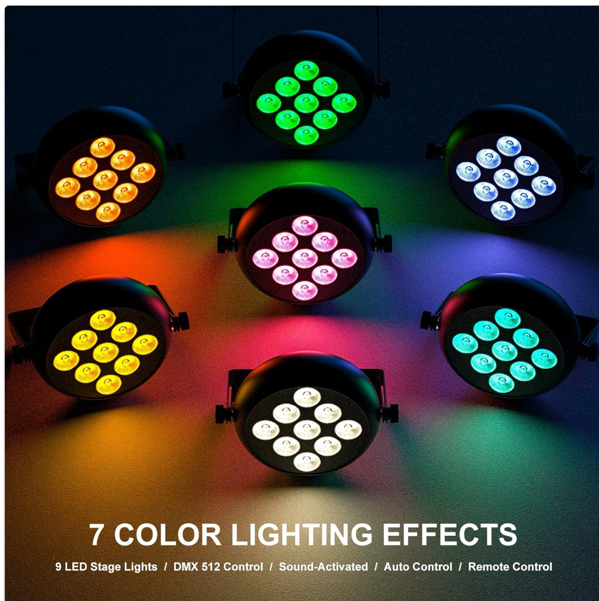
Image 5.2: Several LED Par Lights illuminated in different colors (orange, green, pink, blue, white, red, cyan), demonstrating the range of available static colors and color mixing capabilities.