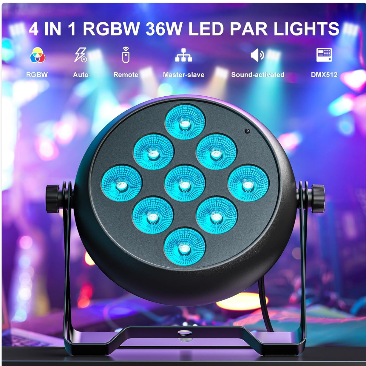
Image 2.1: A single DazzlingStage LED Par Light illuminated with blue light, highlighting its 4-in-1 RGBW capabilities and round design.