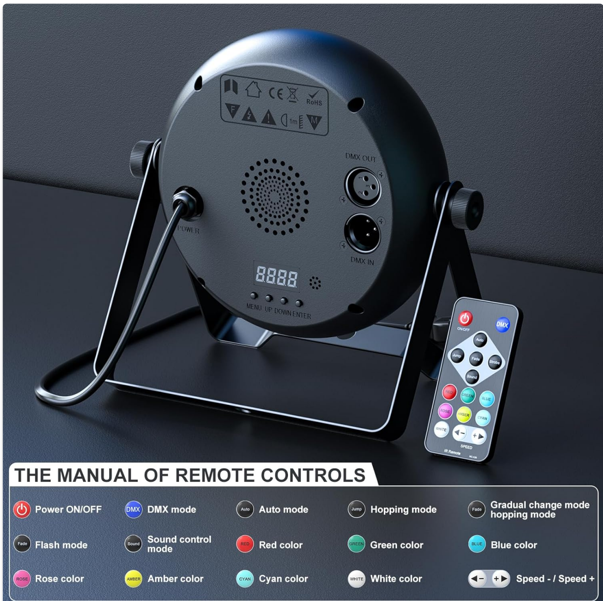
Image 4.1: Rear view of the LED Par Light, showing the DMX IN/OUT ports, power input, and the included remote control, illustrating connectivity options.