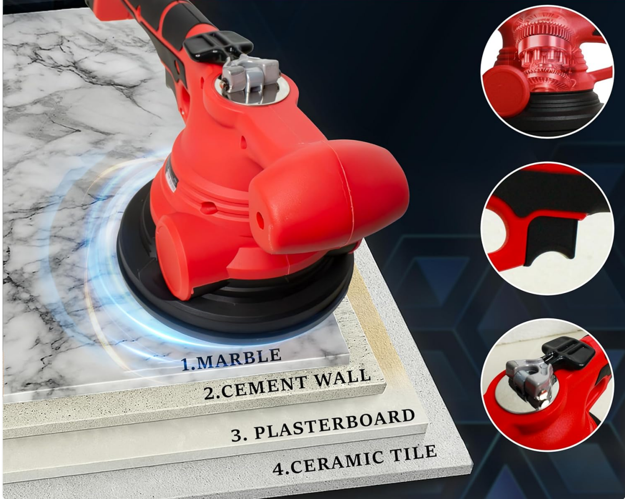
Figure 4.2: The IBELL CT 20-60 is compatible with various materials including marble, cement walls, plasterboard, and ceramic tiles.

The perfect balance of simplicity and flexibility