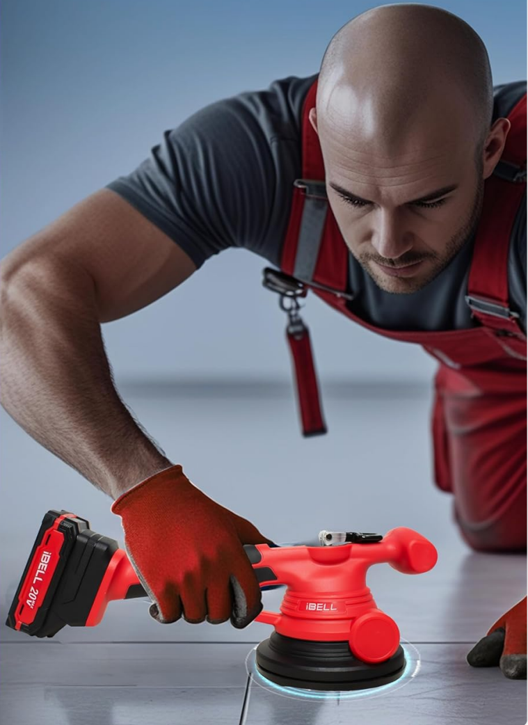
Figure 6.2: Examples of multiple usage scenarios for the IBELL CT 20-60, including wall tiles, marble floors, solid wood, and ceramic tiles.