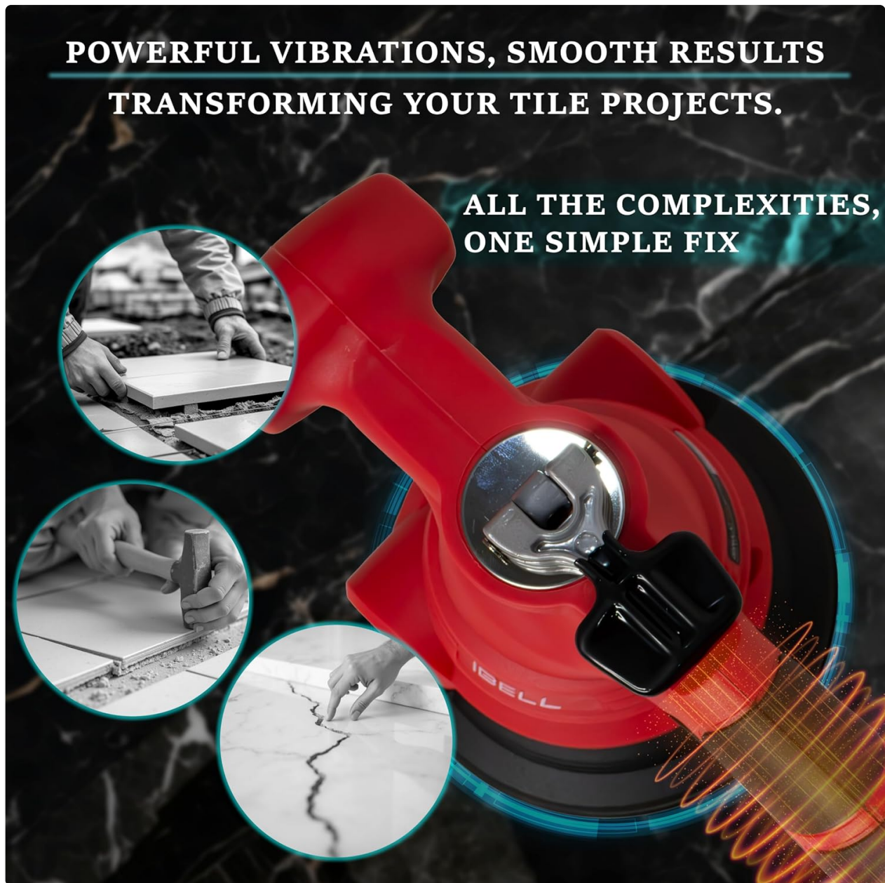
Figure 6.1: The tile vibrator in action, demonstrating its ability to achieve smooth results and simplify tile installation.

For optimal results, ensure the tile surface is clean and dry before applying the suction cup.