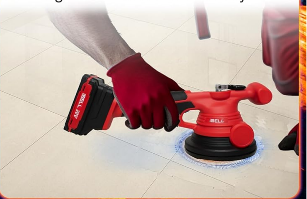
Figure 5.1: Visual guide for the initial setup and operation of the tile vibrator, starting with battery insertion.

STEP 4 Holding the suction cup while working on the tiles is necessary