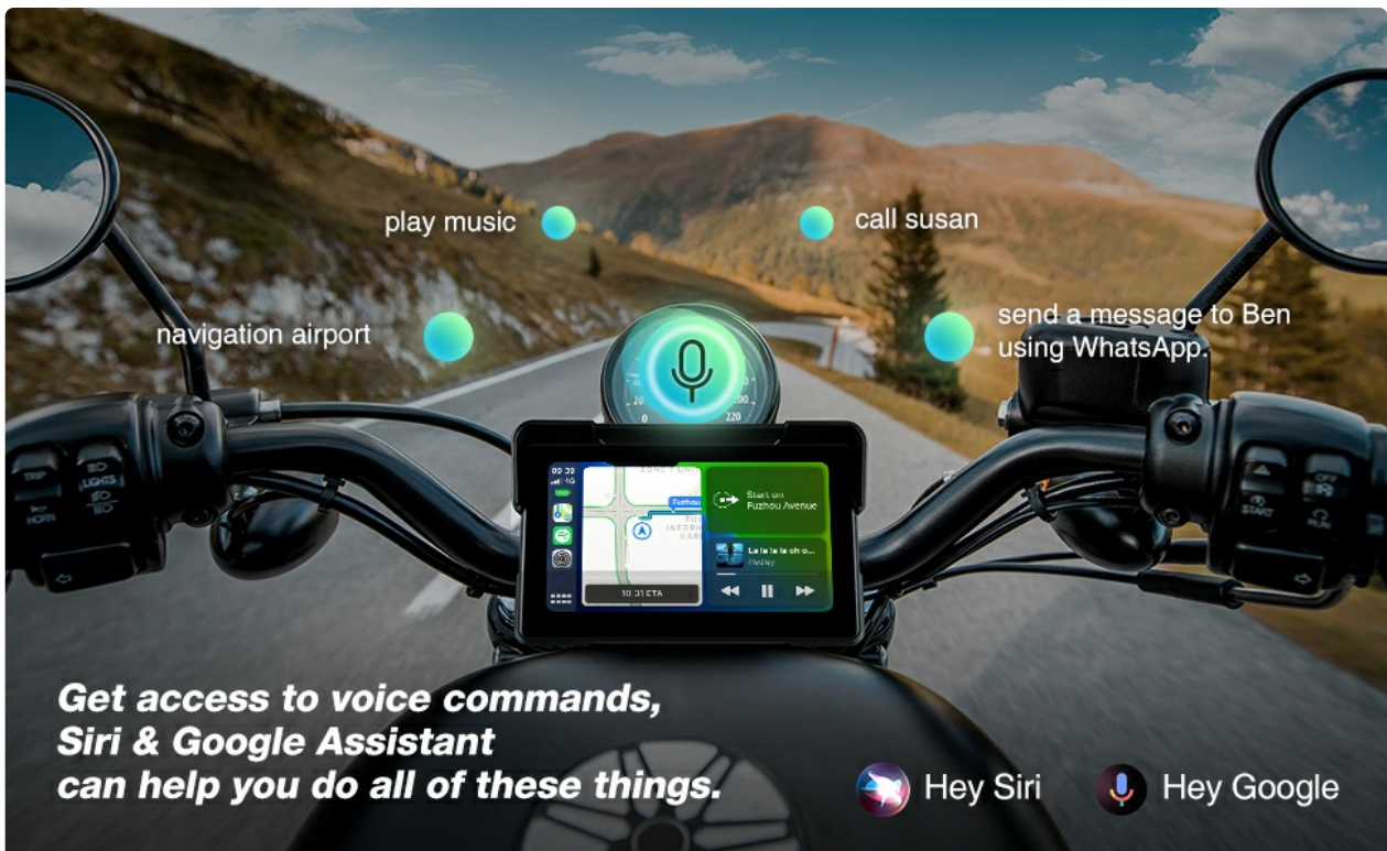
Image: Wireless CarPlay and Android Auto in operation on the motorcycle screen.