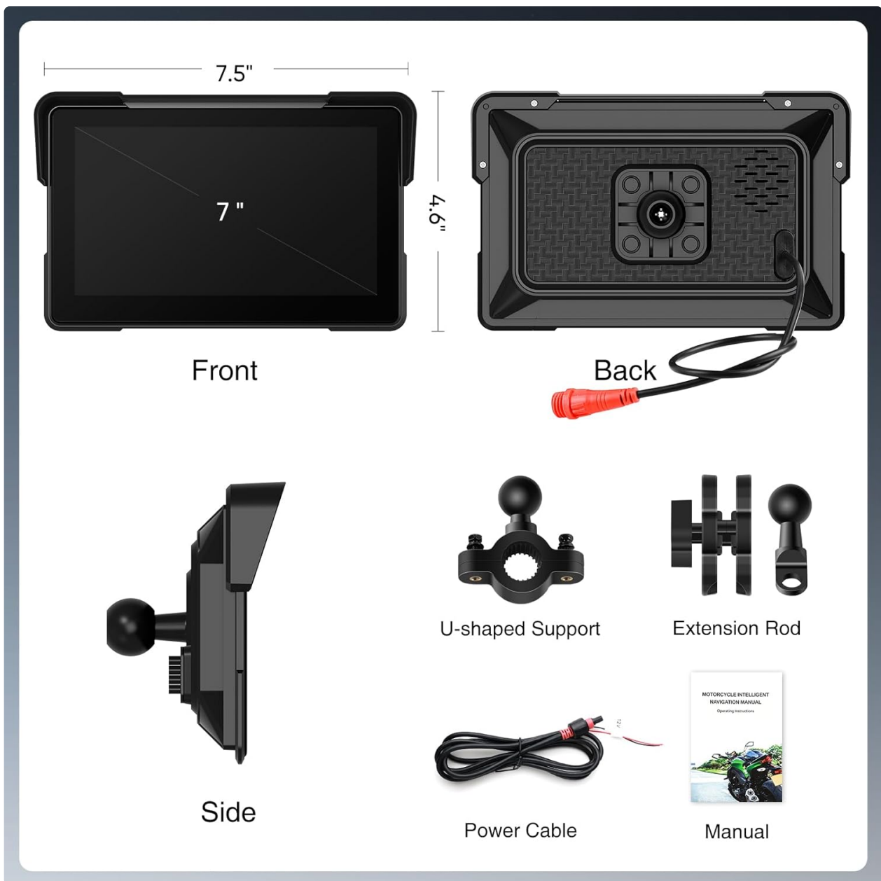
Image: All components included in the GTRUI M570 package.