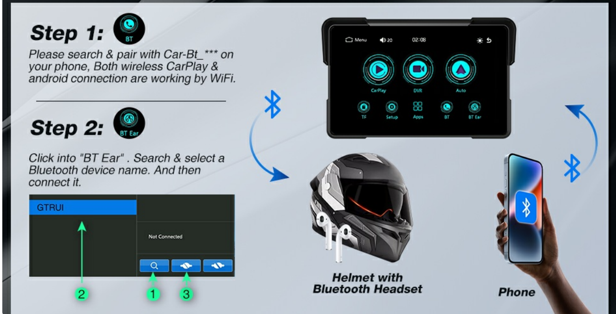
Image: Illustration of the dual Bluetooth connectivity for phone and helmet.