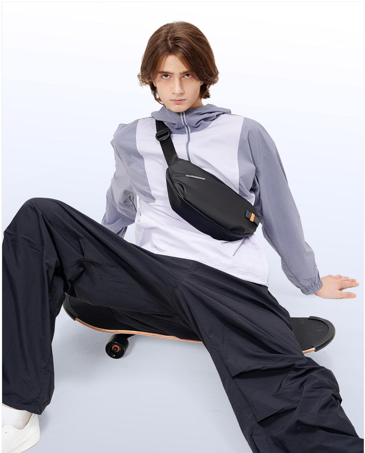
Image: A man wearing the Inateck Sling Bag X-Lite across his back while sitting on a skateboard, demonstrating a typical way to wear the bag for casual use.