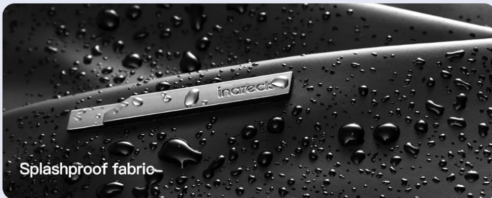
Image: A three-panel image showcasing the durable and protective features of the Inateck Sling Bag X-Lite. It includes close-ups of the YKK zipper for smooth operation, reflective webbing for night visibility, and the splashproof fabric with water droplets on its surface.