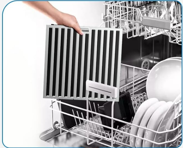
Dishwasher Safe Baffle Filters