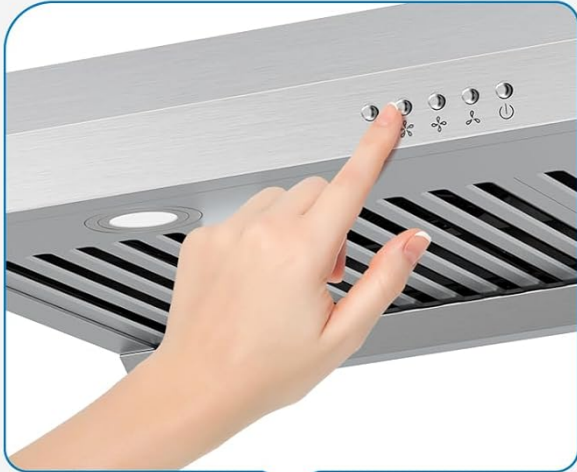
Push Botton Control

4. Filter Installation: Insert the baffle filters into their designated slots.