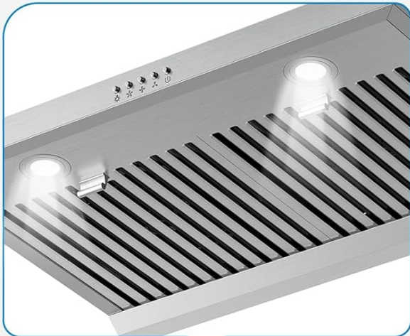
Energy Efficient LED Lighting