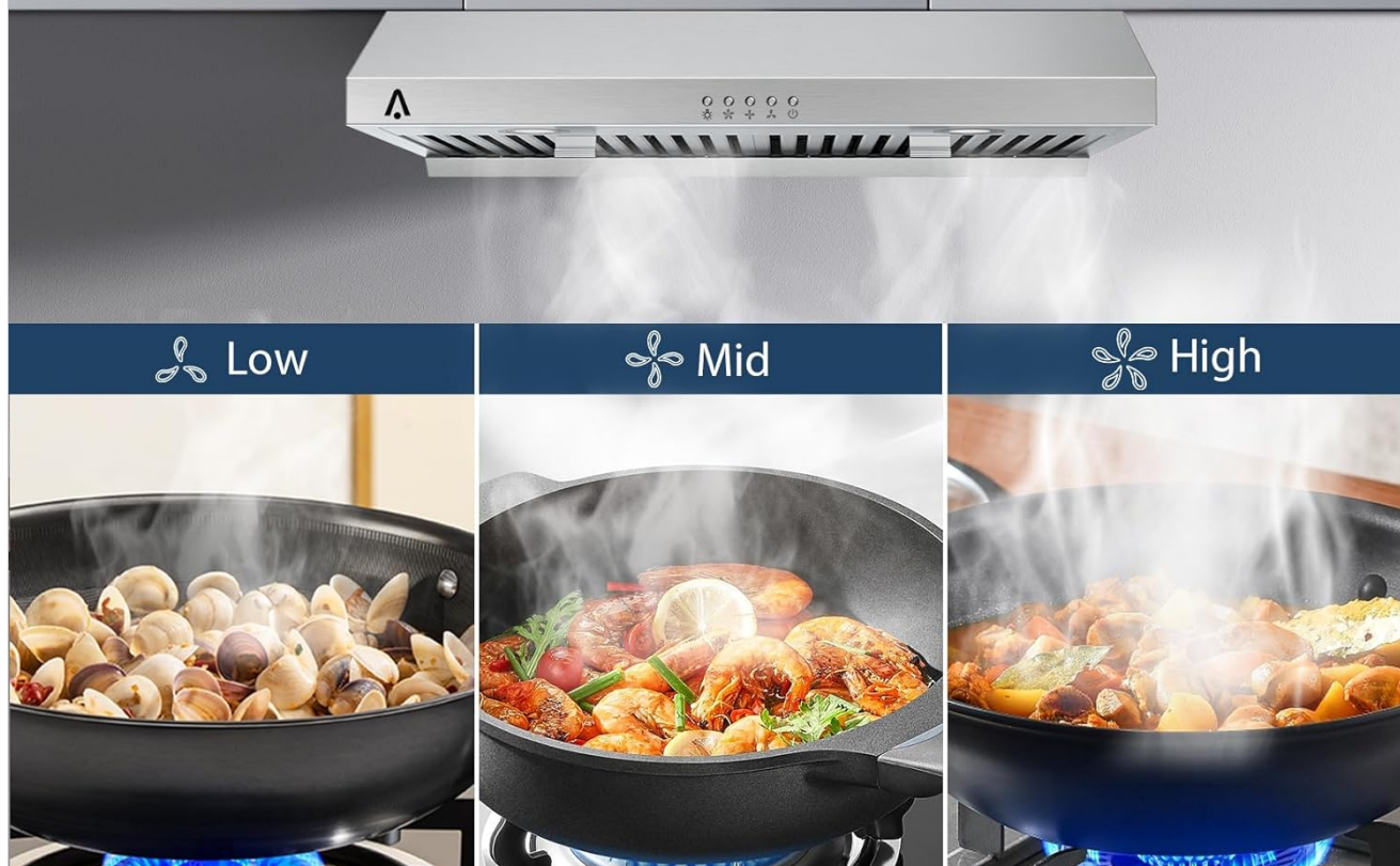
Image: Visual representation of the three exhaust fan speeds (Low, Mid, High) and their effectiveness in purifying odors and smoke during cooking.

Purify unpleasant odors and smoke during cooking