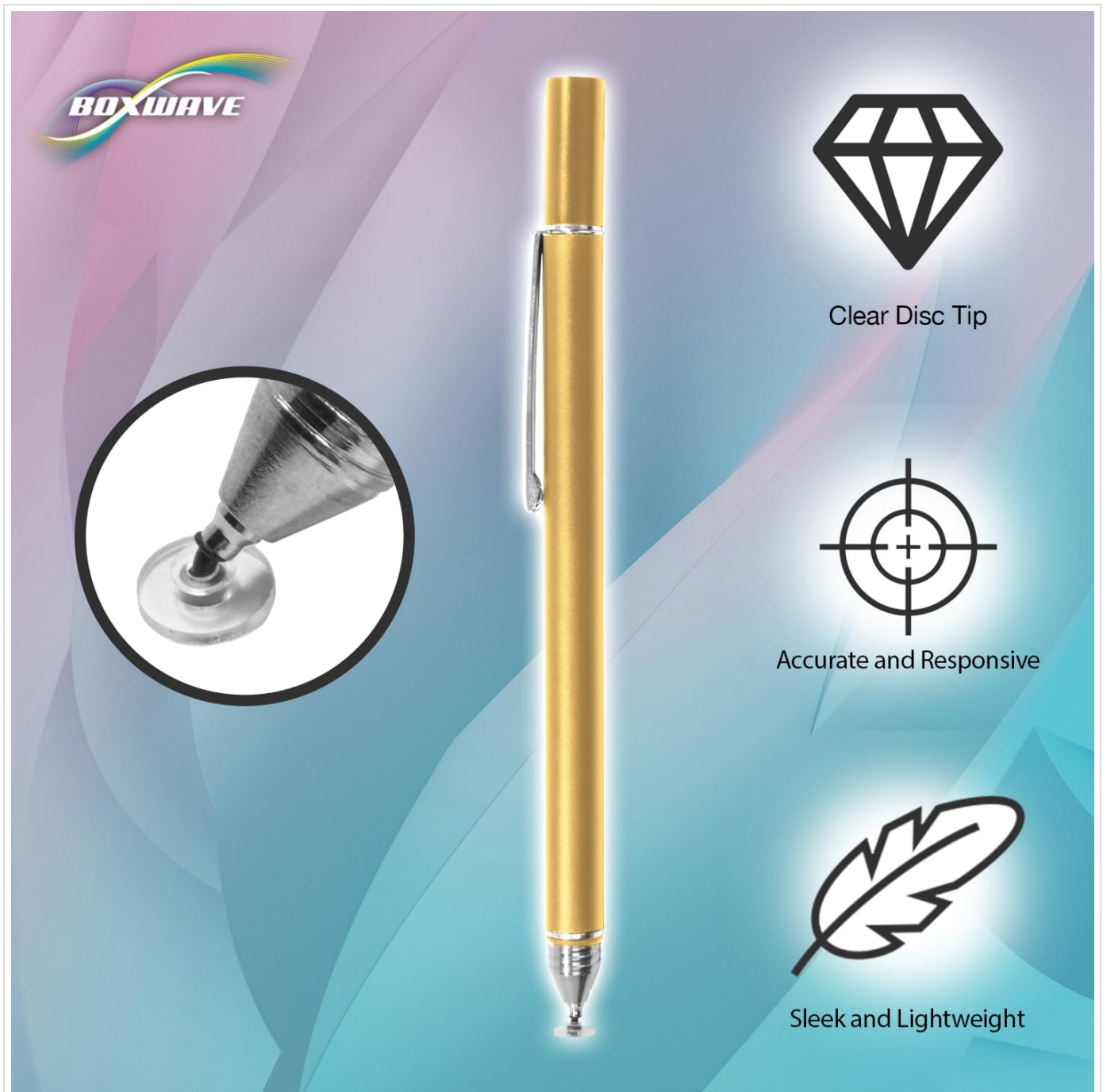
Image: The BoxWave FineTouch Capacitive Stylus, showcasing its clear disc tip, accurate and responsive performance, and sleek, lightweight design.