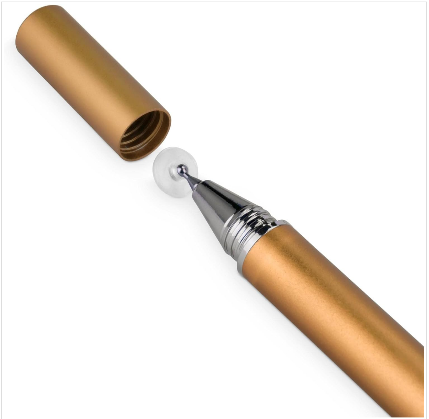
Image: The stylus with its cap removed, showing the clear disc tip ready for use.