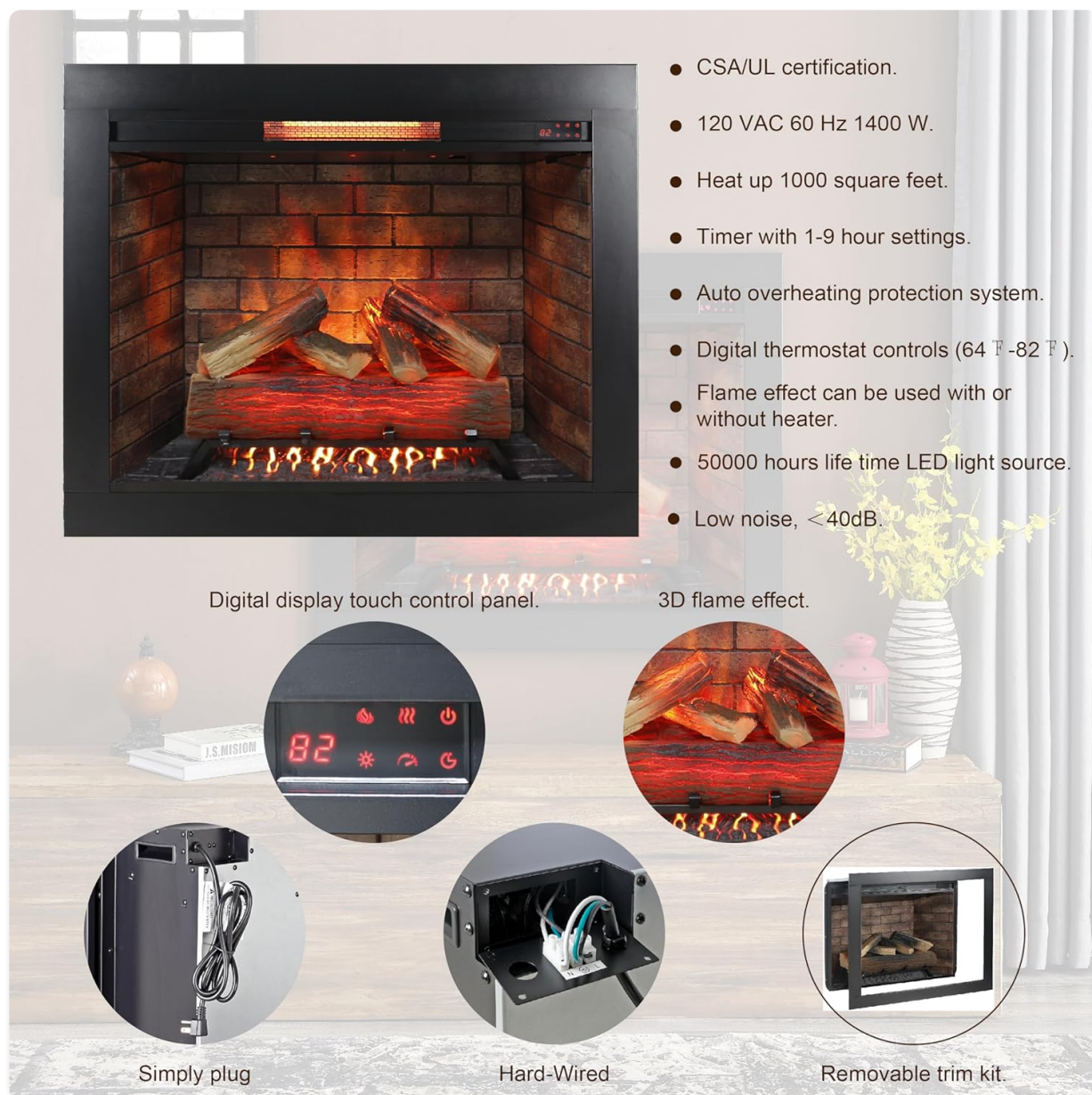
Figure 1: Overview of digital display, touch control panel, 3D flame effect, and power options.