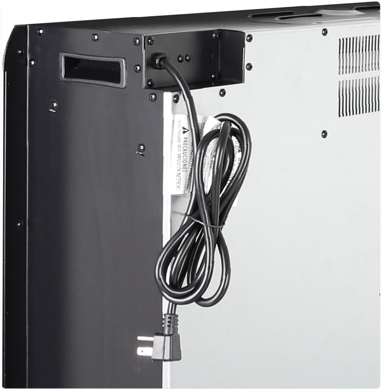
Figure 6: Rear view of the fireplace insert.