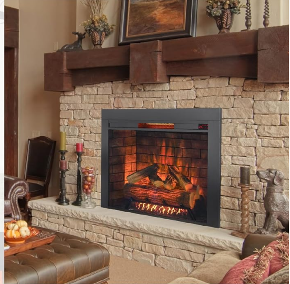
Method 2: Built in wall with U shape trims.