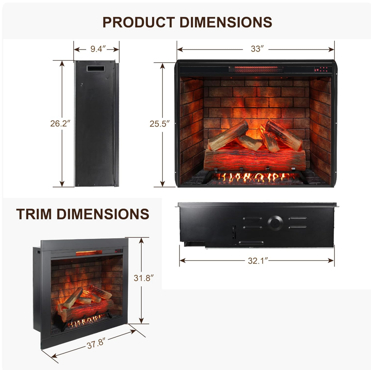
Figure 2: Detailed product and trim dimensions for installation planning.