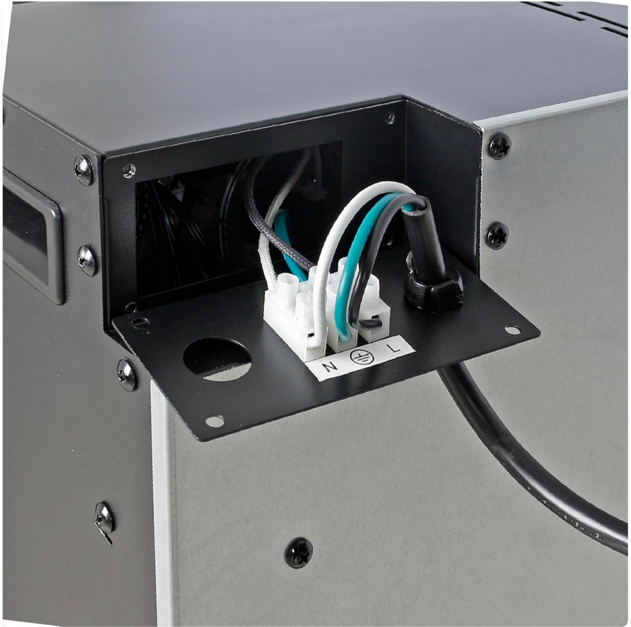
Figure 5: Plug-in cord connection details.