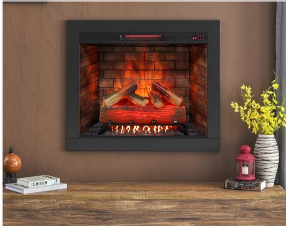
Method 1: Built in wall with surround trims.