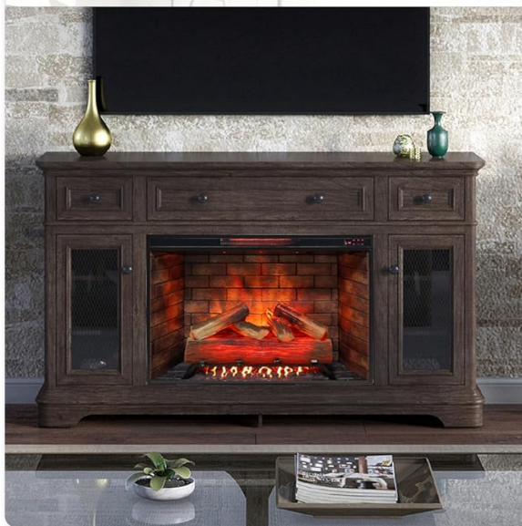
Method 3: Insert to mantel.