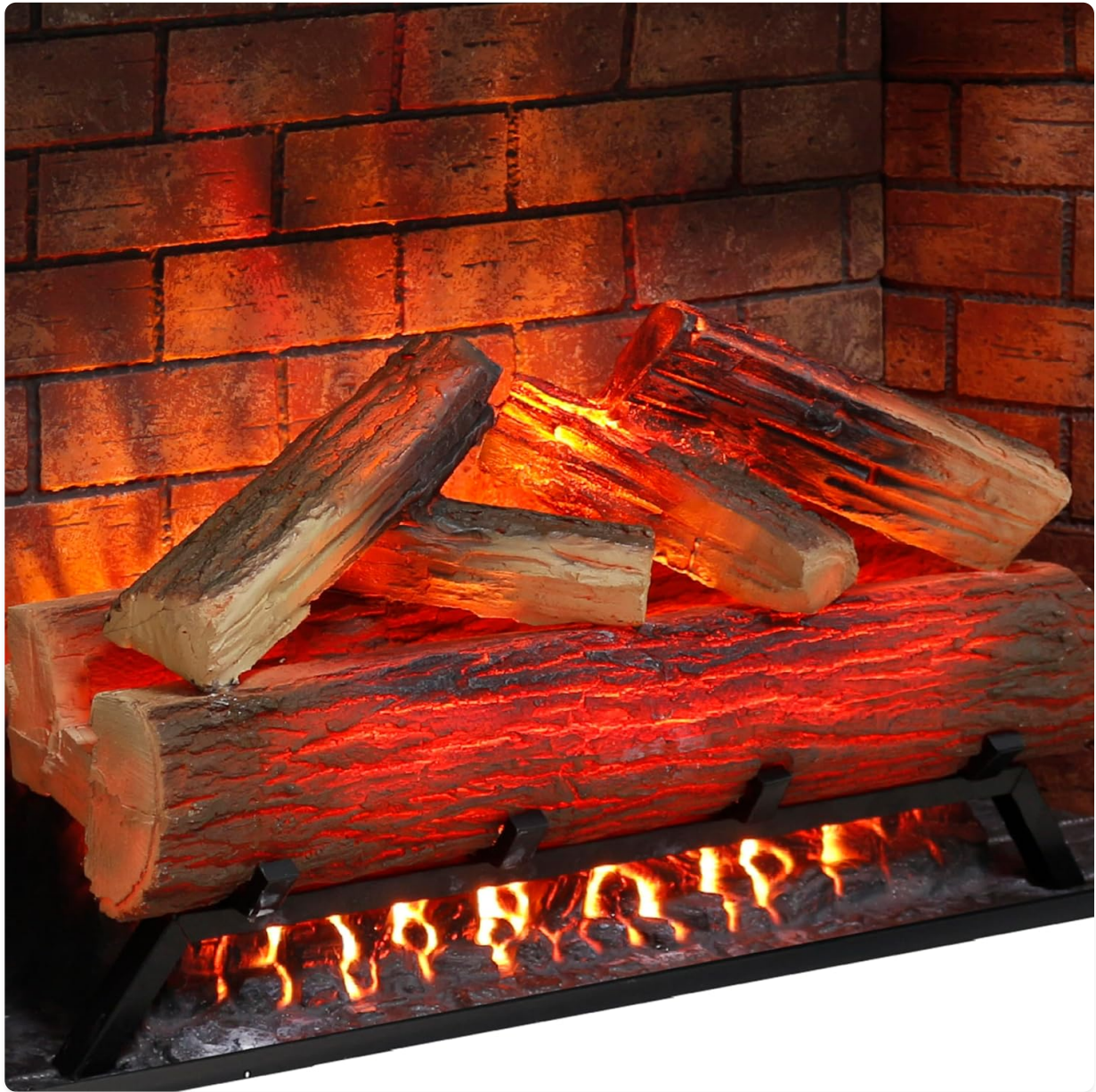
Figure 8: Close-up of the realistic flame and log effect.