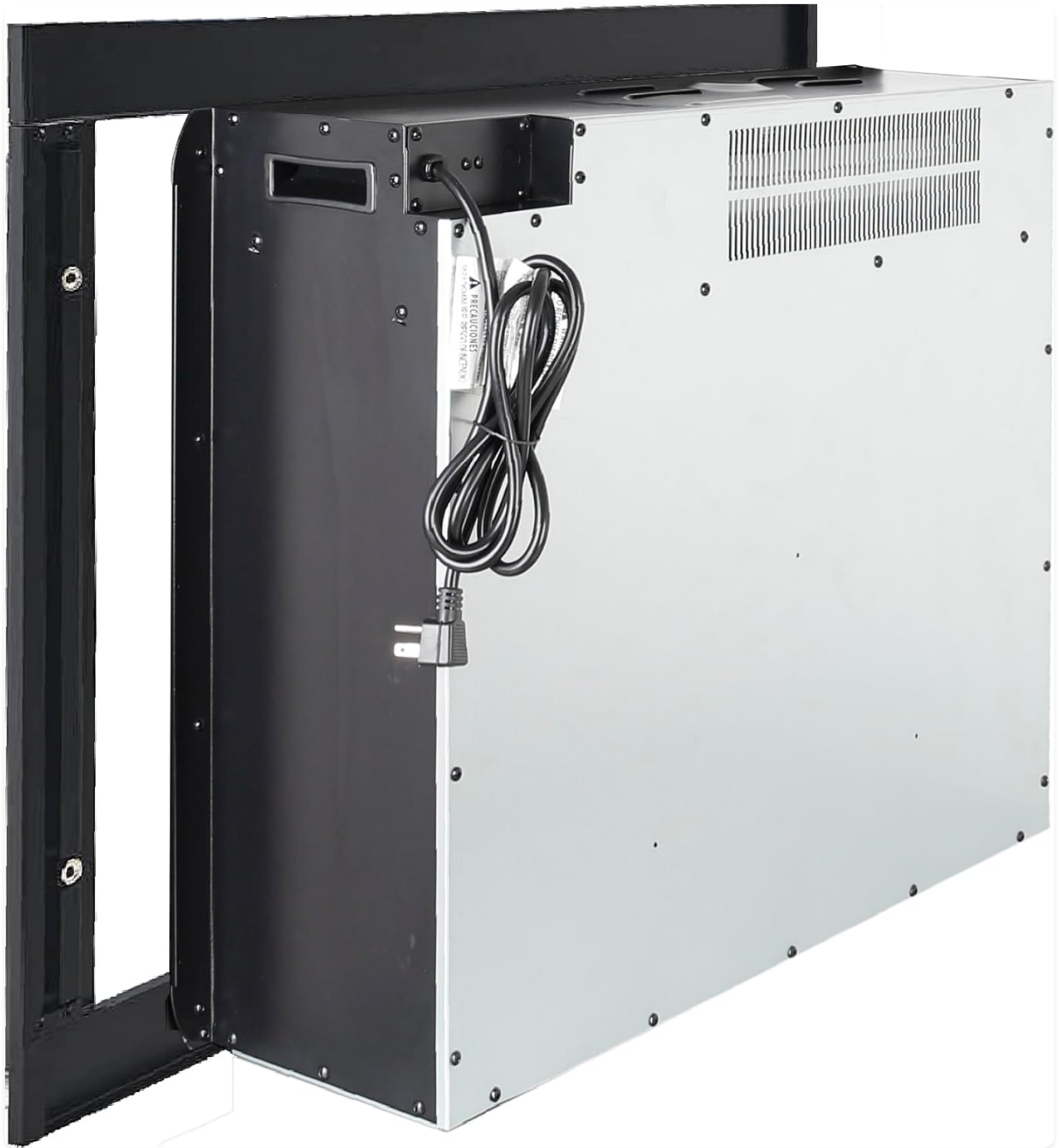
Figure 4: Hardwired installation details.