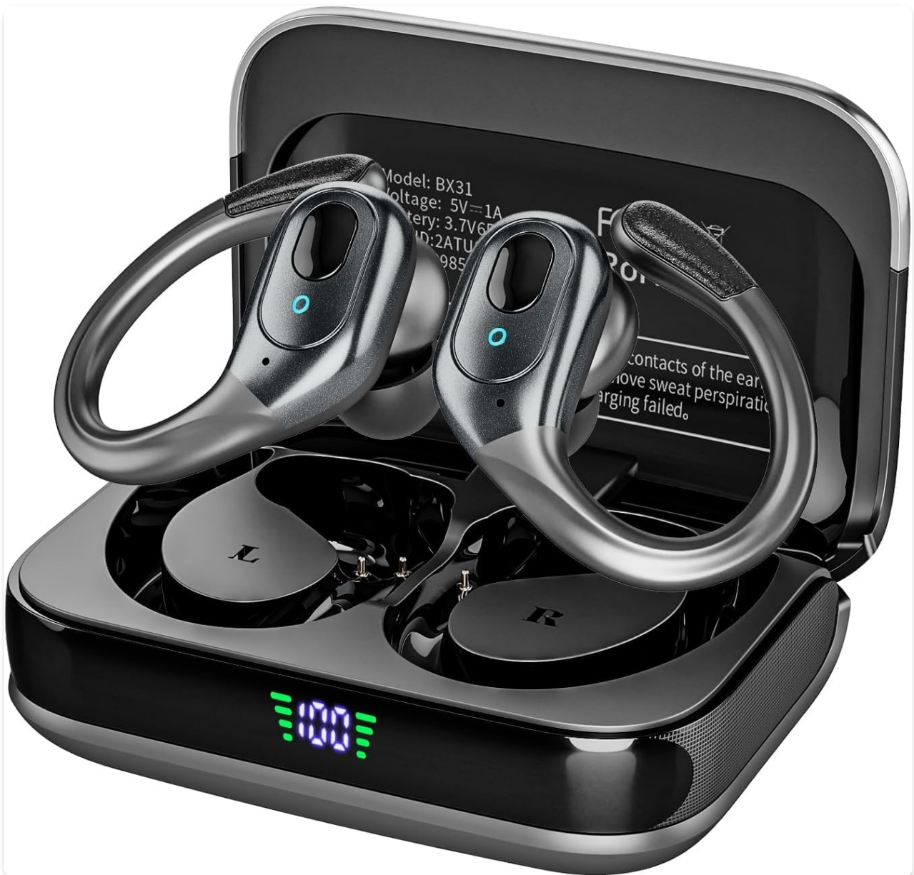
Image: The sajawass Wireless Earbuds in their charging case, displaying the digital battery indicator.