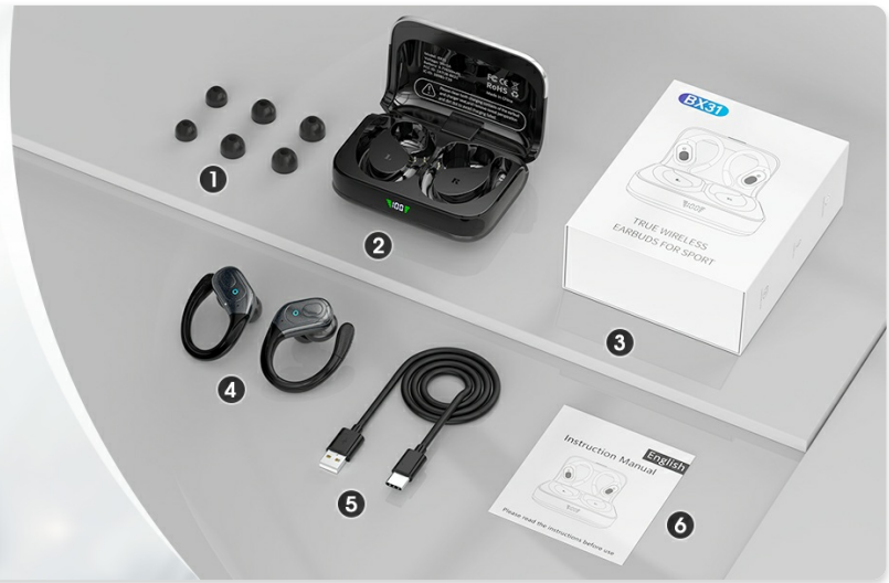
Image: An illustration showing all components included in the product package: earbuds, charging case, ear tips, charging cable, and manual.