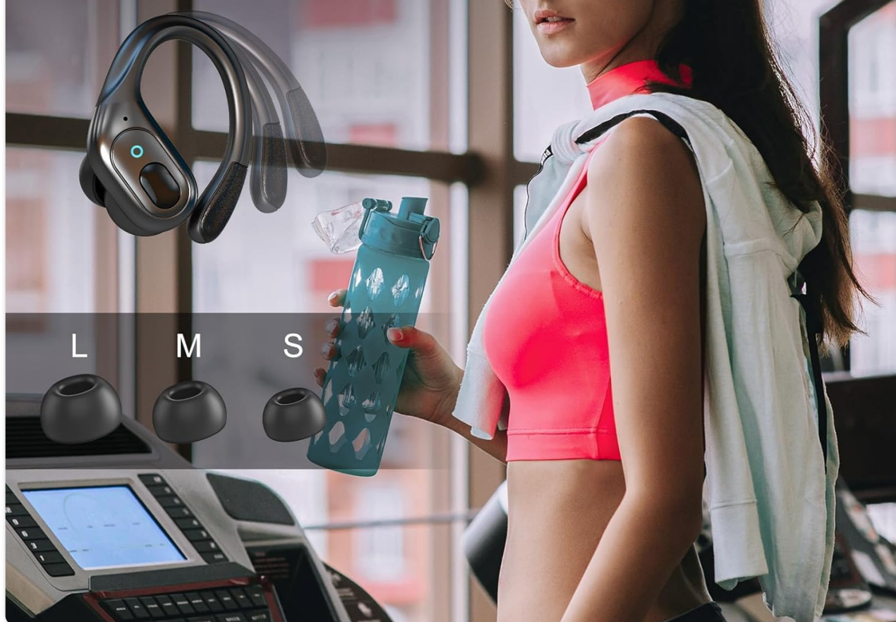
Image: The earbud design featuring flexible ear hooks and different sized ear tips (L, M, S) for a secure fit during exercise.

Ear earbuds and flexible ear hooks of different sizes allow you to enjoy exercise. Light weight, in line with the ergonomic in -ear design, can make your ears more relaxed and comfortable