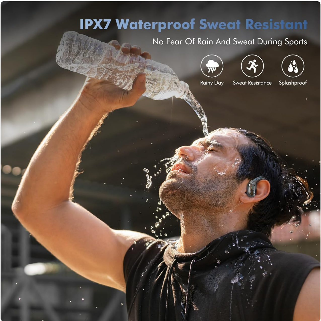
Image: A person pouring water over their head, demonstrating the IPX7 waterproof and sweat-resistant capabilities of the earbuds during sports activities.