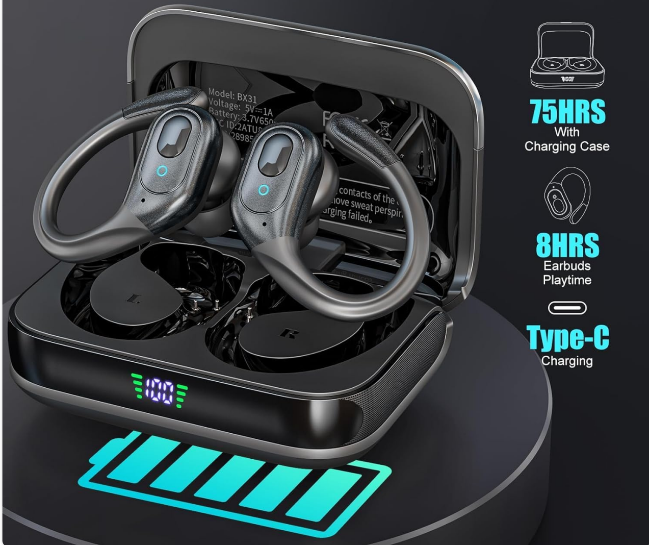
Image: The charging case with earbuds, showing the LED power display and indicating 8 hours of earbud playtime and 75 hours total with the charging case.