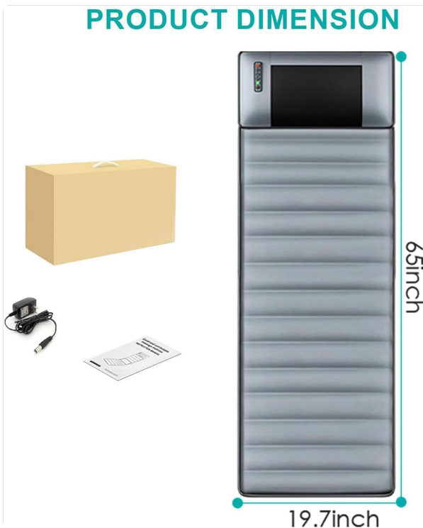
Figure 2.4: Product Dimensions.