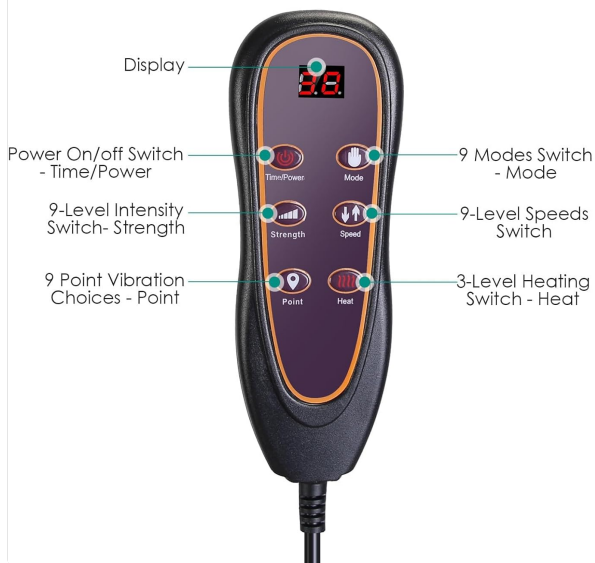
Figure 2.3: Wired Remote Control for the massage mat.

LCD Display, easy to operate, suitable for all ages