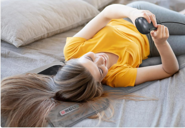
Figure 4.3: 3D Shiatsu Neck Massage in use.

Control button for neck massager Start/stop button; positive/negative kneading switch button; infrared heating button; energy-saving button; 3 modes switch button; 3 kneading speeds button.