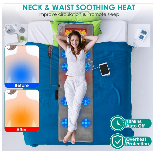
Figure 4.2: Neck & Waist Soothing Heat Function.