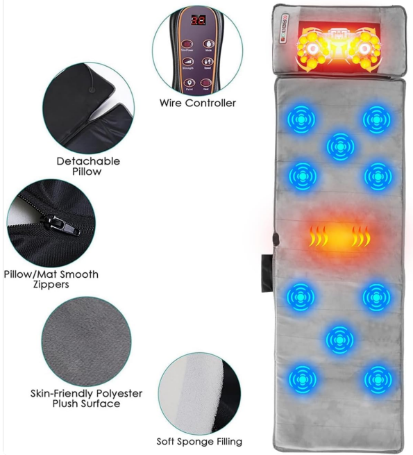
Figure 2.2: Detailed view of product components including the wire controller, detachable pillow, zippers, and material layers.