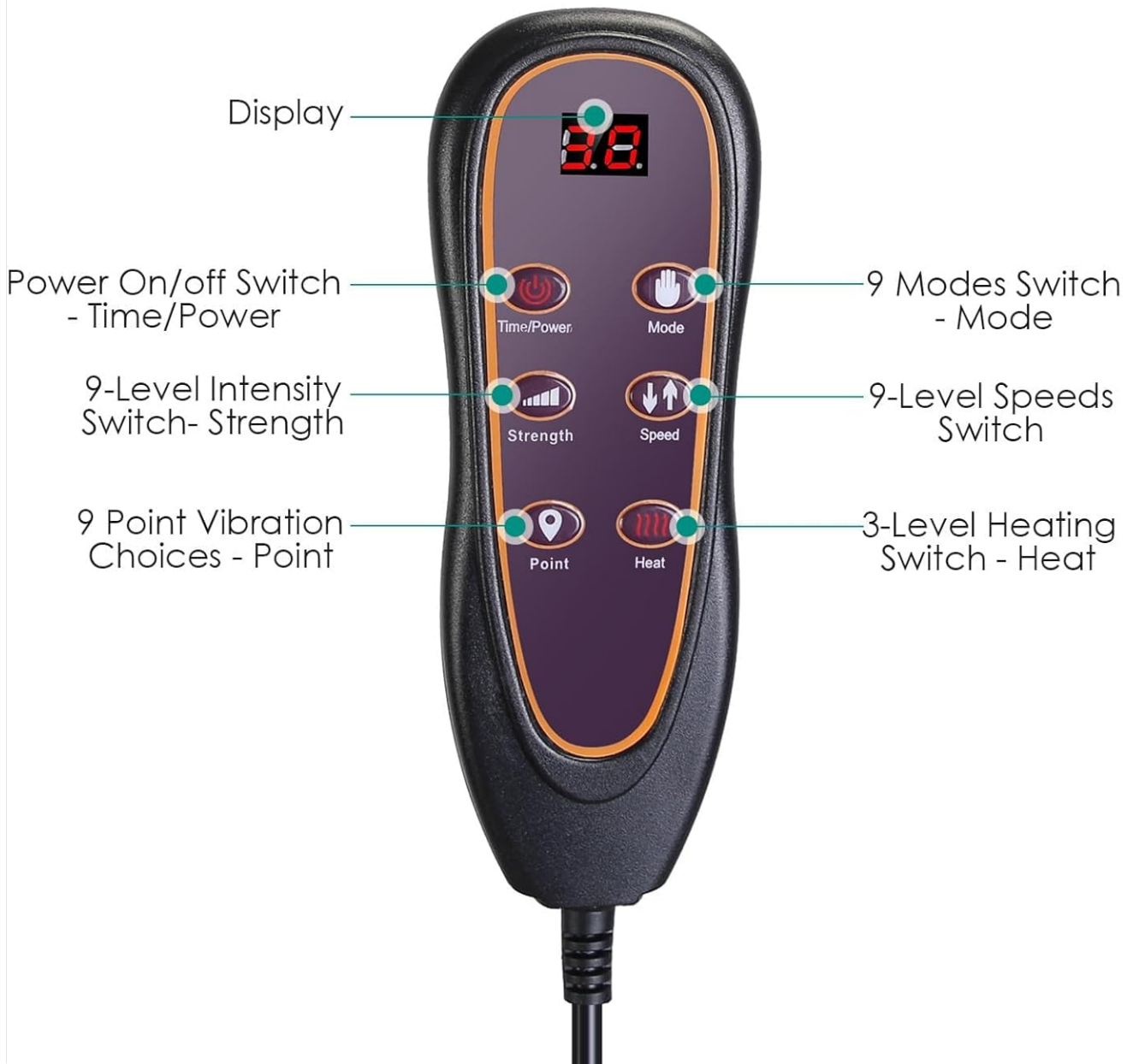
Figure 4.1: Remote Control Layout.

LCD Display, easy to operate, suitable for all ages