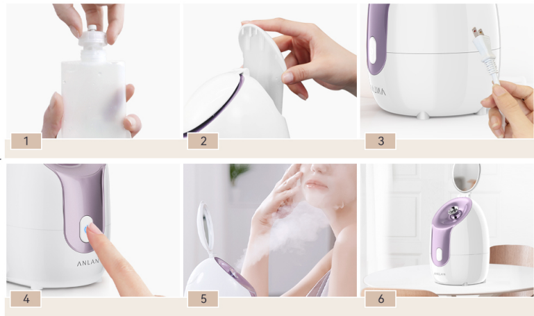
Figure 5: Optimize your skincare routine with regular steaming.