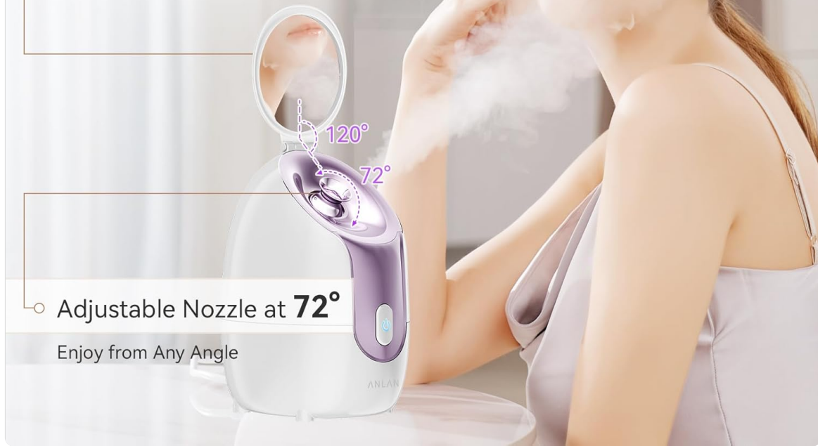
Figure 4: The adjustable nozzle and mirror allow for precise steam application.

Consider incorporating the steamer into your skincare routine as follows: