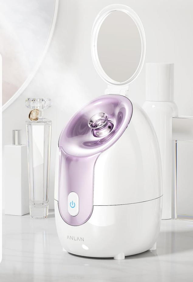
Figure 2: Overview of the facial steamer's main parts.