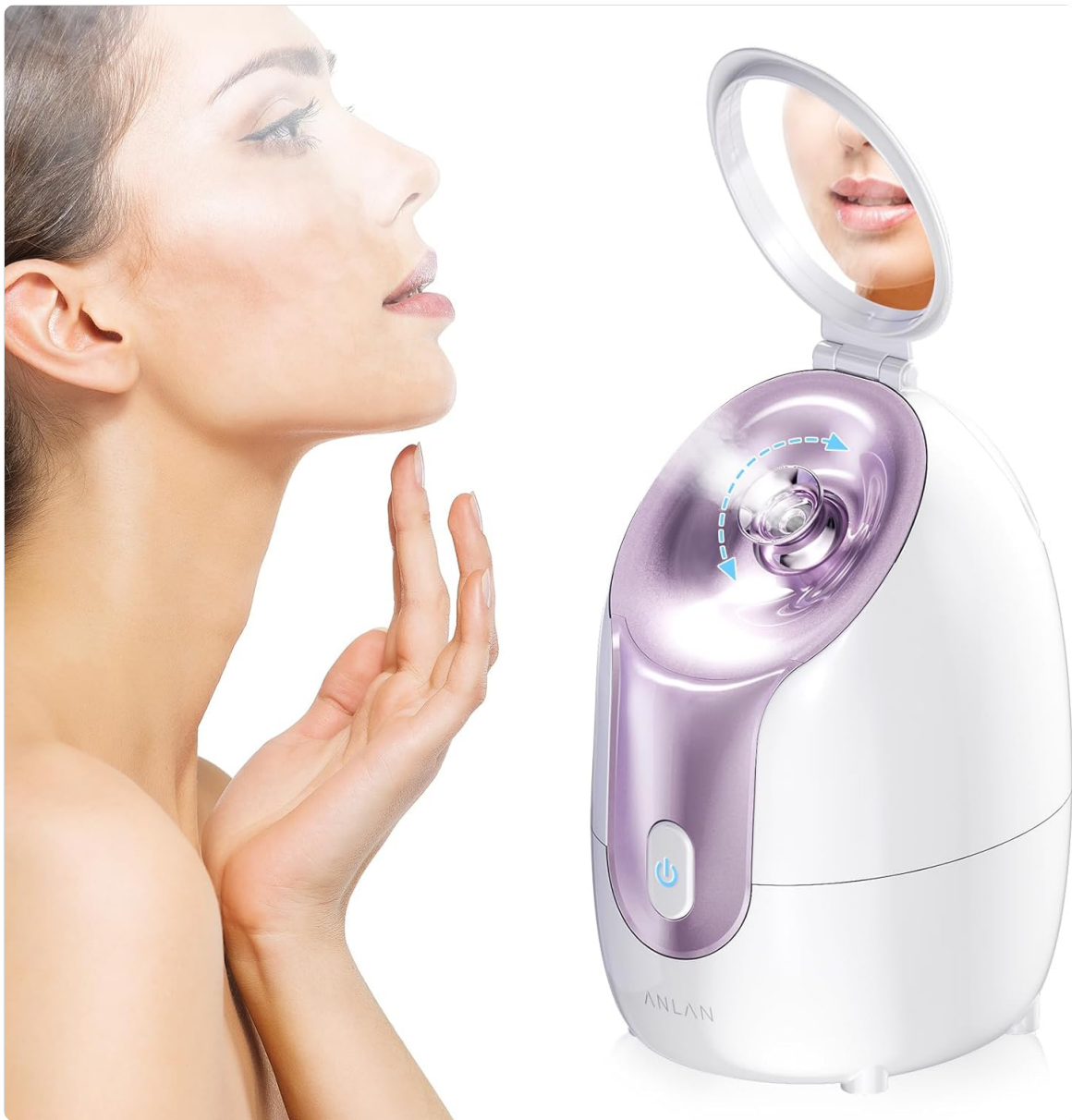
Figure 1: ANLAN Nano Ionic Facial Steamer in use, highlighting its compact design and steam output.

Key benefits include deep hydration, improved blood circulation, and preparation of the skin for cleansing and treatment. The device is compact, easy to operate, and features safety mechanisms for worry-free use.