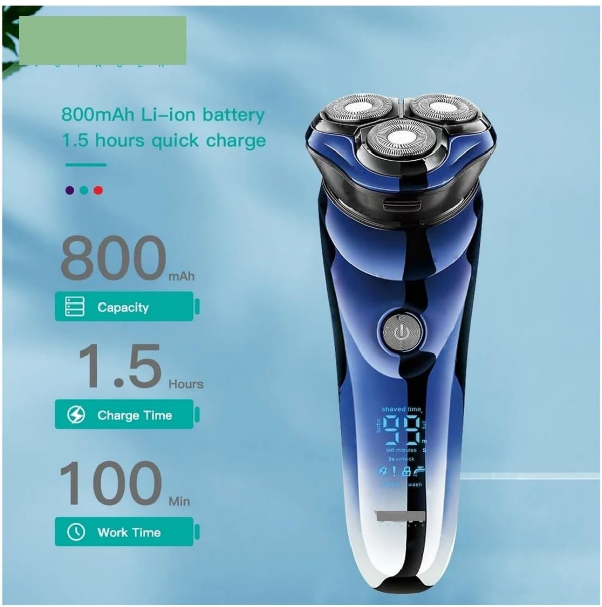
Image 3.3: Close-up view of the shaver's three rotary cutting heads, designed for efficient and comfortable shaving.