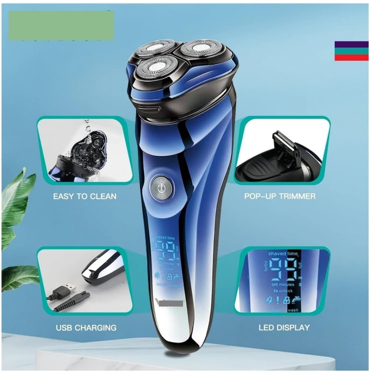
Image 3.1: Visual representation of the shaver's key features: easy cleaning, pop-up trimmer, USB charging, and LED display.