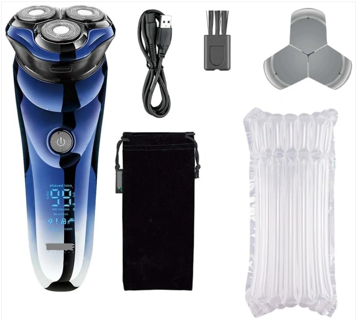
Image 2.1: The EWKYLSEM V-G-R V-305 electric shaver shown with its included accessories: USB charging cable, cleaning brush, protective cap, and storage bag.