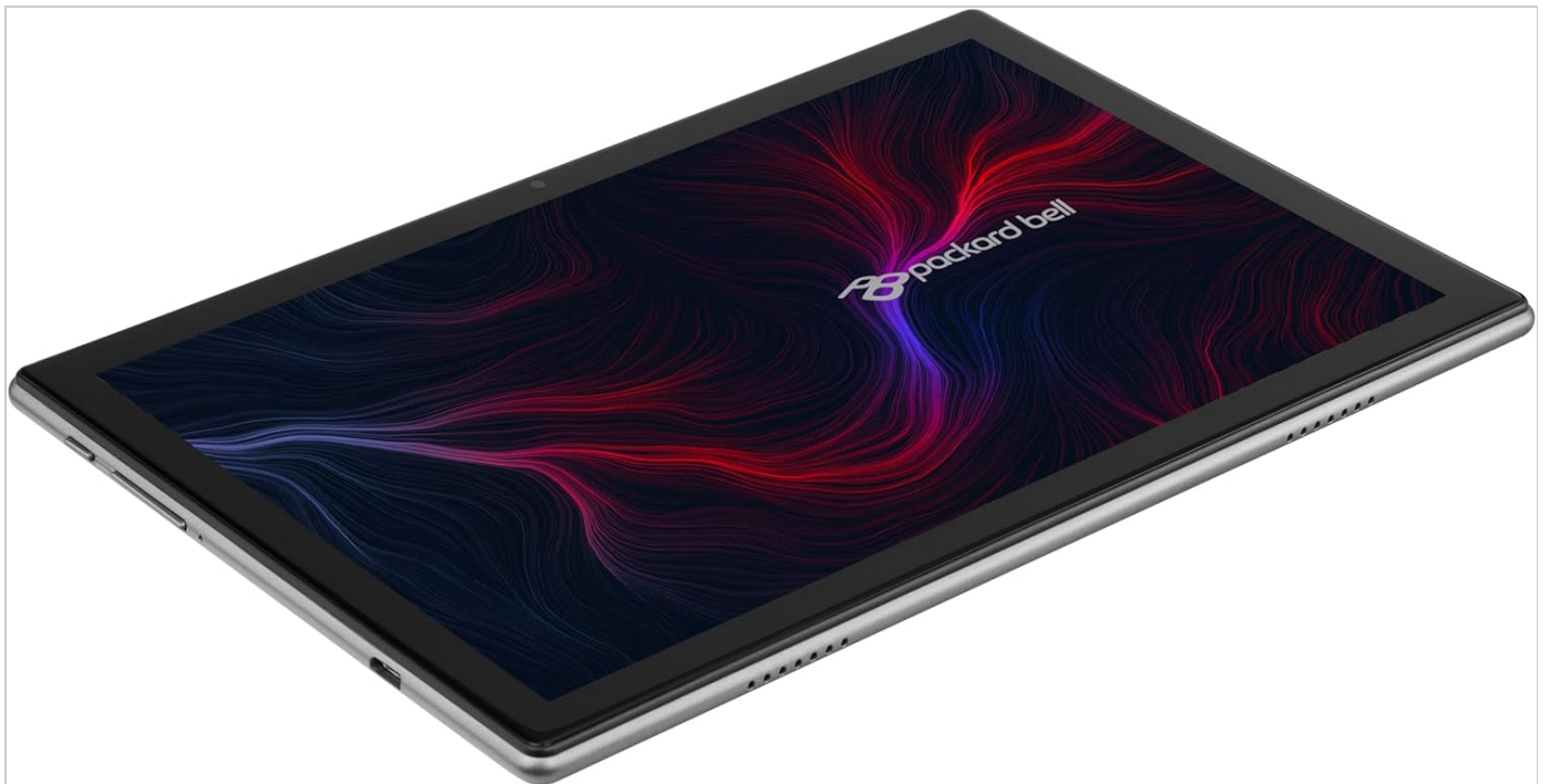
Figure 2: Side View. This image illustrates the side profile of the Packard Bell Silverstone T10 tablet, highlighting the power button, volume rocker, and USB Type-C port.