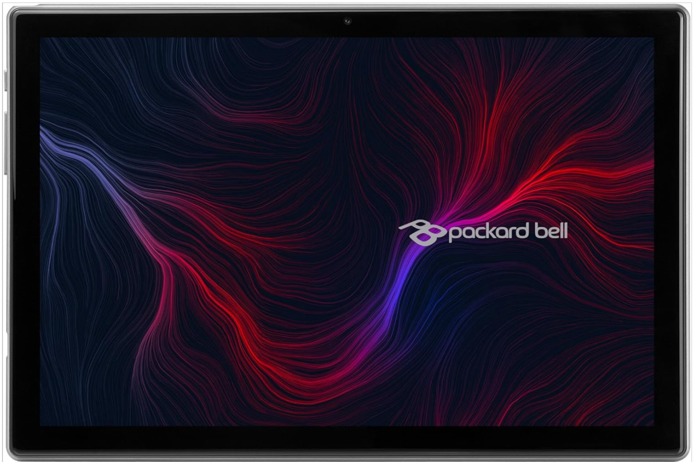
Figure 1: Front View. This image displays the front of the Packard Bell Silverstone T10 tablet, showing the 10.1-inch display and the front-facing camera located at the top center.