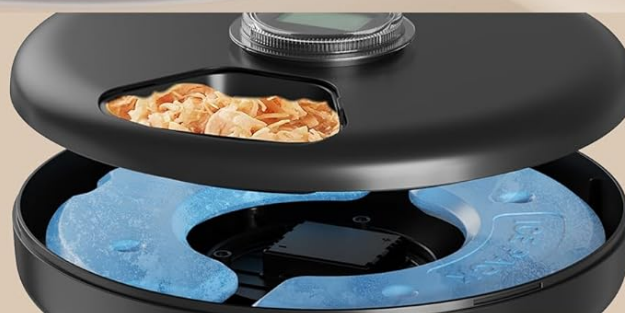
Image: An illustration demonstrating how the twin ice packs are placed within the feeder's base to maintain food freshness.