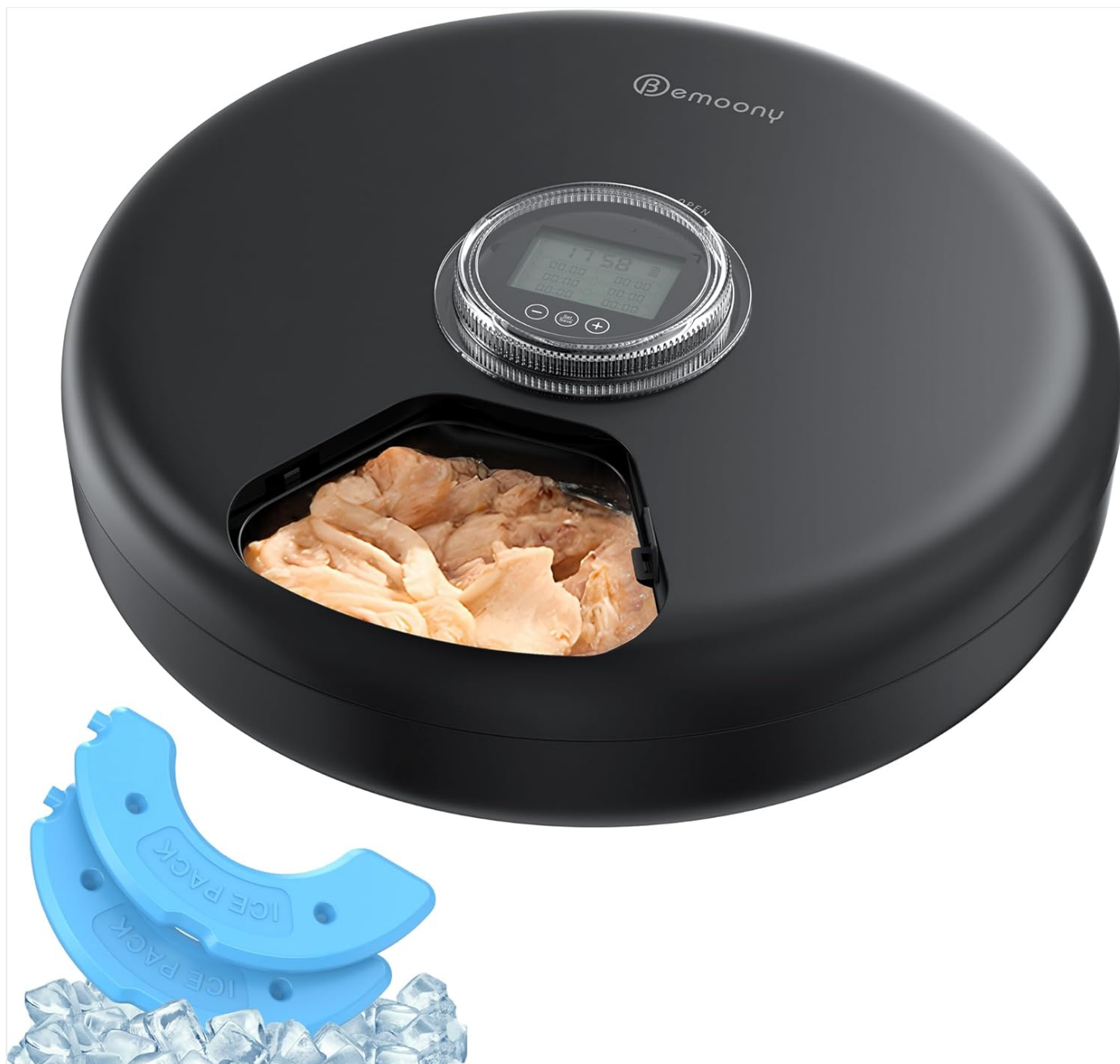
Image: The BEMOONY Automatic Pet Feeder, a round black device with a digital display and a visible food compartment, accompanied by two blue ice packs.