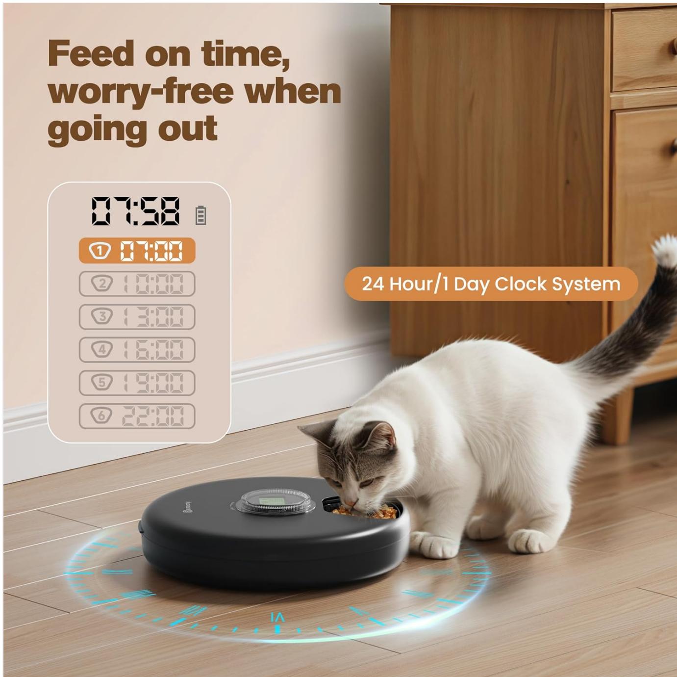
Image: A cat feeding from the unit, with a graphic illustrating the programmable timer and scheduled meal times.