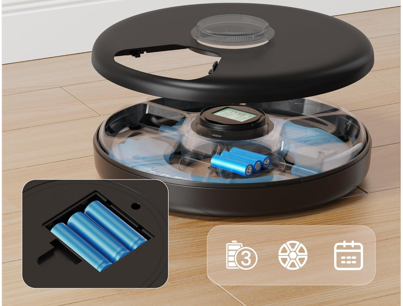
Image: A view of the feeder's underside showing the battery compartment with three AA batteries.