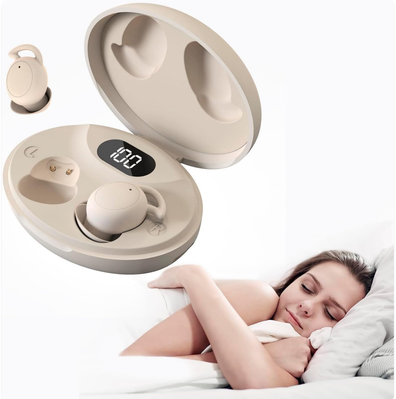
Image: YUANJ Sleepbuds N6 and their charging case, with a person sleeping comfortably in the background. The case displays a '100' power level.