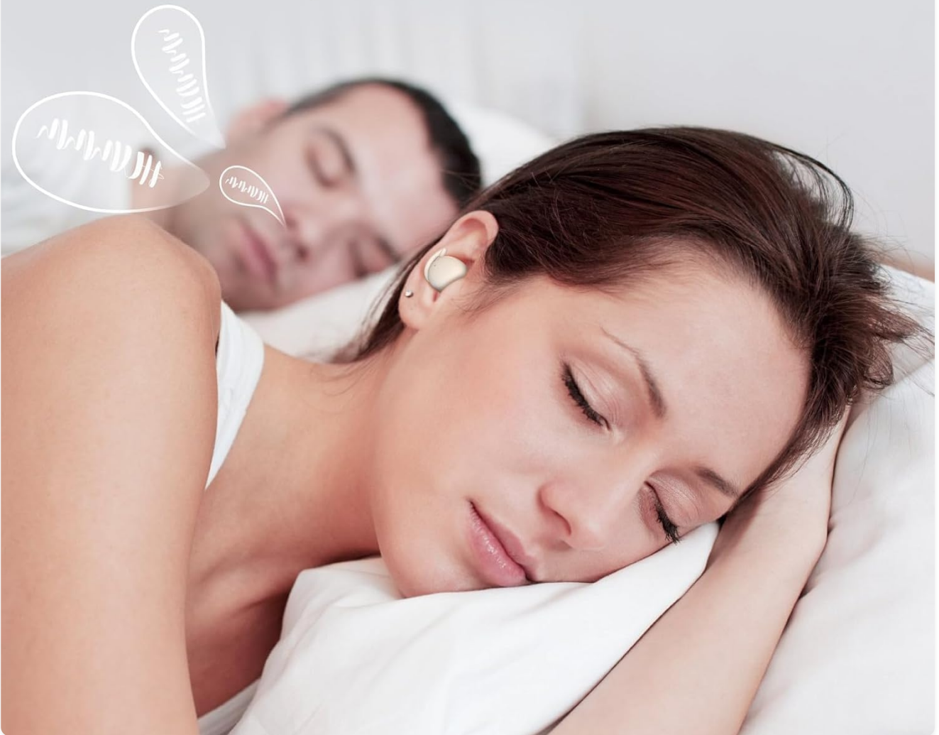
Image: A couple sleeping peacefully, with the YUANJ Sleepbuds N6 highlighted as 'Your Best Sleeping Partner', indicating features like music streaming and no power-off or low battery alarms.