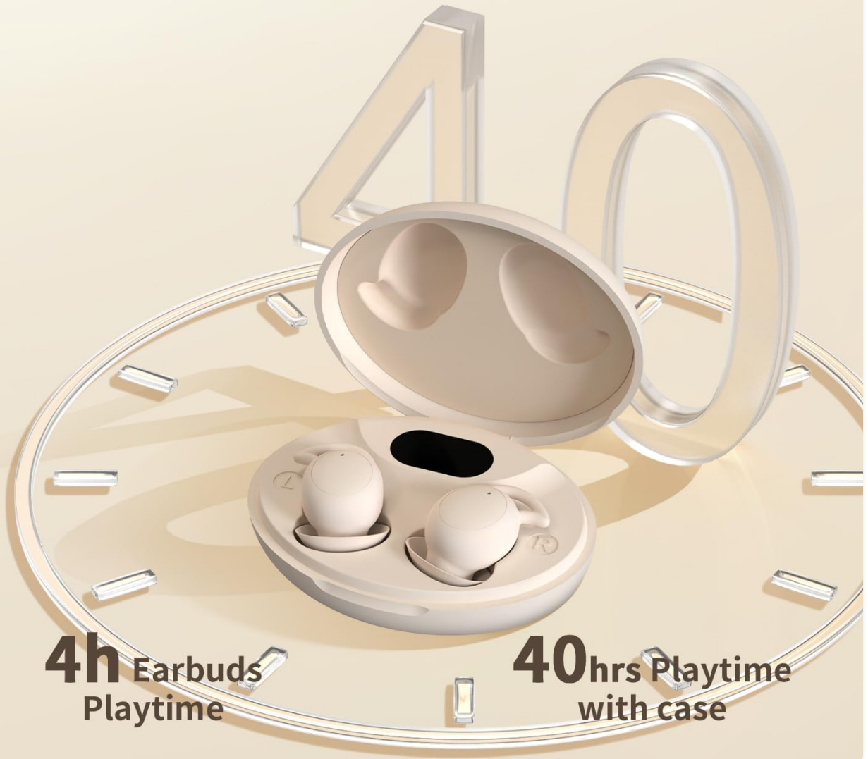
Image: The YUANJ Sleepbuds N6 charging case, highlighting its 40-hour extended battery life for the earbuds.