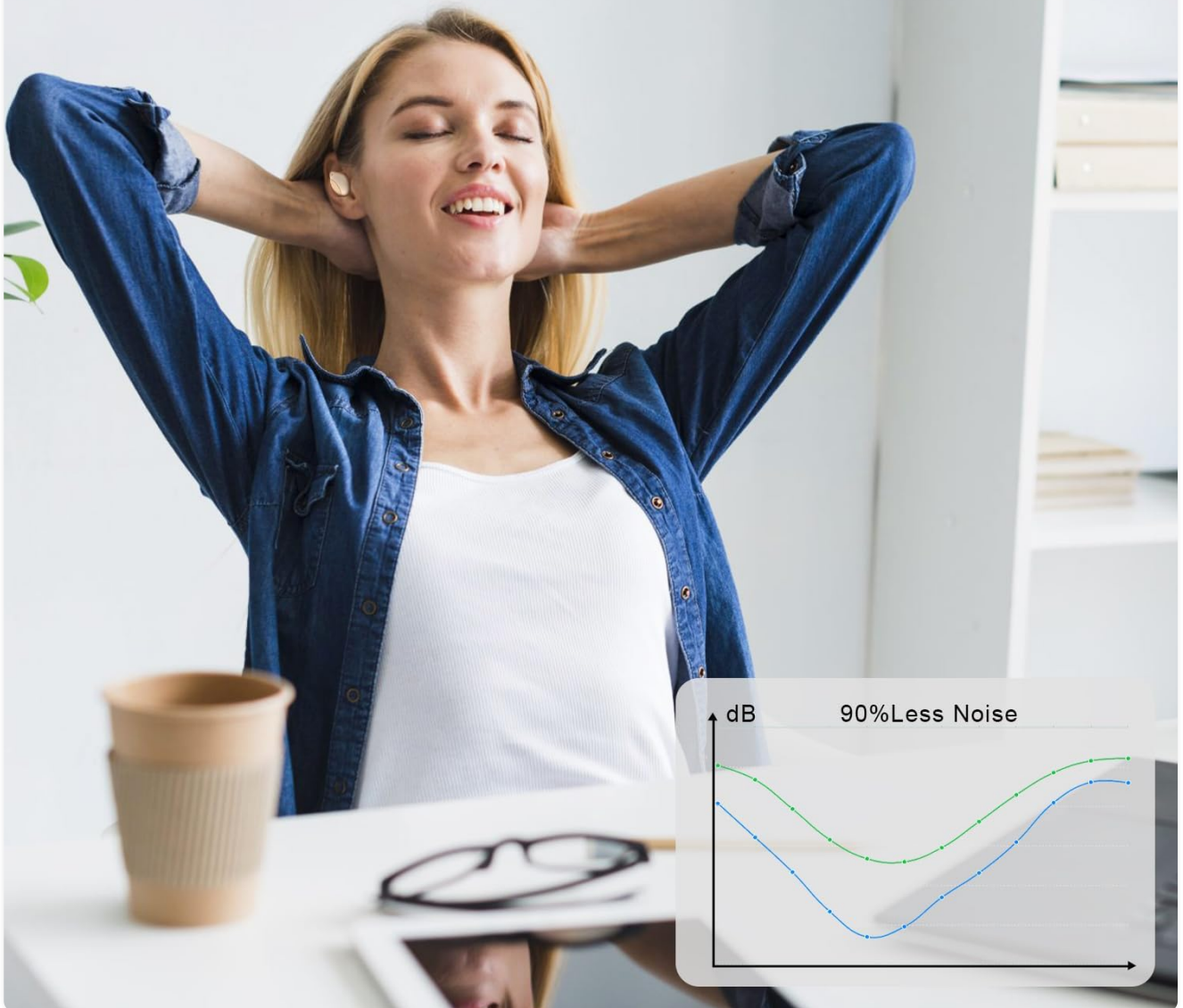
Image: A person relaxing comfortably with YUANJ Sleepbuds N6 in their ears, accompanied by a graph illustrating 90% less noise, demonstrating the noise blocking capability.