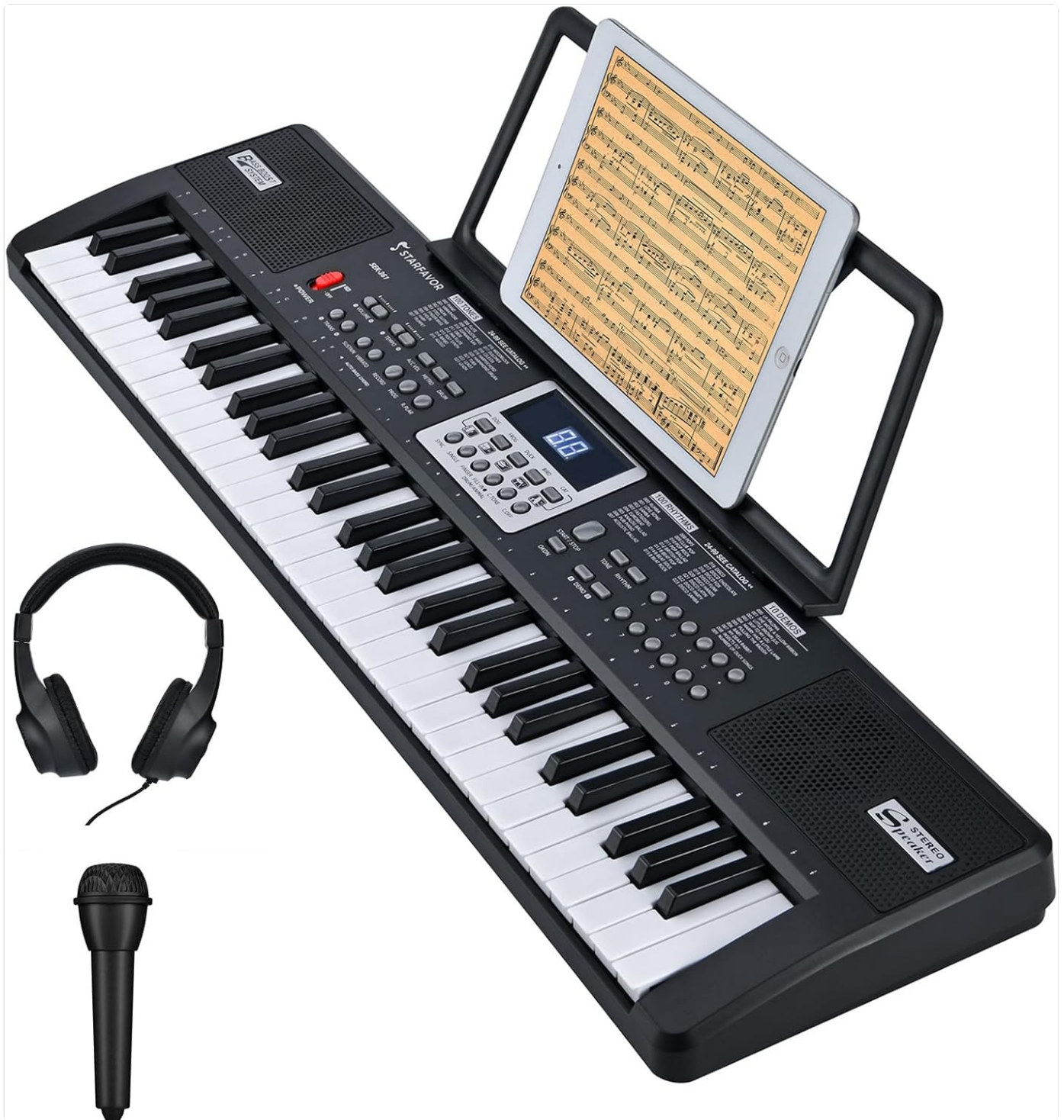
Image: Front view of the Starfavor SEK-361 keyboard with accessories.