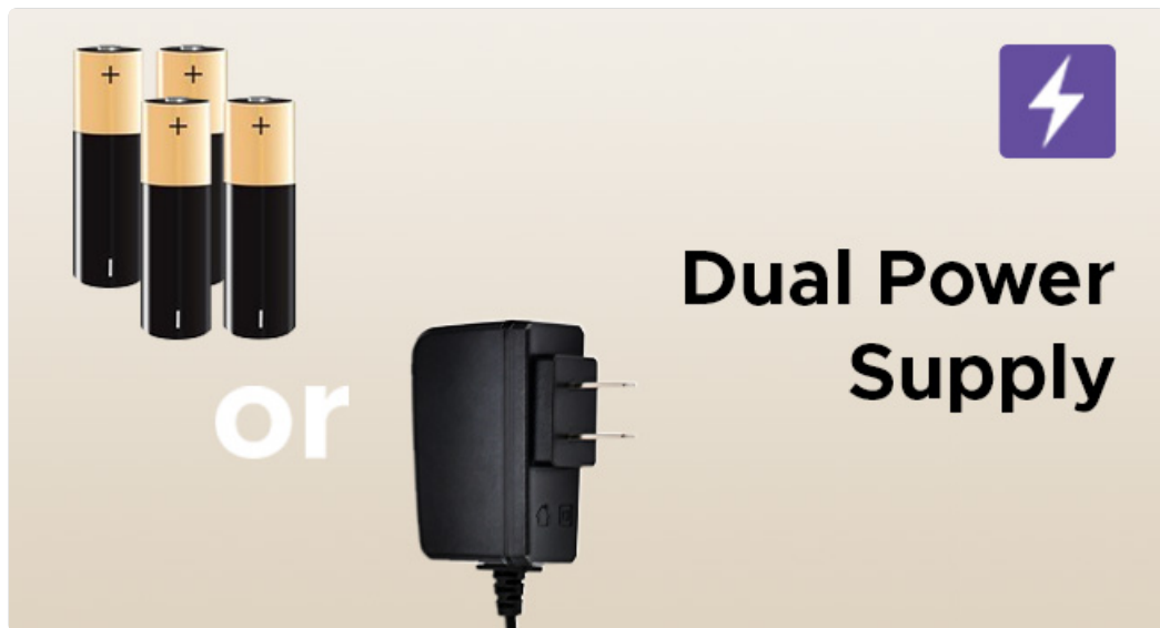
Image: Dual power supply options for the keyboard.