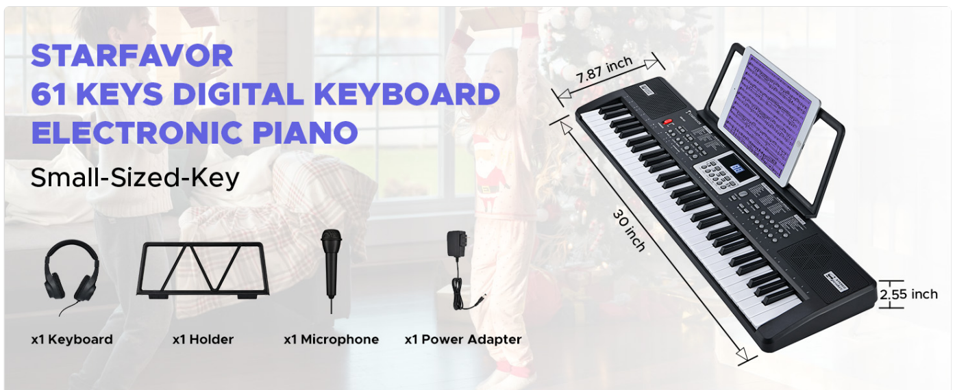
Image: Dimensions of the Starfavor SEK-361 keyboard.