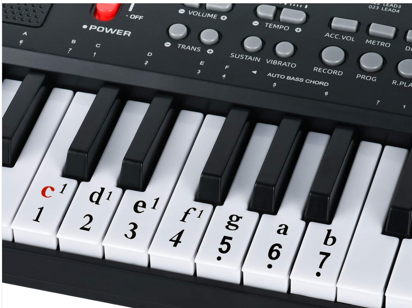
Image: Keyboard keys with optional keynote stickers for learning.