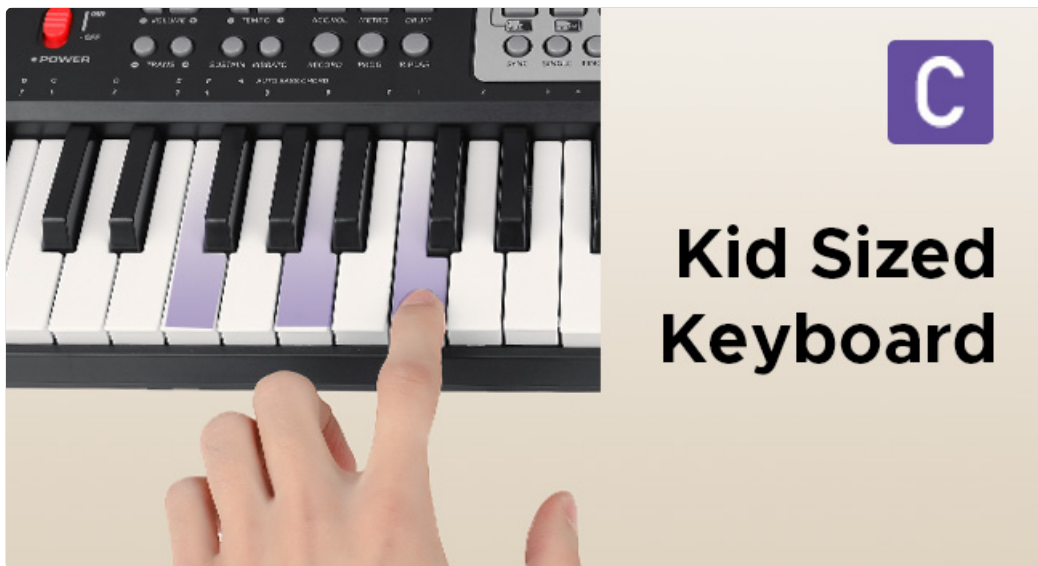
Image: Small-sized keys designed for children's hands.