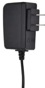
x1 Power Adapter

Image: All components included in the Starfavor SEK-361 package.