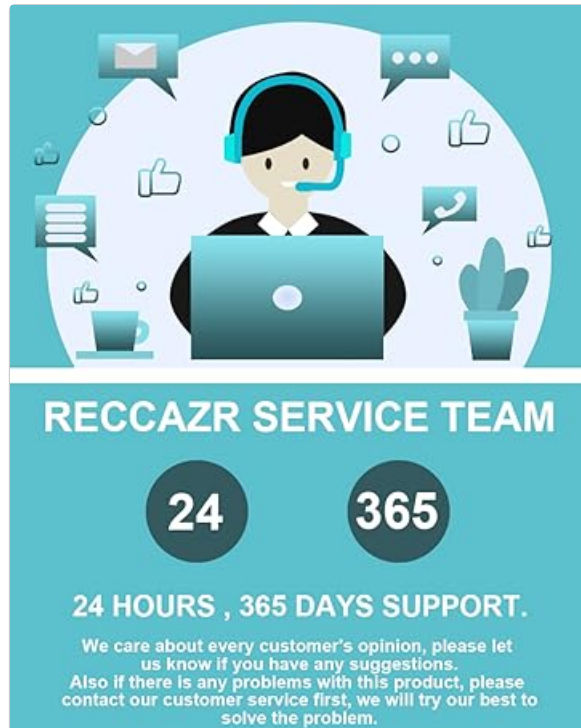
Image: The RECCAZR Service Team is depicted, emphasizing 24 hours, 365 days support for customer inquiries and problem resolution.

RECCAZR offers a 1-year worry-free warranty and a 30-day no-reason refund for this product. For any questions, technical assistance, or warranty claims, please contact RECCAZR customer service. We are dedicated to providing 24/7 support to ensure your satisfaction.