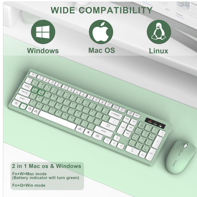
Image: The keyboard and mouse are shown with icons indicating wide compatibility with Windows, Mac OS, and Linux operating systems.