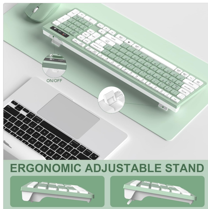
Image: The keyboard is shown with its ergonomic adjustable stand, allowing users to set a comfortable typing angle.