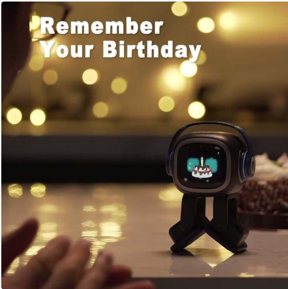
EMO can remember and celebrate your birthday.