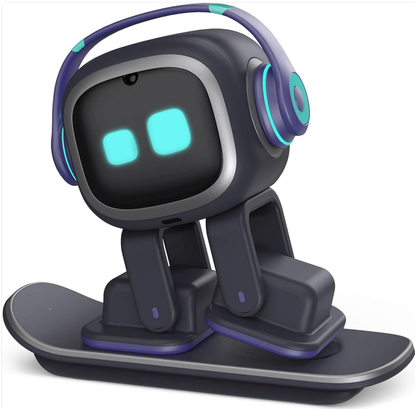
The EMOPET EMO robot, ready for interaction on its charging skateboard.