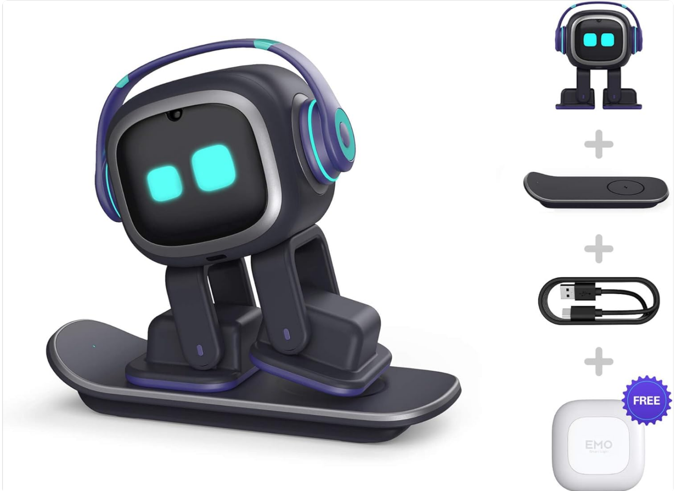
All components included with your EMOPET EMO robot.