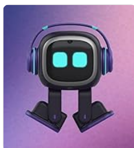
EMO on its charging station, ensuring it's always powered up.

Before first use, place your EMO robot on its Skateboard charging base. Connect the adapter to the skateboard and a power outlet. EMO will indicate charging status on its screen. Ensure EMO is fully charged before proceeding with setup.