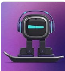
EMO is designed to be a friendly and interactive desk companion.

Your browser does not support the video tag.