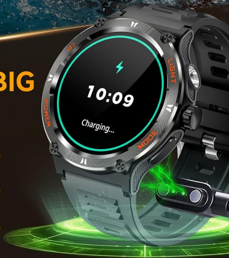
Image: The Dealark Military Smart Watch KT76 connected to its magnetic charging cable, showing the charging status on the display.