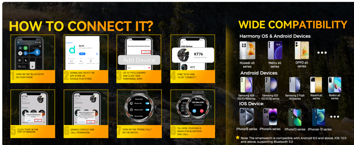
Image: Visual instructions for connecting the smartwatch to your phone via the "Da Fit" app, showing Bluetooth settings, app interface, and pairing steps.