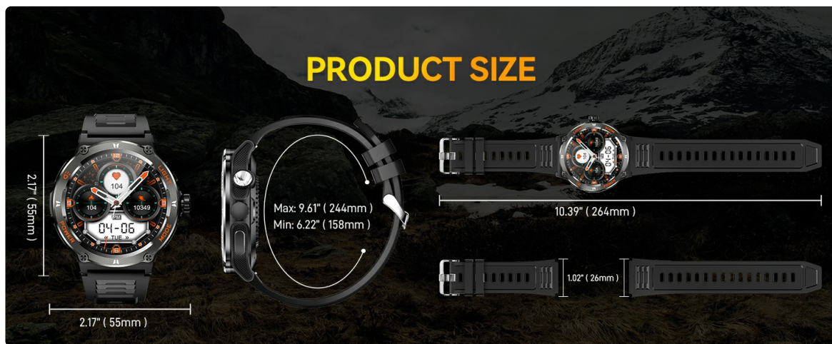
Image: A diagram illustrating the physical dimensions of the smartwatch and its strap.