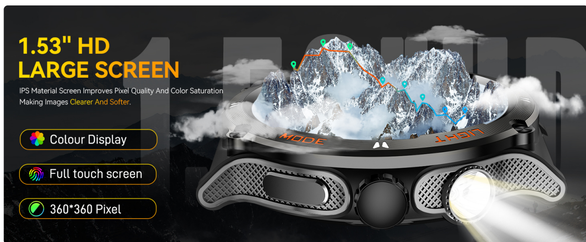
Image: The Dealark Military Smart Watch KT76 showcasing its 1.53-inch HD large screen and the integrated LED flashlight.