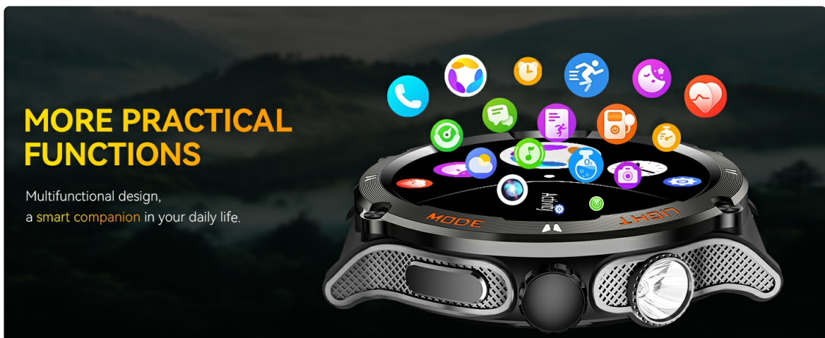
Image: The smartwatch screen showing a grid of icons representing various practical functions available on the device.

The smartwatch includes additional features such as SOS function, Camera Control, Calendar, Calculator, Voice Assistant, Music Control, Alarm Clock, Stopwatch, Weather, and Find Phone.