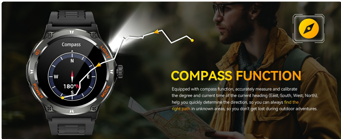
Image: The smartwatch screen showing the compass function, indicating direction, with a person navigating outdoors.

The built-in compass helps you accurately measure and calibrate your current heading, assisting with navigation in unknown areas.