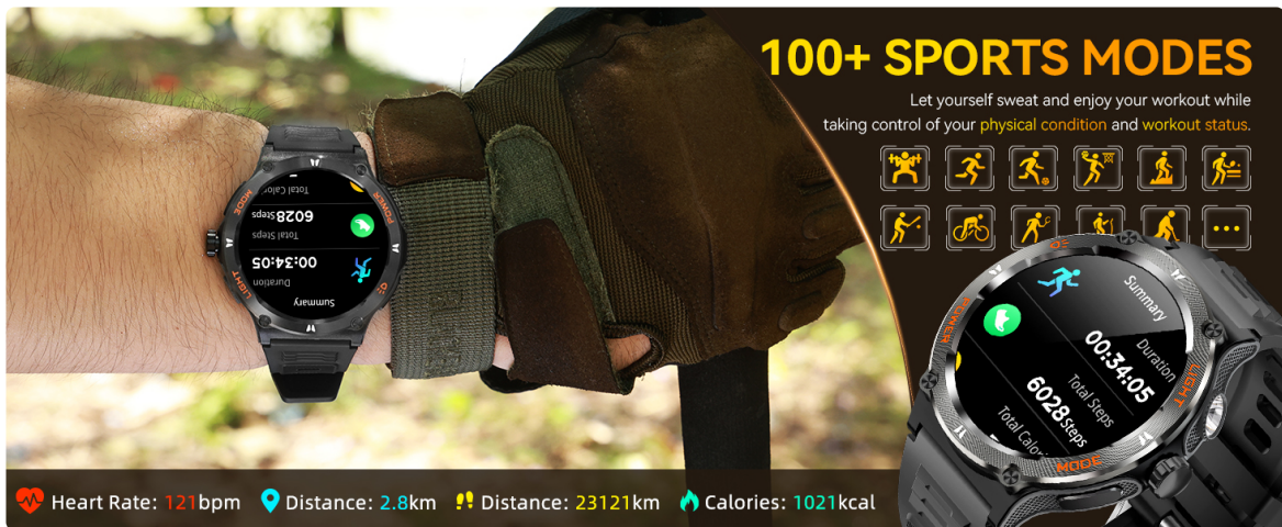
Image: The smartwatch interface showing a selection of over 100 sports modes, with a user tracking their workout data including heart rate, distance, and calories.

The KT76 offers over 100 sports modes to track your physical condition and workout status. Select your preferred sport mode to record data such as steps, duration, distance, and calories burned.