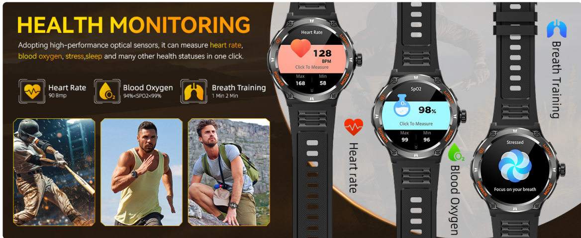
Image: The smartwatch showing health monitoring features like heart rate, blood oxygen, and breath training, with an active individual in the background.