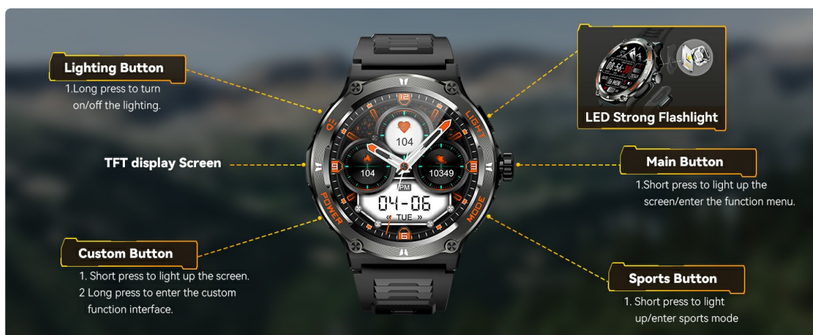
Image: A detailed view of the smartwatch highlighting the functions of its various buttons and the TFT display screen.