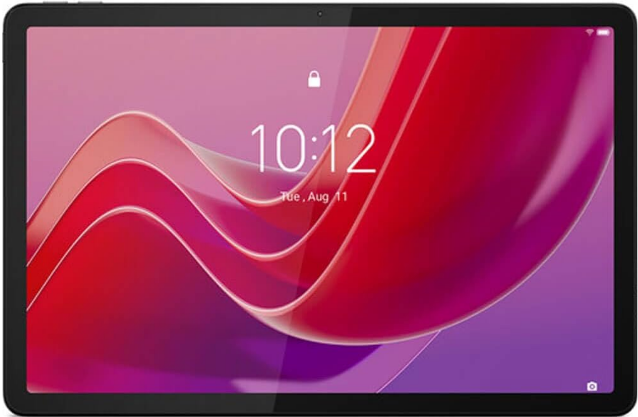
Image: The vibrant 11-inch display of the Lenovo Tab M11 tablet, showing the lock screen with time and date.