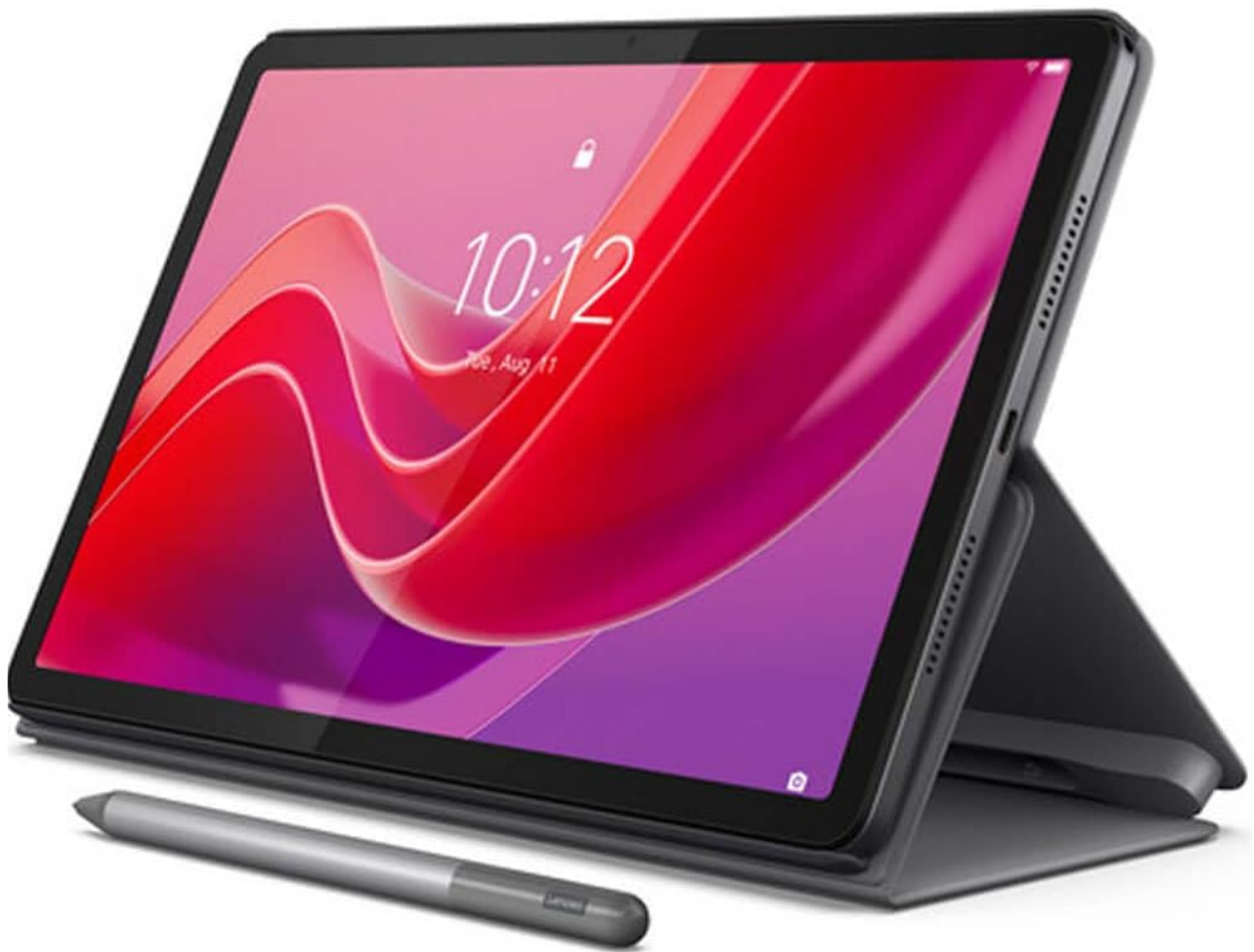
Image: The Lenovo Tab M11 tablet, shown with an optional keyboard case and stylus, ready for use.