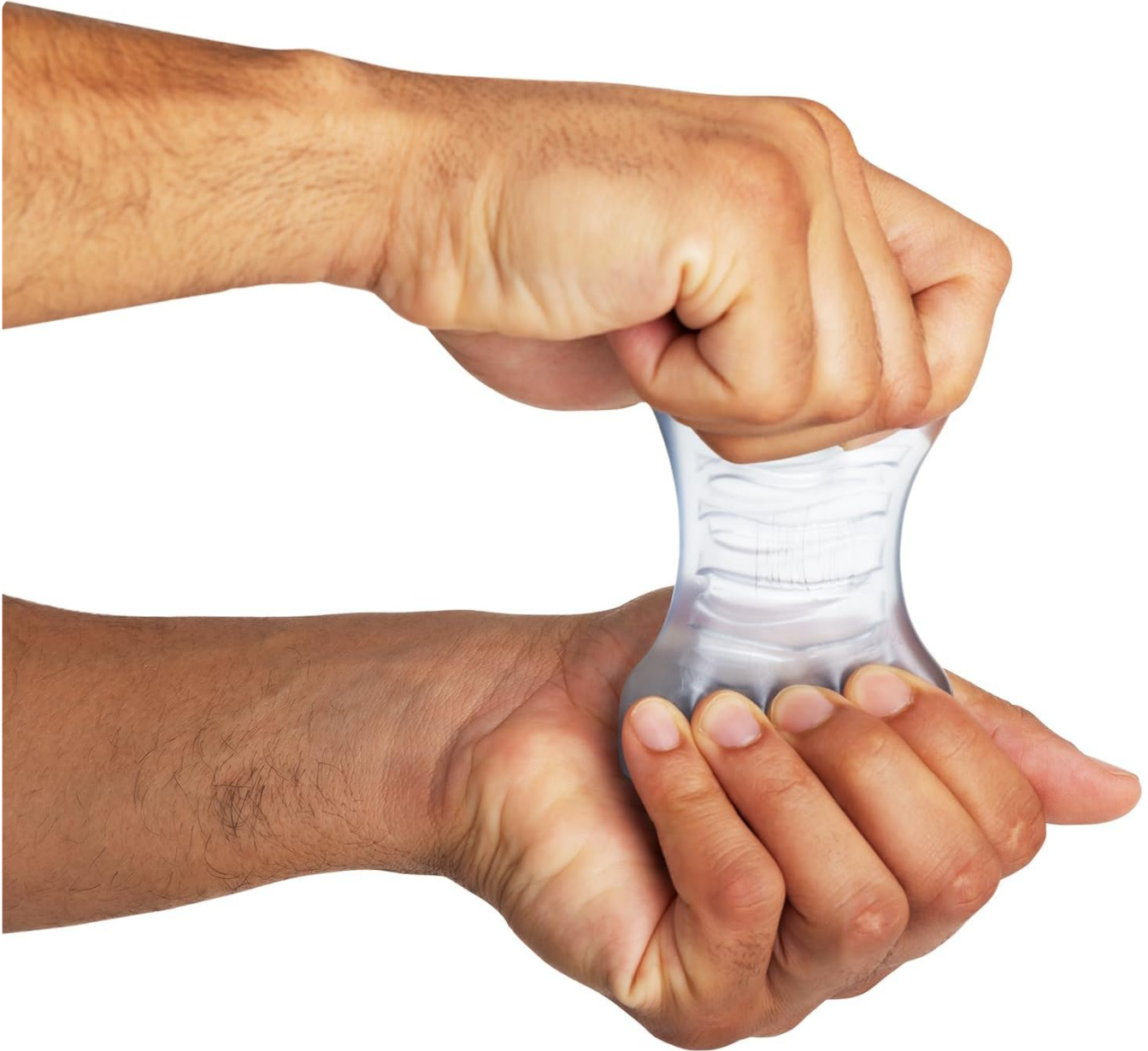
Image: A pair of hands stretching one of the plusOne oral enhancers, illustrating its flexible and stretchable silicone material, which allows for a custom fit and comfortable use.