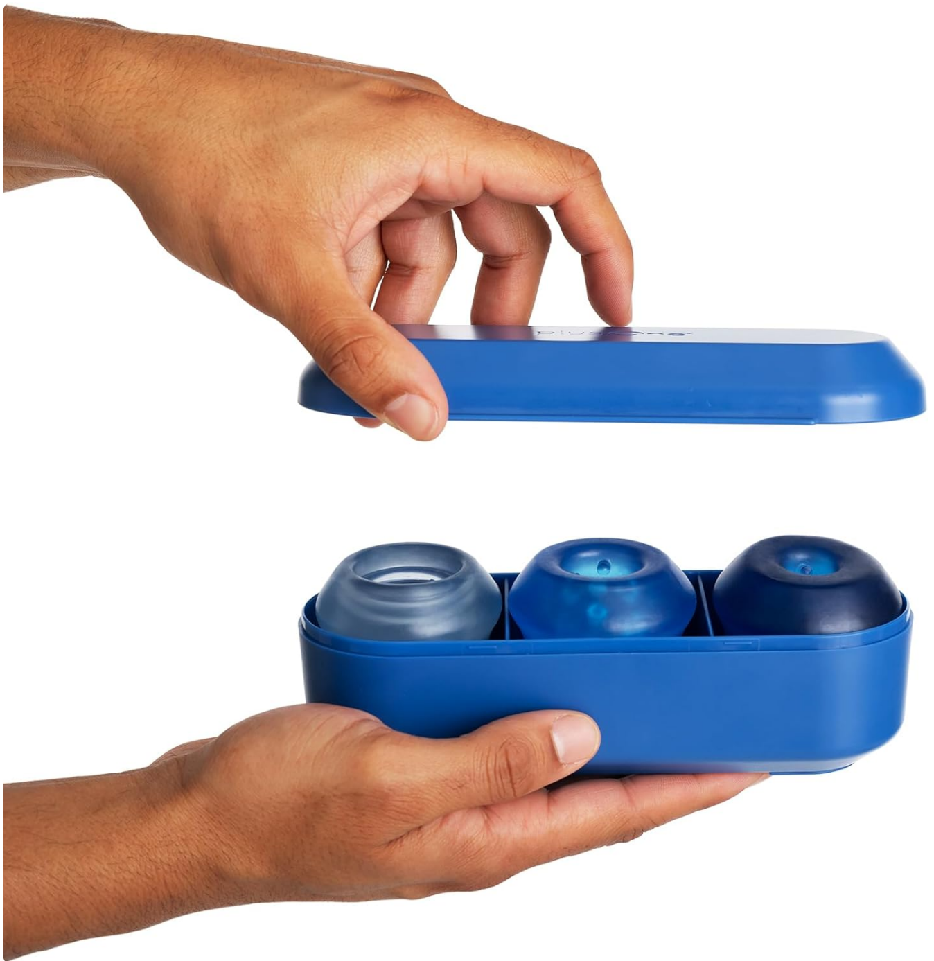
Image: A pair of hands opening the ventilated storage case, revealing the three plusOne oral enhancers neatly placed inside, ready for hygienic drying and discreet storage.