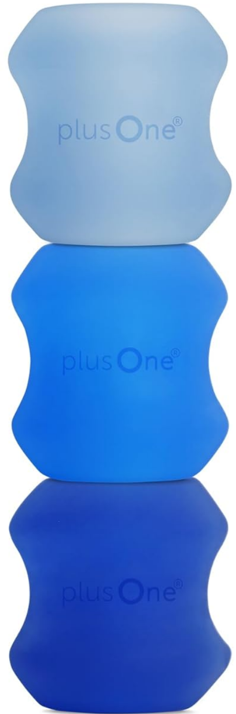
Image: The complete plusOne Oral Enhancer 3 Piece Set, showing the product packaging and the three distinct enhancers in varying shades of blue, alongside their ventilated storage case.