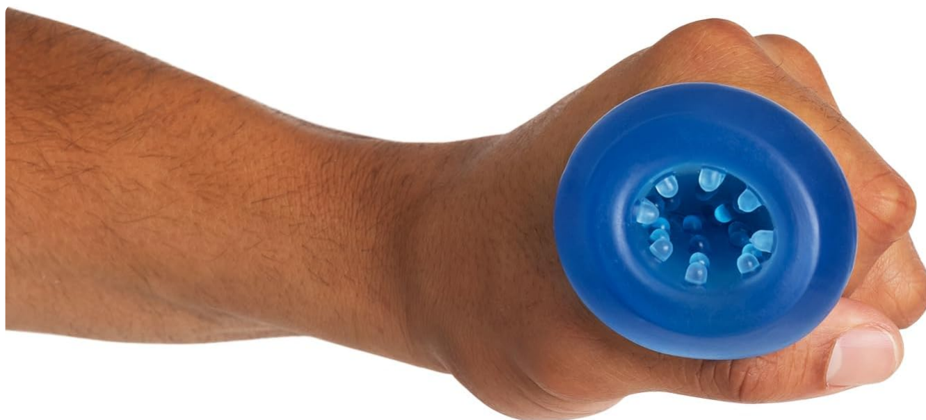
Image: A close-up view of the internal texture of one of the plusOne oral enhancers, highlighting the intricate details designed for enhanced sensation.