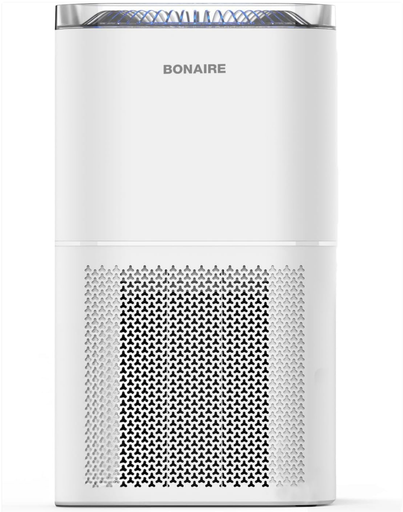
Figure 1: Front view of the Bonaire A4S Air Purifier. The device is white with a perforated lower section for air intake and a smooth upper section.