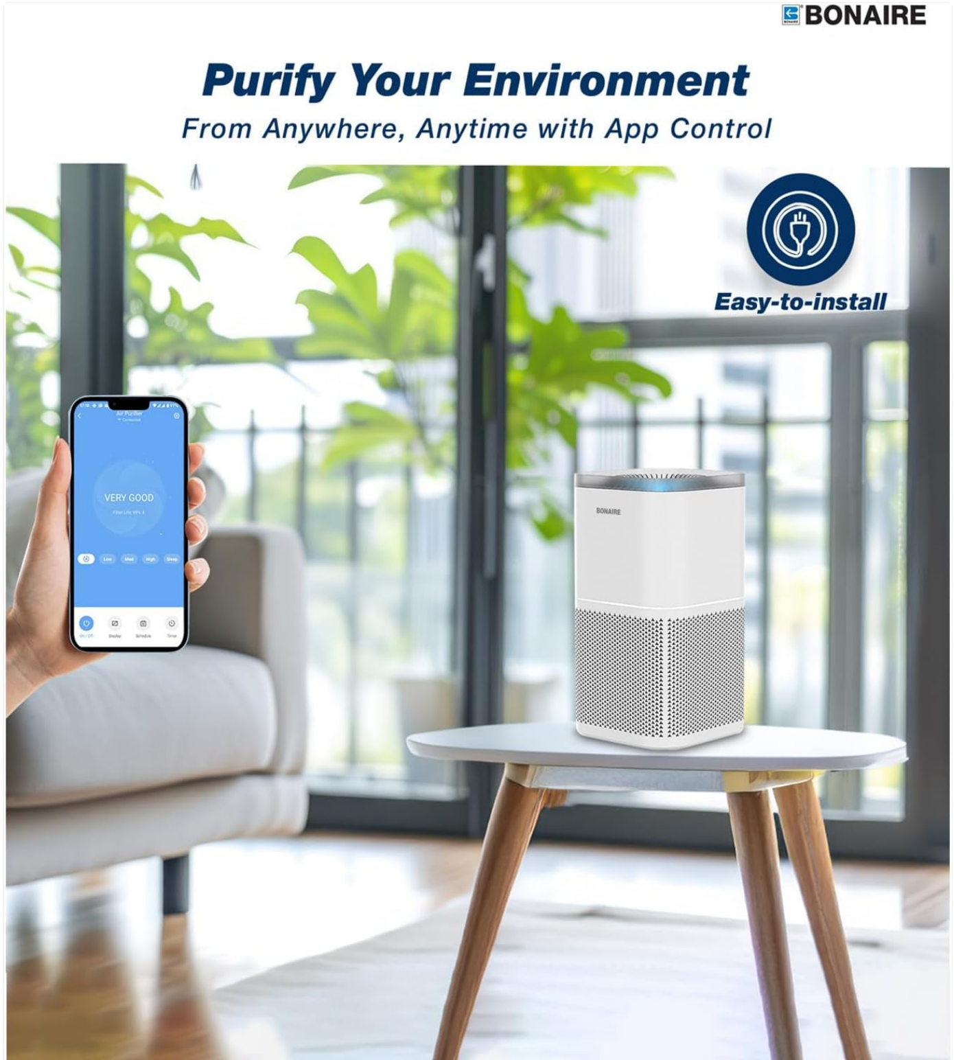
Figure 6: The Bonaire A4S Air Purifier can be conveniently controlled from anywhere using the dedicated mobile application.

Once connected, you can control all functions, monitor air quality, and set schedules from your smartphone.