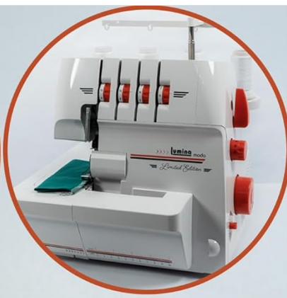
Factory Threaded Sergers