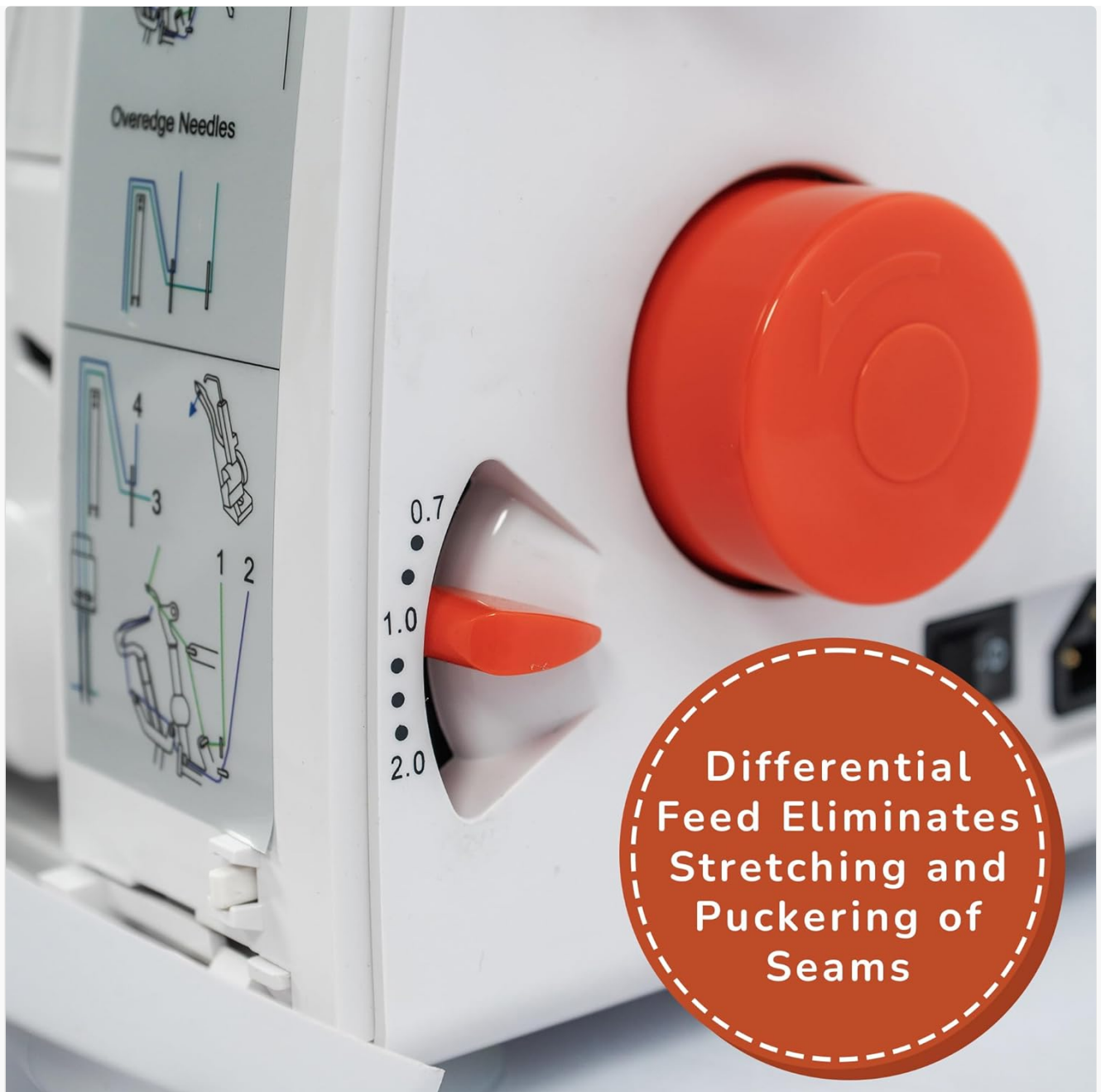
Image 4.2: The differential feed control dial, used to prevent stretching or puckering.