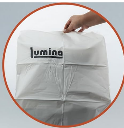
Non-Woven Dust Cover