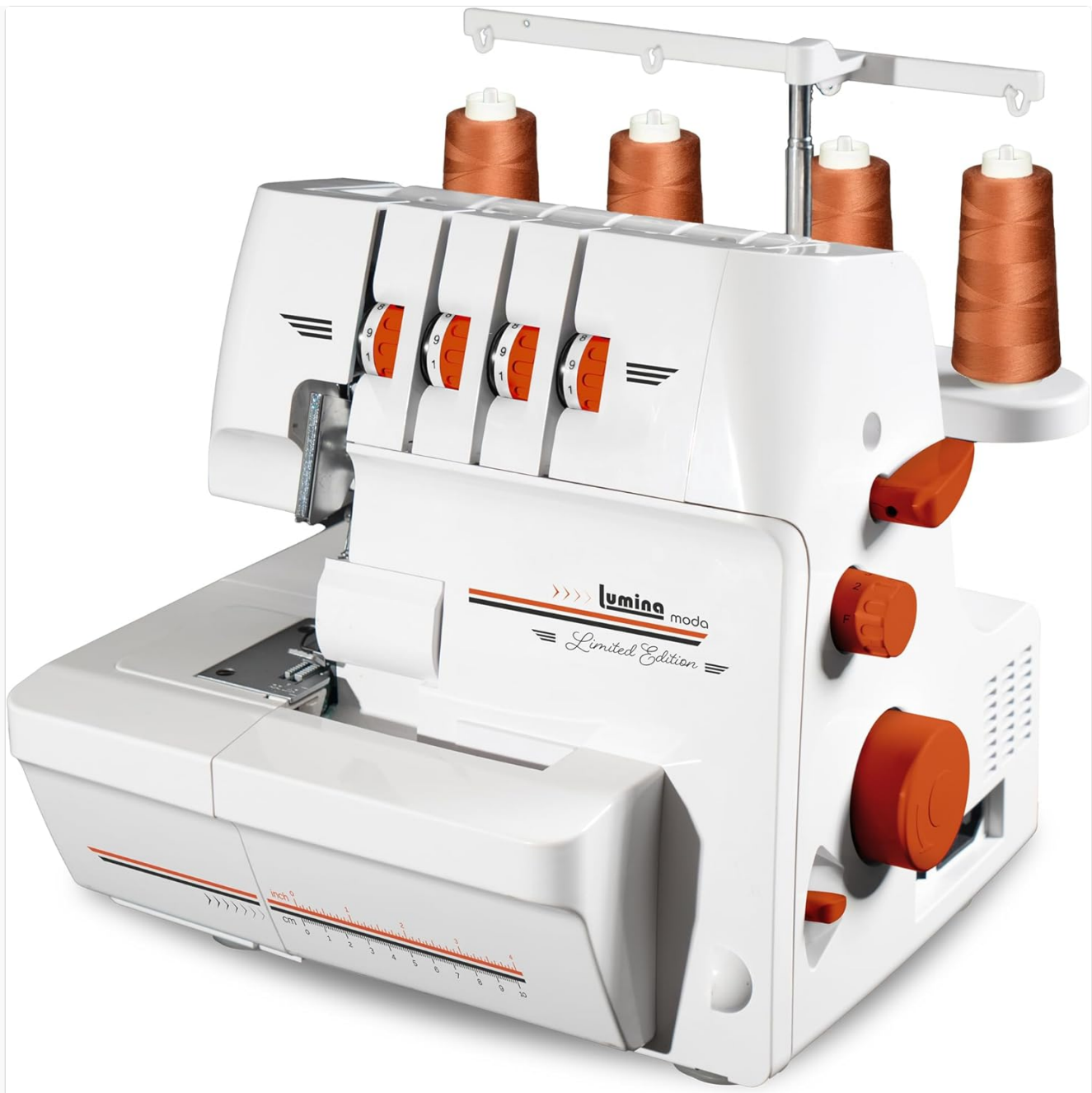
Image 1.1: The Lumina Moda Serger Overlock Machine, showcasing its design and thread setup.