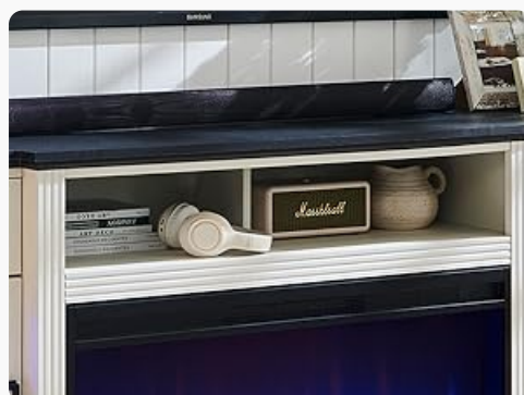
Image: A side cabinet with its glass door open, showing items illuminated by adjustable LED lights.

The side glass cabinets feature integrated LED lighting. These lights can be adjusted to various colors to complement the fireplace flames or your room's decor. Use the remote control to cycle through the available color options.