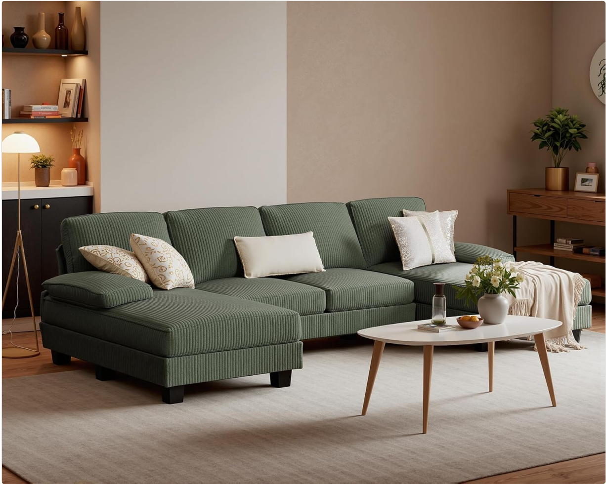
Image: The Furniwell sectional sofa in a U-shaped configuration, showcasing its modern design and deep green corduroy fabric.