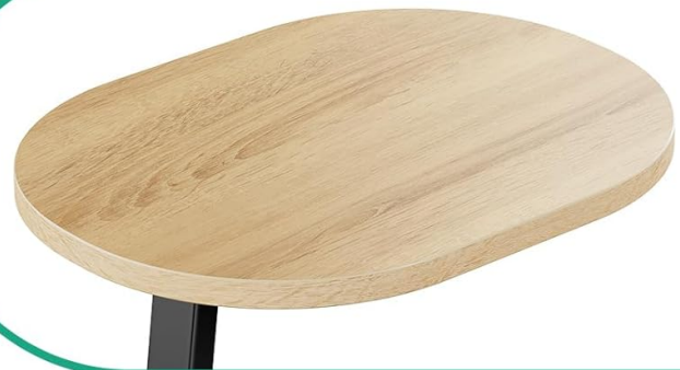
Image: Key features of the Kalrin 3-Tier Oval Side Table, including its three shelves, oval tabletop, reinforced metal frame, and adjustable feet.