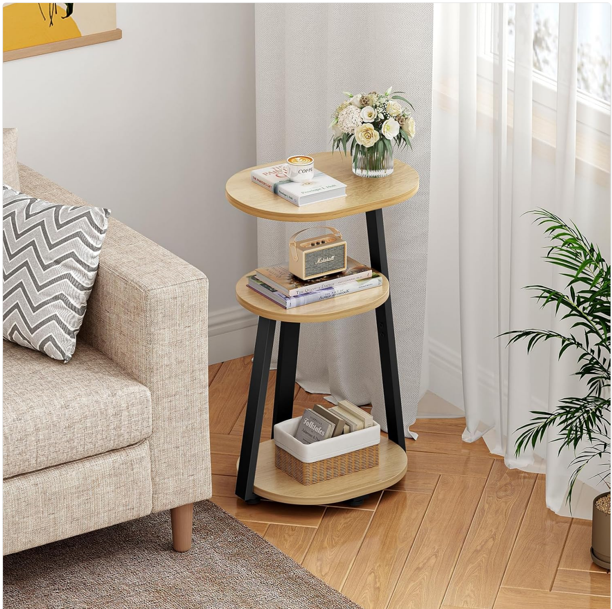
Image: The Kalrin side table positioned next to a sofa, showcasing its use for holding a plant, books, and a decorative item.