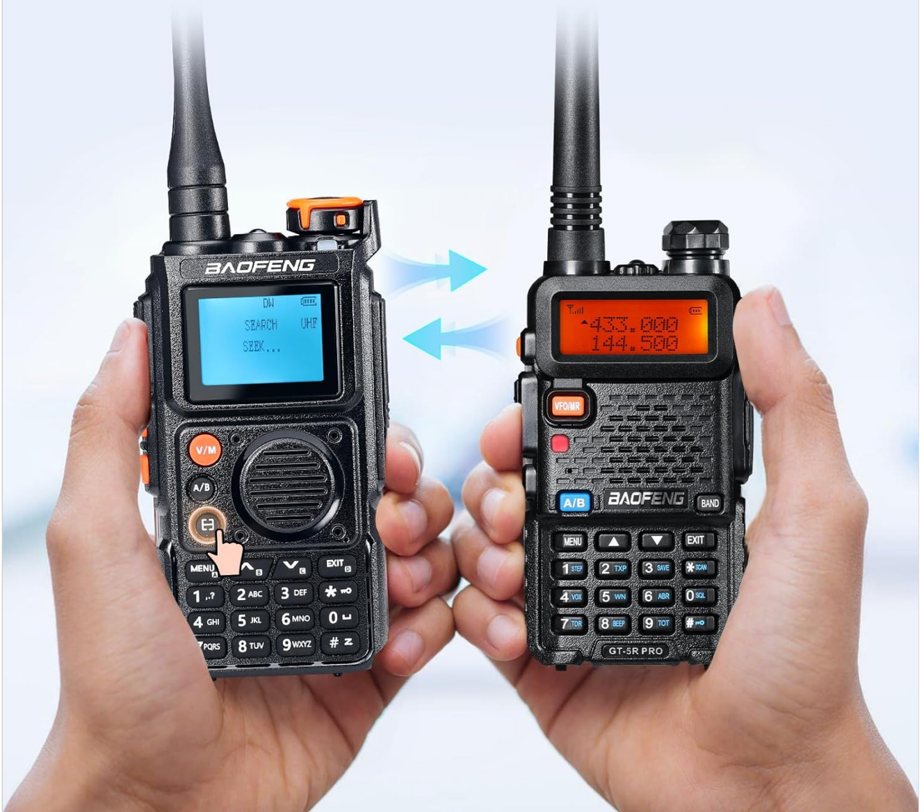
Image: Two walkie-talkies, including the BAOFENG K6, illustrating the one-key frequency copy function, where one radio's frequency is wirelessly transferred to another.

To use this function, ensure both radios are in close proximity and follow the specific instructions in the menu for wireless frequency copy. This feature simplifies setting up communication with other compatible devices.