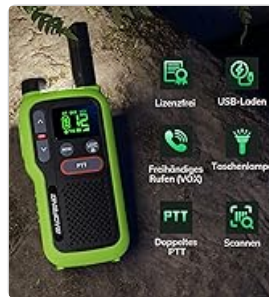
Image: The BAOFENG K6 display showing an FM radio frequency (e.g., 97.000) and indicating an anti-interruption feature, allowing the radio to switch back to communication mode if a signal is detected.

You can listen to FM broadcasts, and the anti-interruption feature will automatically switch back to communication mode if a signal is detected on your primary frequency.