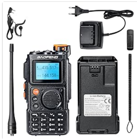
Image: The BAOFENG K6 display showing the original frequency and then the reversed frequency, demonstrating the one-key repeater frequency reverse function.

Access this function via the menu or a programmable side key to quickly reverse the transmit and receive frequencies for repeater operation.