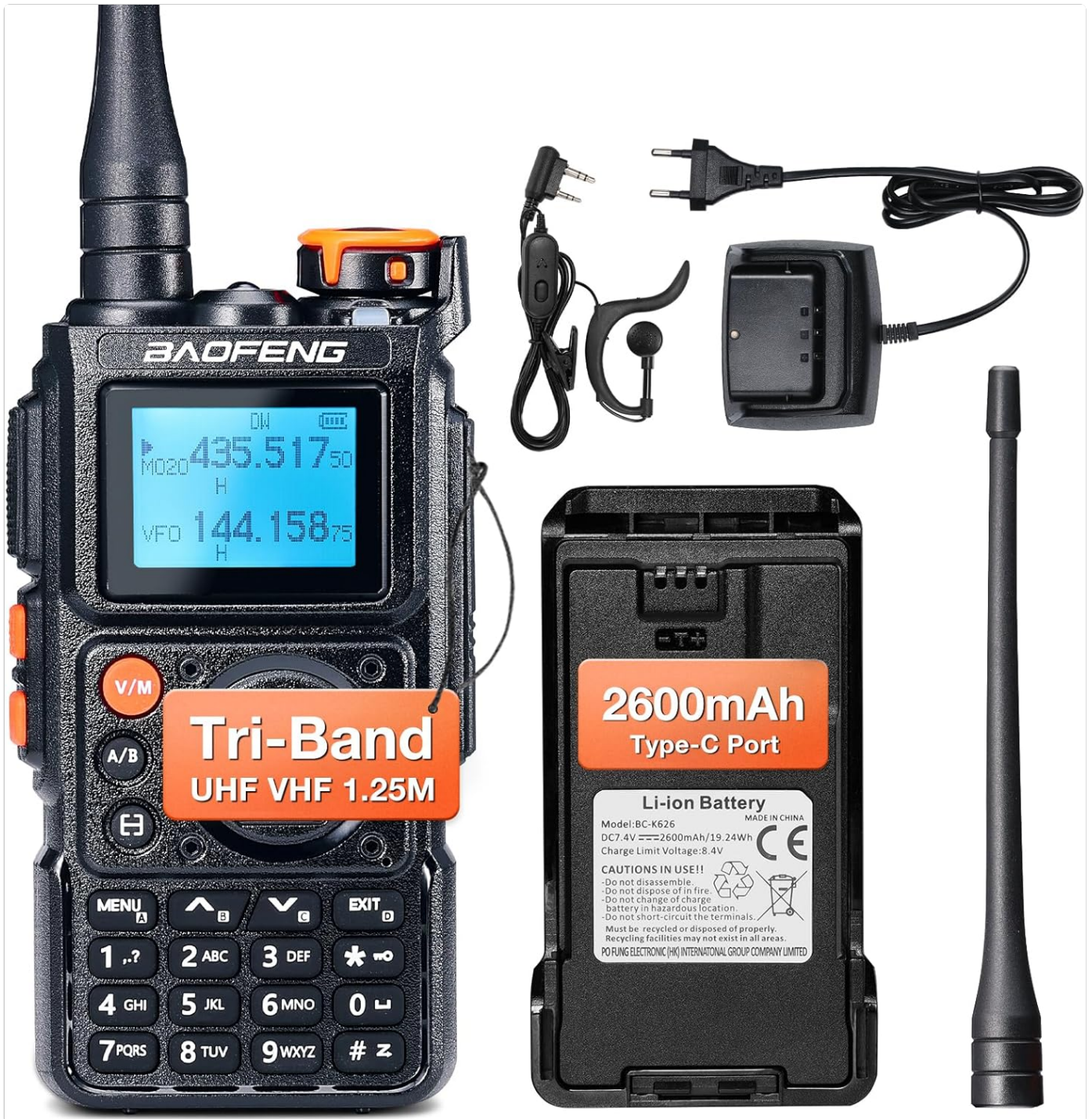
Image: The BAOFENG K6 walkie talkie along with its standard accessories, including the antenna, battery, desktop charger, power adapter, and earpiece.