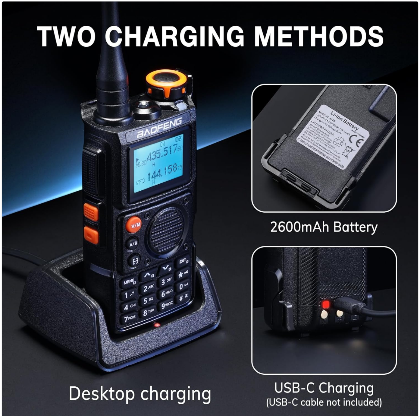
Image: Illustration showing the two charging methods for the BAOFENG K6: using the included desktop charging cradle and direct charging via the USB-C port on the radio.