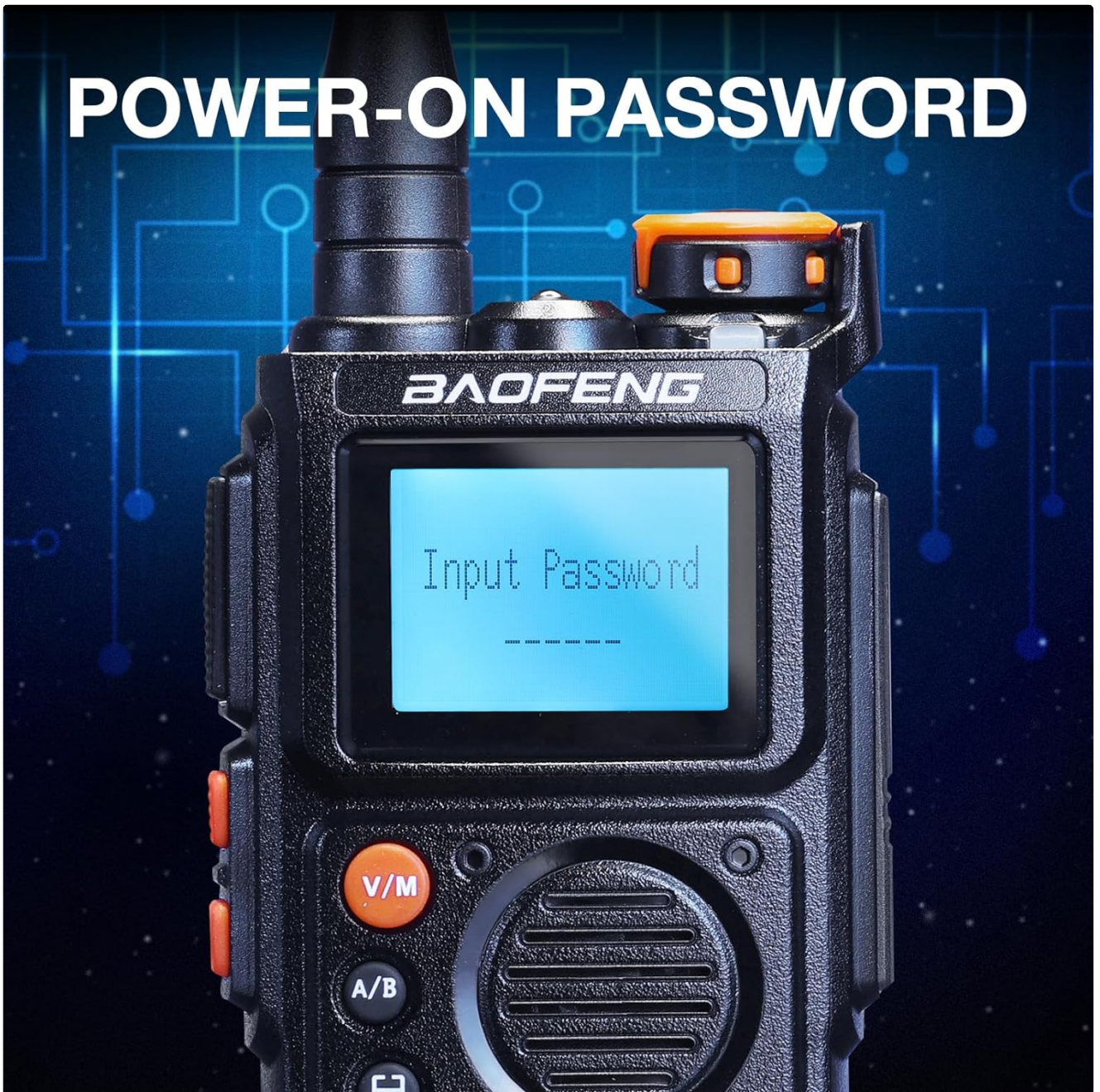
Image: The BAOFENG K6 display showing an "Input Password" prompt, indicating the power-on password security feature.

This feature prevents unauthorized use of your radio.