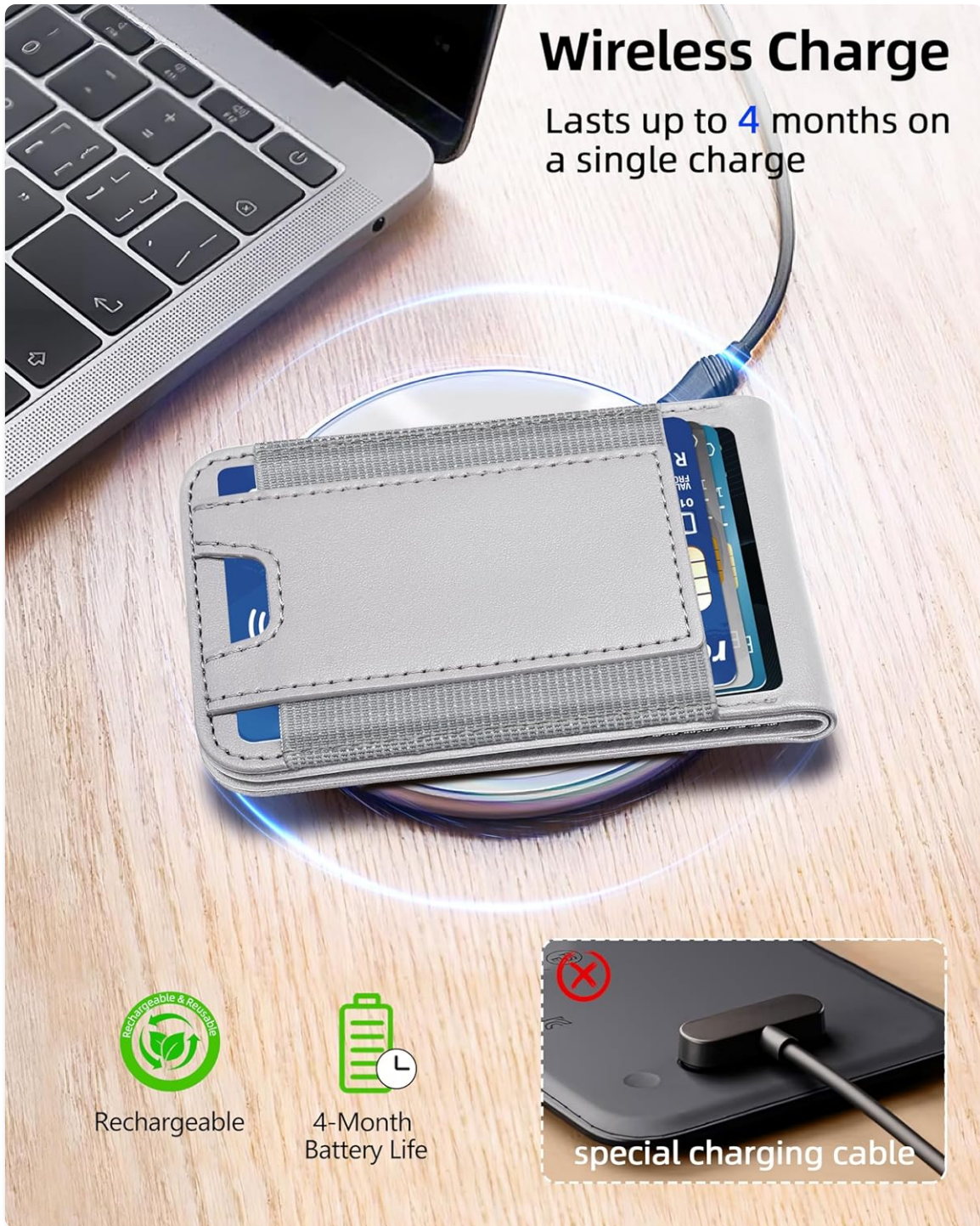
Image: The wallet charging wirelessly, with indicators for its rechargeable nature and 4-month battery life.