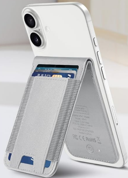
Image: A visual guide to the wallet's compatibility with various iPhone models and case types.