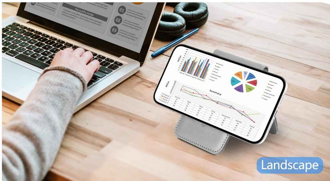
Image: The wallet functioning as a hands-free stand for an iPhone, shown in both vertical and horizontal positions.