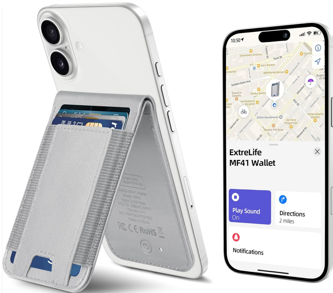
Image: The ExtreLife Magsafe Wallet in grey, attached to an iPhone, demonstrating its stand function and the Apple Find My app interface on a separate phone.