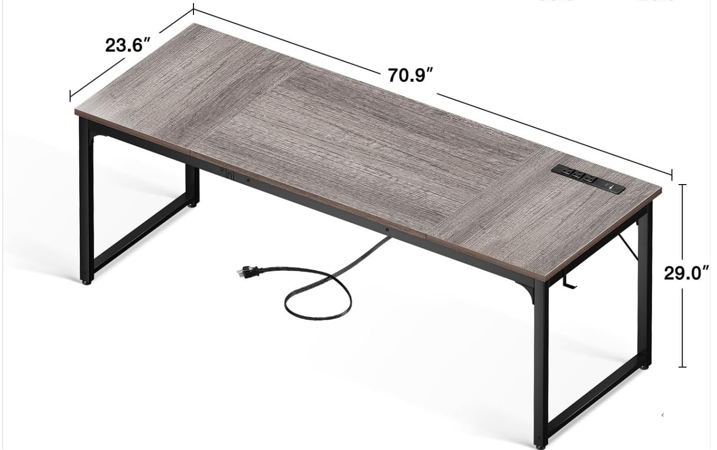
Figure 1: Desk Dimensions. The desk measures 70.9 inches in length, 23.6 inches in width, and 29.0 inches in height.