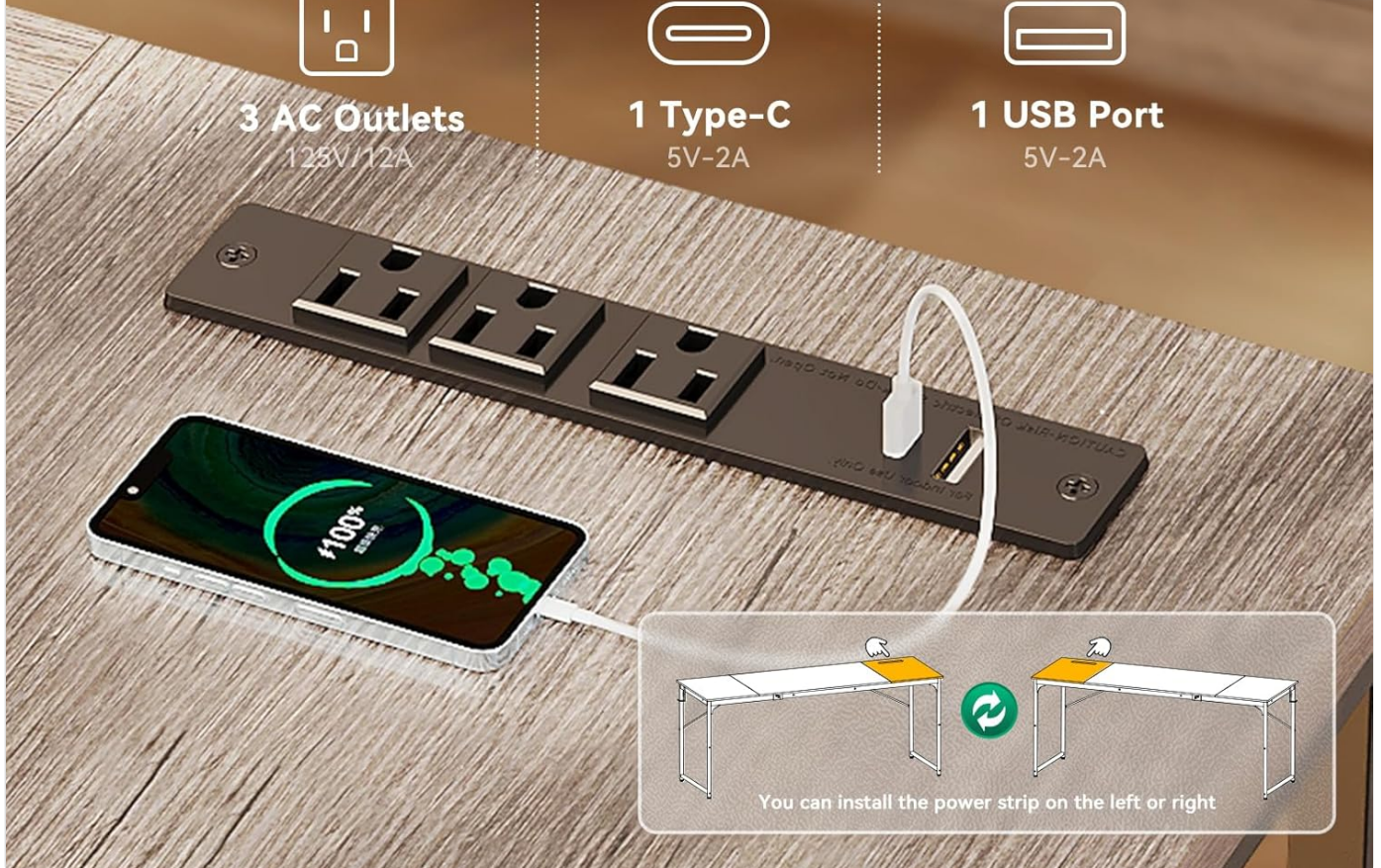
Figure 2: Recessed Power Strip. This image highlights the integrated power strip with 3 AC outlets, 1 Type-C port, and 1 USB port, demonstrating how devices can be charged directly from the desk. The power strip can be installed on either the left or right side.