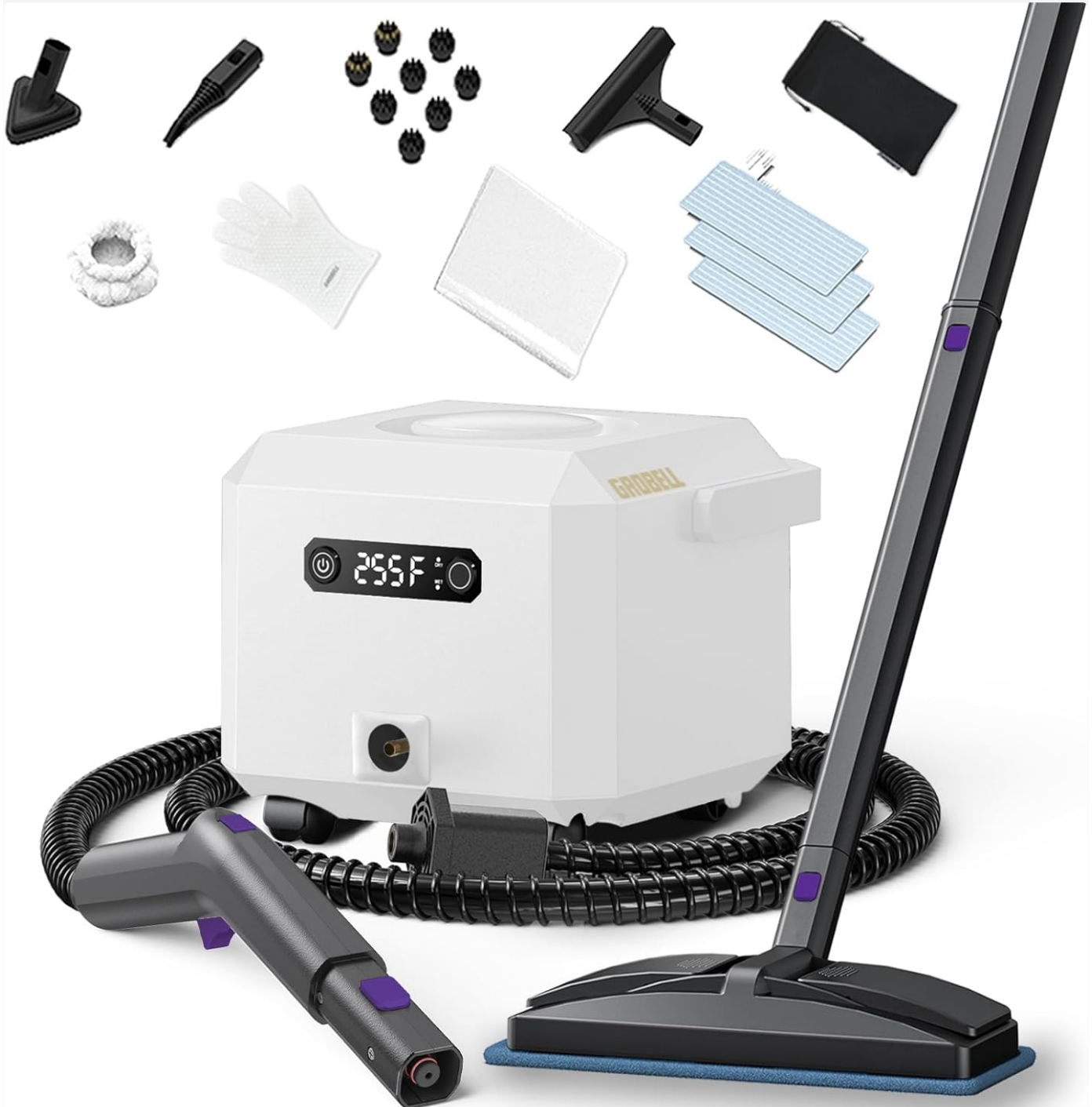
Image: Main unit and accessories.

Familiarize yourself with the main components of your GROBELL Steam Cleaner.