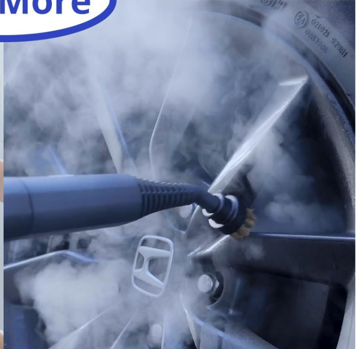
Image: Versatile cleaning applications.