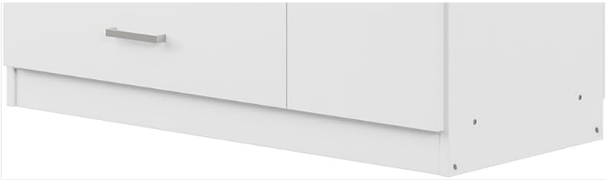
Figure 6.2: Detail of the locking drawer.