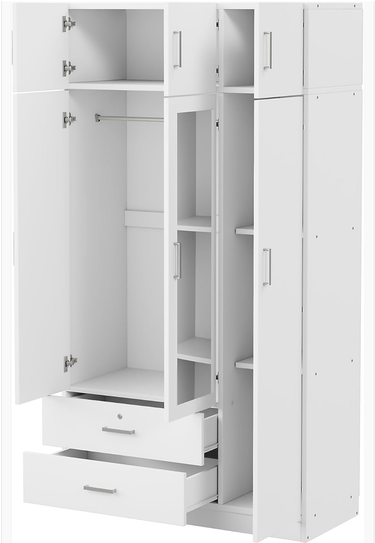
Figure 6.1: Wardrobe interior with doors open.