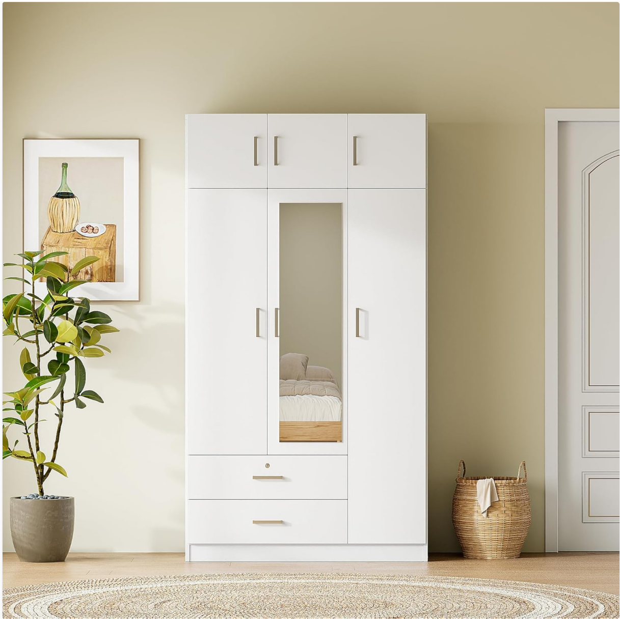
Figure 3.1: Front view of the cloblane 3 Doors Wardrobe with Mirror.