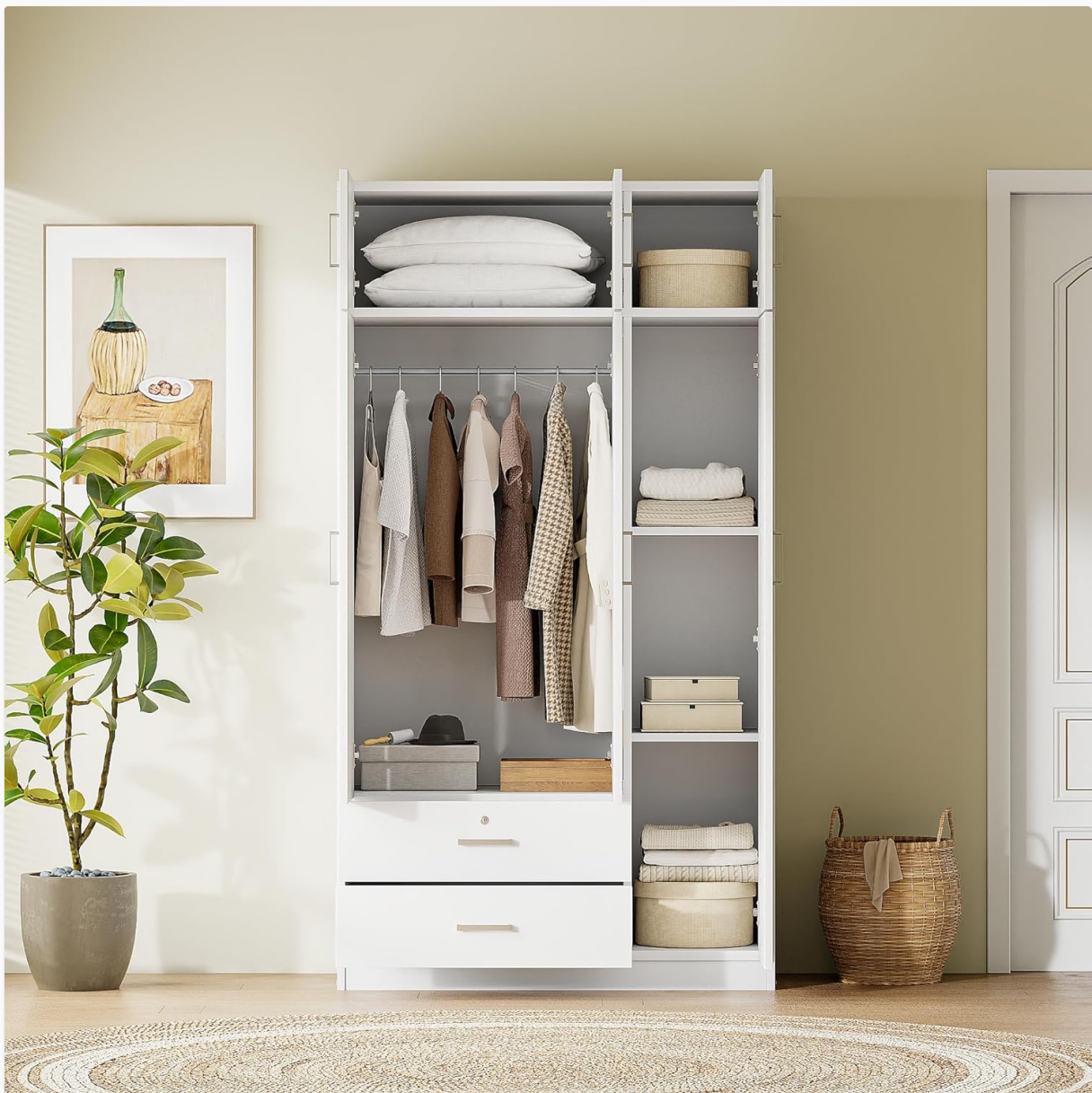
Figure 6.3: Organized interior showing various storage options.

Utilize the integrated hanging rods for clothes that require hanging. The adjustable shelves can be repositioned to accommodate items of various sizes. Ensure items are evenly distributed and do not exceed the stated weight limit of 45 pounds per section.