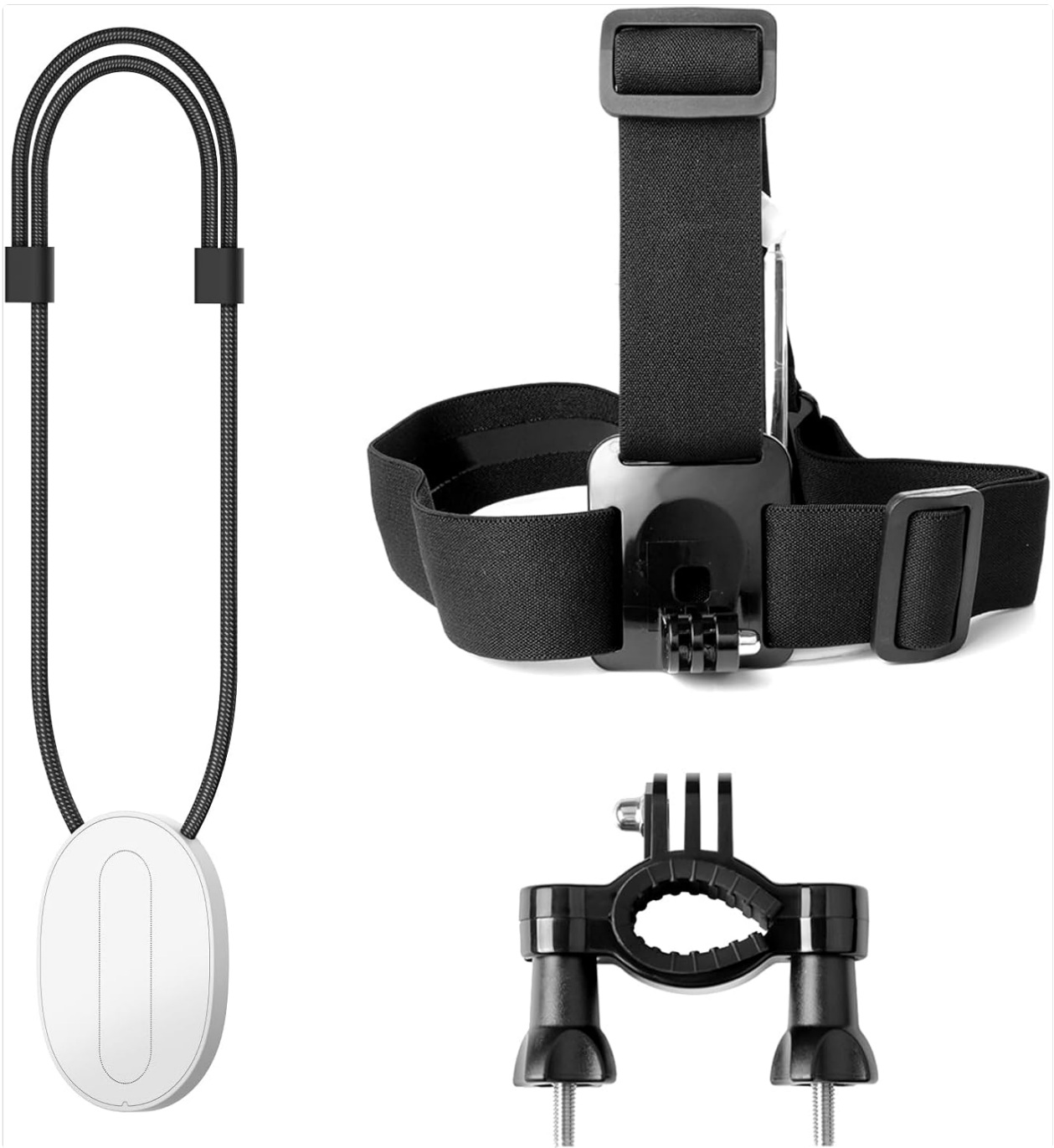
Figure 2.1: Overview of the SJCAM C110+ Action Camera Accessories Kit components.