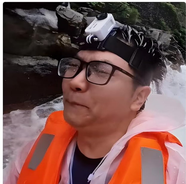
Figure 3.1: The SJCAM C110+ accessories in action, demonstrating use with the magnetic lanyard, bike mount, and head strap.