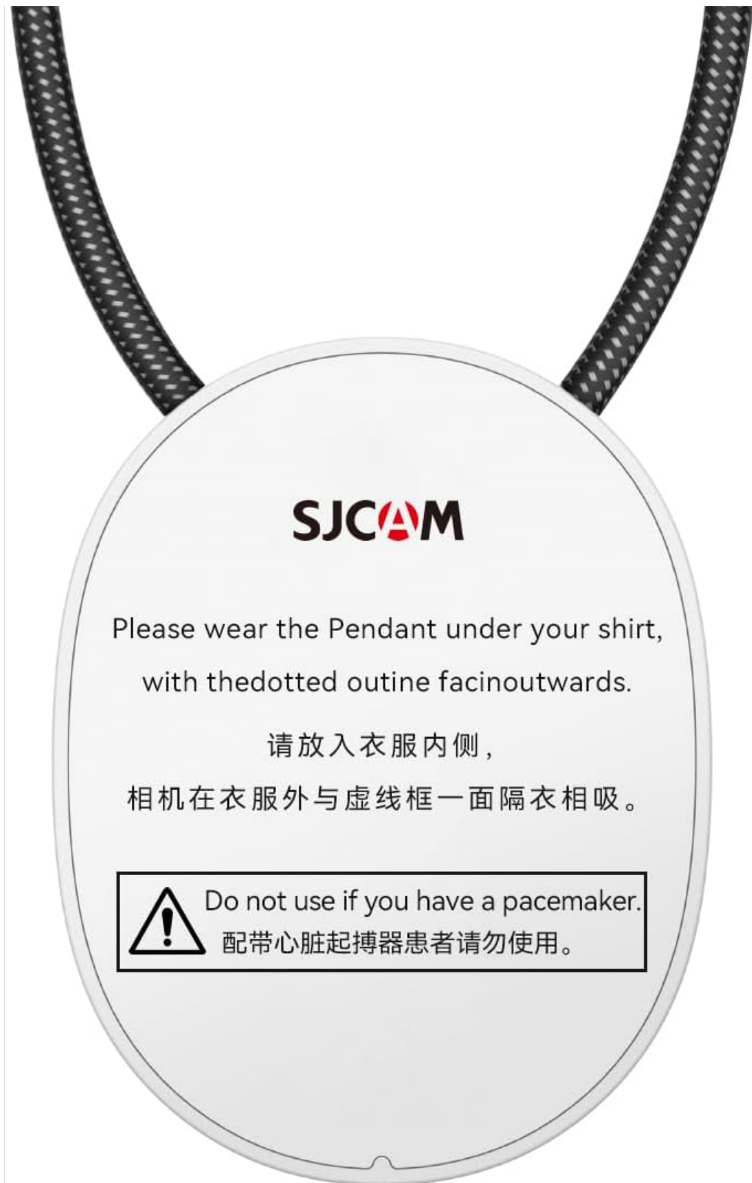
Figure 2.2: Proper wearing of the magnetic lanyard. Ensure the dotted outline faces outwards.

Important Safety Note: Do not use the magnetic lanyard if you have a pacemaker.