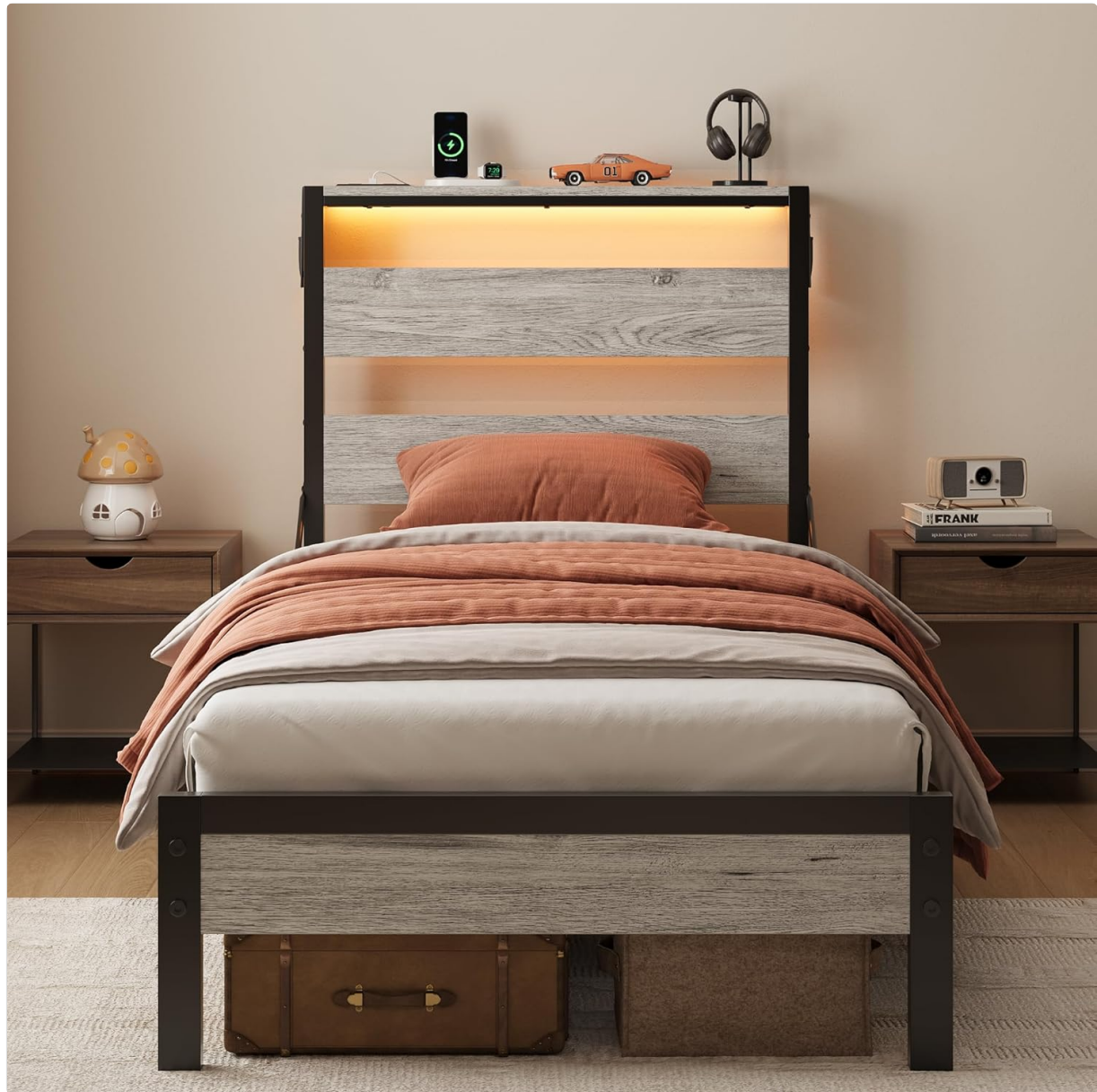
Figure 7: Overview of the Bestier Twin Bed Frame, showcasing its grey finish, storage headboard, and integrated LED lighting.