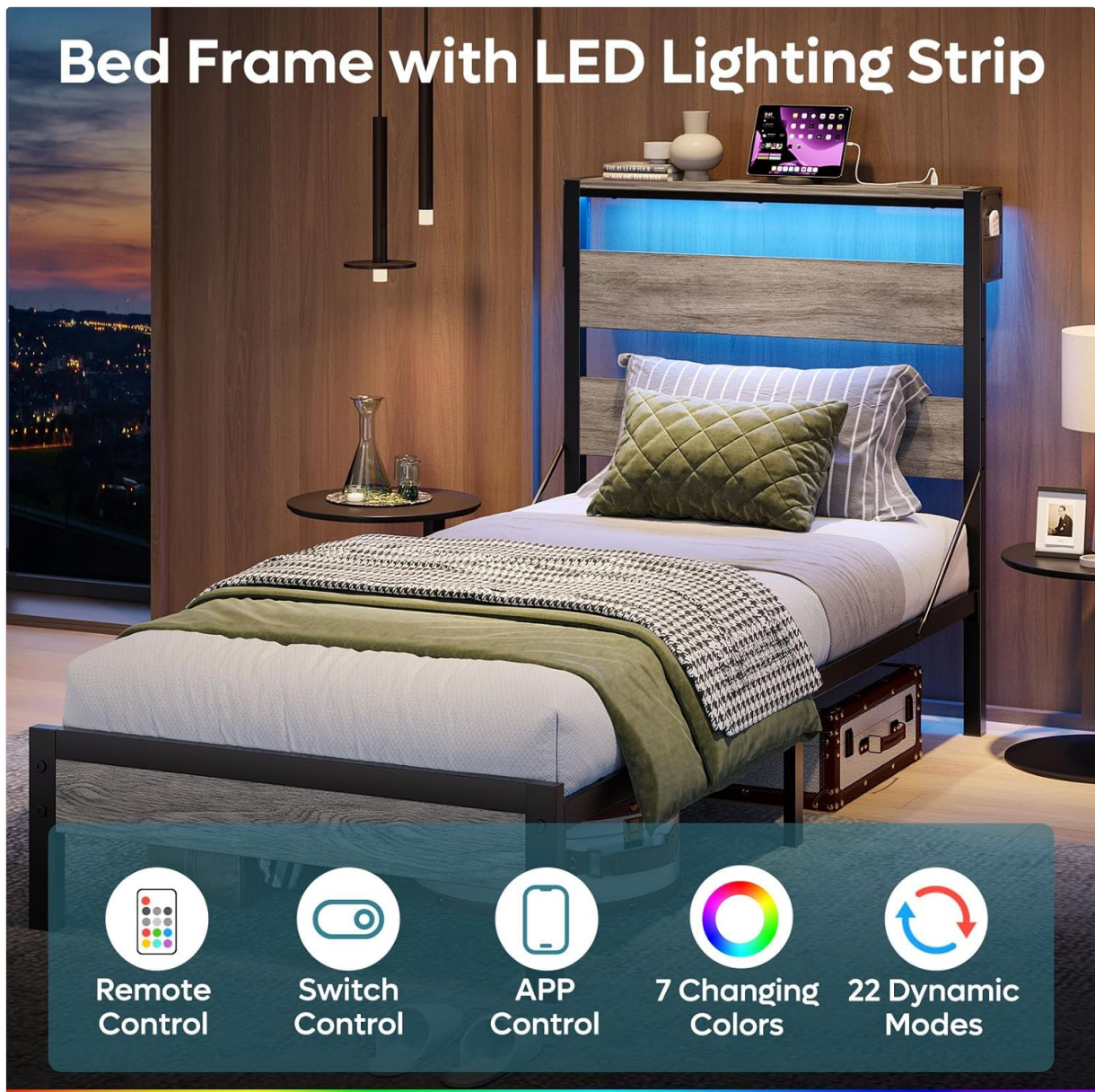
Figure 3: The LED lighting system can be controlled via remote, app, or a physical switch, offering 7 colors and 22 dynamic modes.