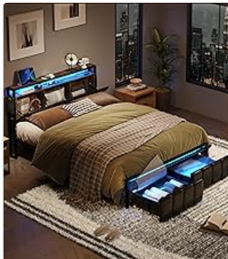
Figure 9: The bed frame is constructed from CARB P2 grade particle board, ensuring heat-resistant, waterproof, and anti-scratch properties, making it suitable for homes with children and pets.