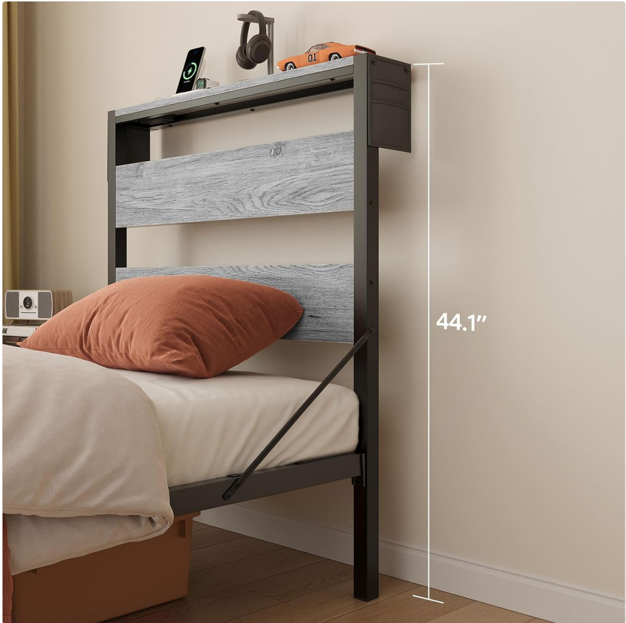
Figure 8: The headboard stands 44.1 inches high, providing comfortable back support.