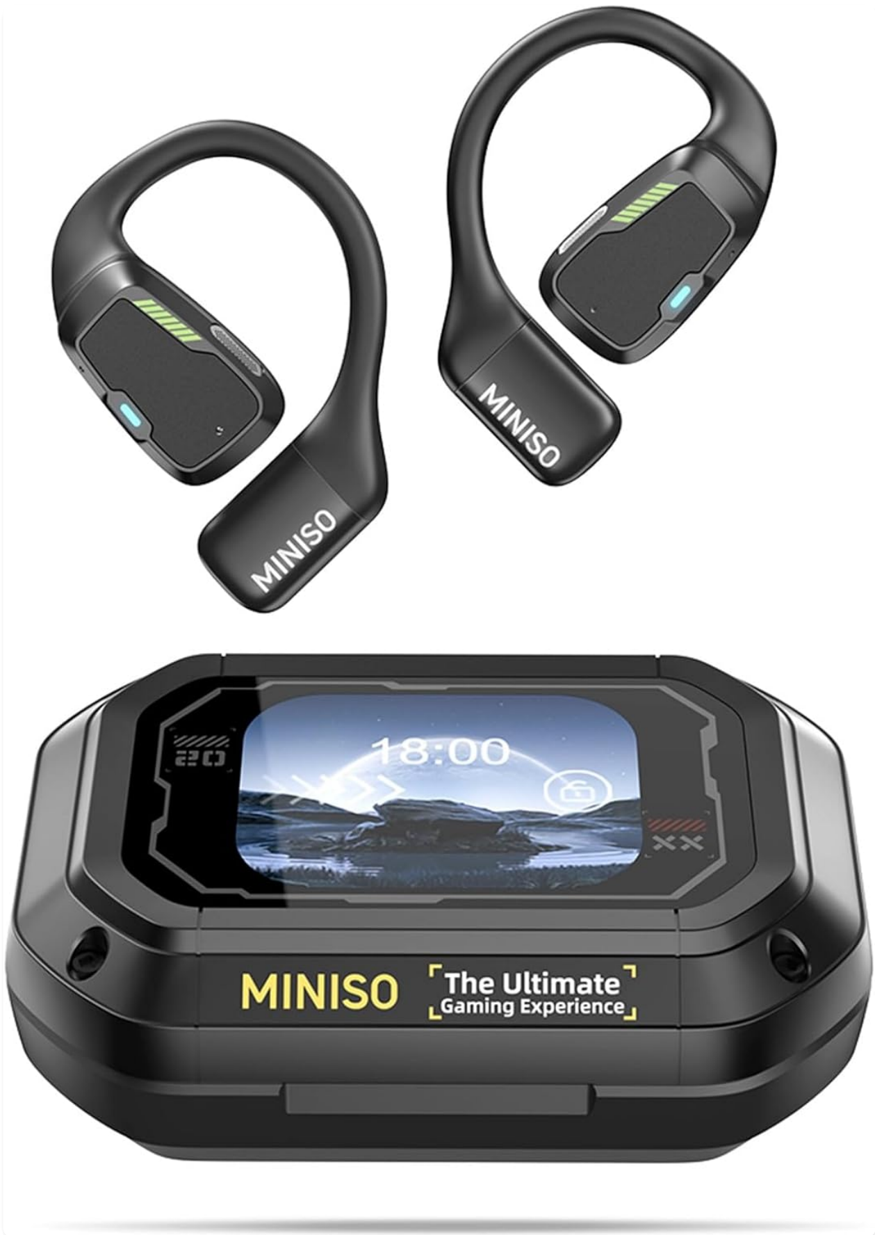
Image: The MINISO M98 Open Ear Translation Earbuds and their charging case, showcasing the sleek design and LED display.