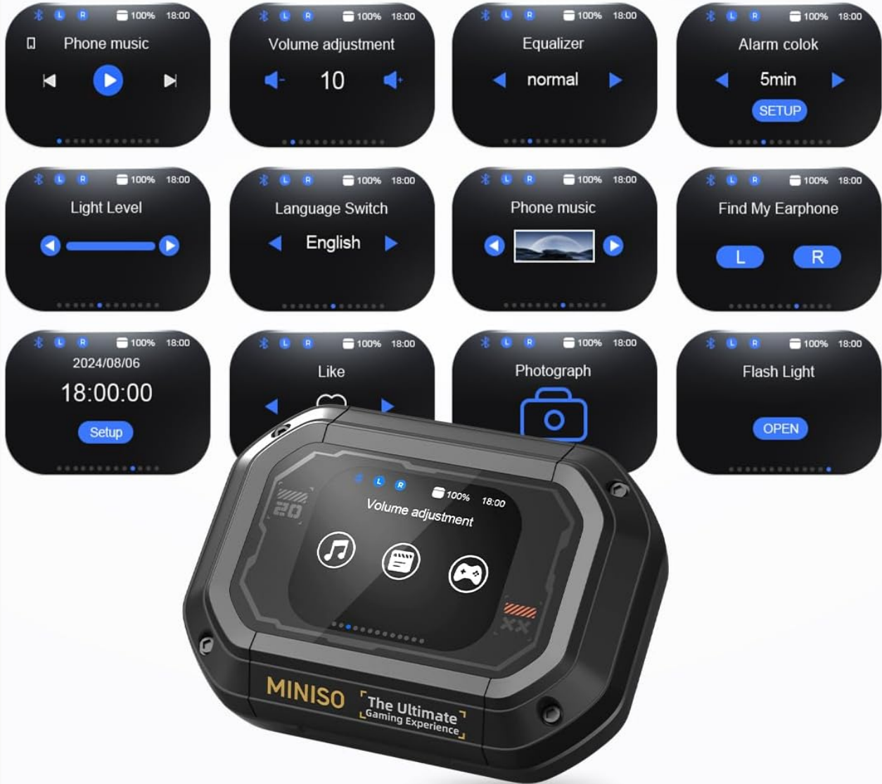
Image: A detailed view of the LCD full-color touch screen on the charging case, illustrating various functions such as music control, volume adjustment, equalizer settings, alarm, light level, language switch, earbud locator, date/time, 'like' function, camera trigger, and flashlight.

Muchos tipos de funciones de pantalla táctil