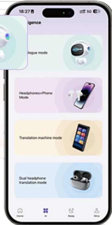
Image: Depiction of the AI Dialogue mode, where users can converse with AI in real-time, seeking inspiration, answers, and linguistic consultation.