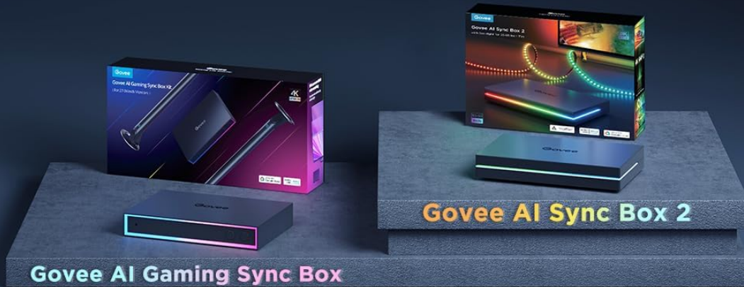
Govee AI Gaming Sync Box