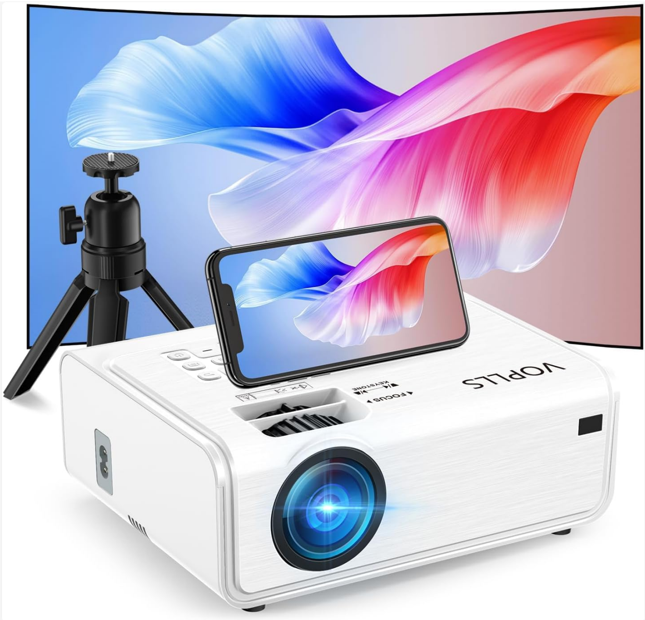
The VOPLLS projector, shown with its included tripod and a smartphone, ready for use.