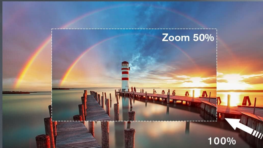
Visual guide to the 4-Point and Digital Keystone Correction, including the 50% zoom feature.