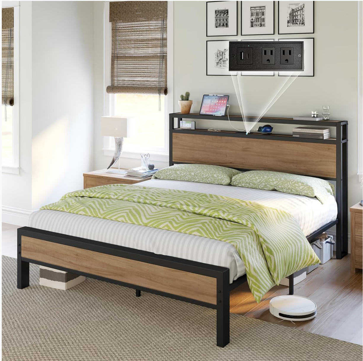
Image: The complete LUXOAK Full Size Platform Bed Frame with its 2-tier storage headboard and integrated charging station, shown in a bedroom setting.