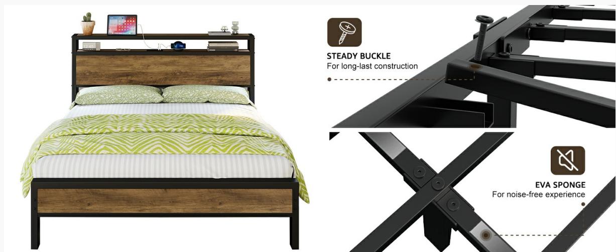
Image: Detail showing the steady buckle for long-lasting construction and EVA sponge for a noise-free experience, integrated into the bed frame design.