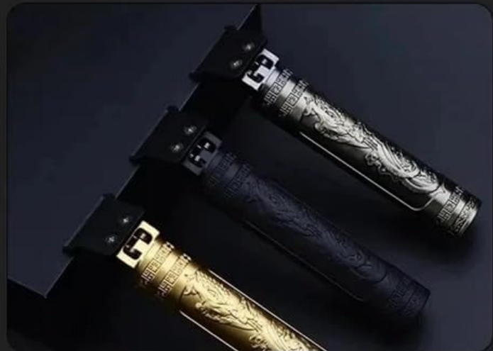
Image: Multiple views of the hair clipper, showing both the front and back designs of the product.