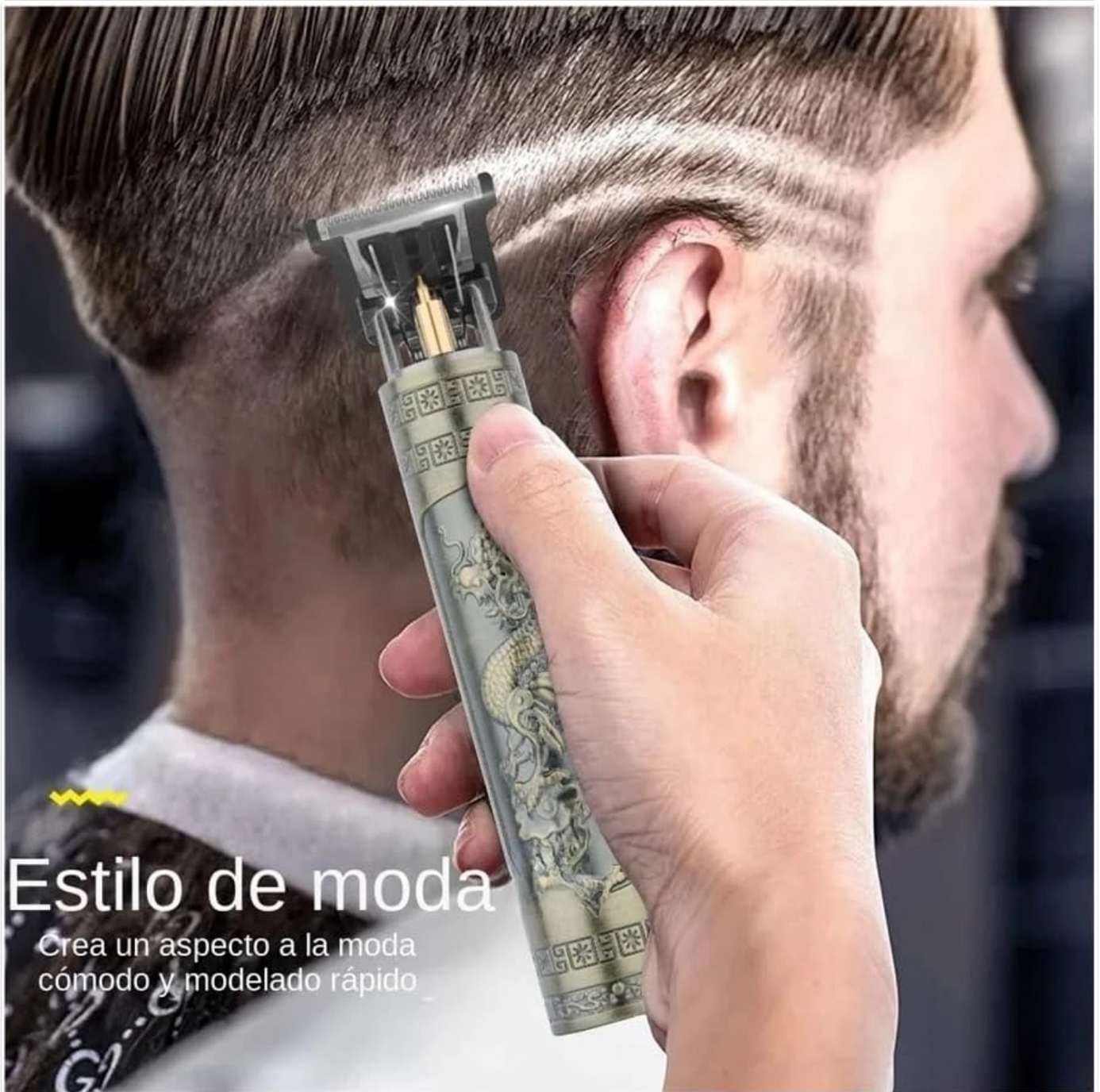
Image: A person using the EWKYLSEM hair clipper to create a stylish haircut, demonstrating its precision for detailing and shaping.