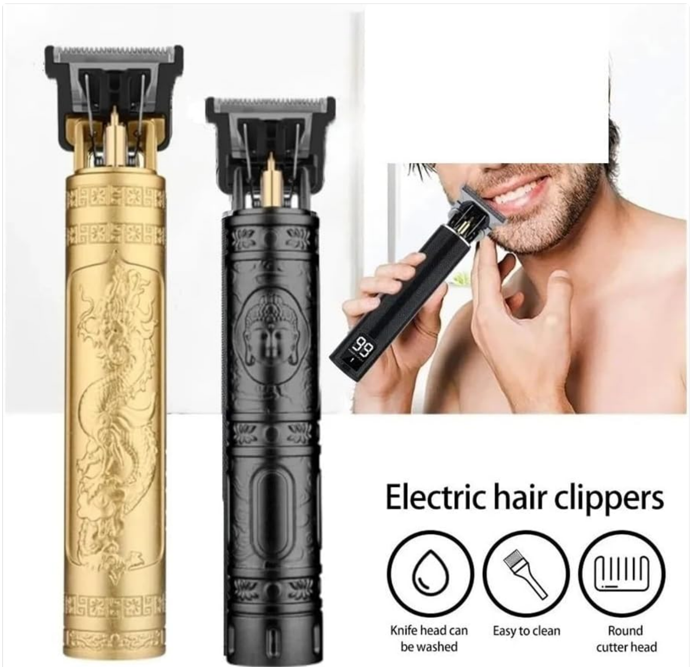
Image: A display of two hair clippers (gold and black designs) alongside an image of a person using the clipper to trim hair, highlighting its use for precise styling.