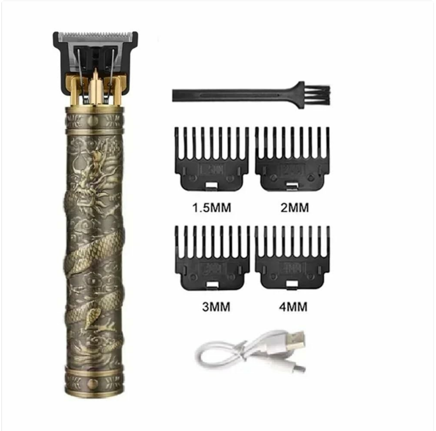
Image: The EWKYLSEM Cordless Hair Clipper Trimmer in the Dragonb design, showcasing its compact and ergonomic build.

The EWKYLSEM Cordless Hair Clipper Trimmer is designed for precise hair cutting and styling. It features a powerful rotary motor and stainless steel blades for efficient performance.