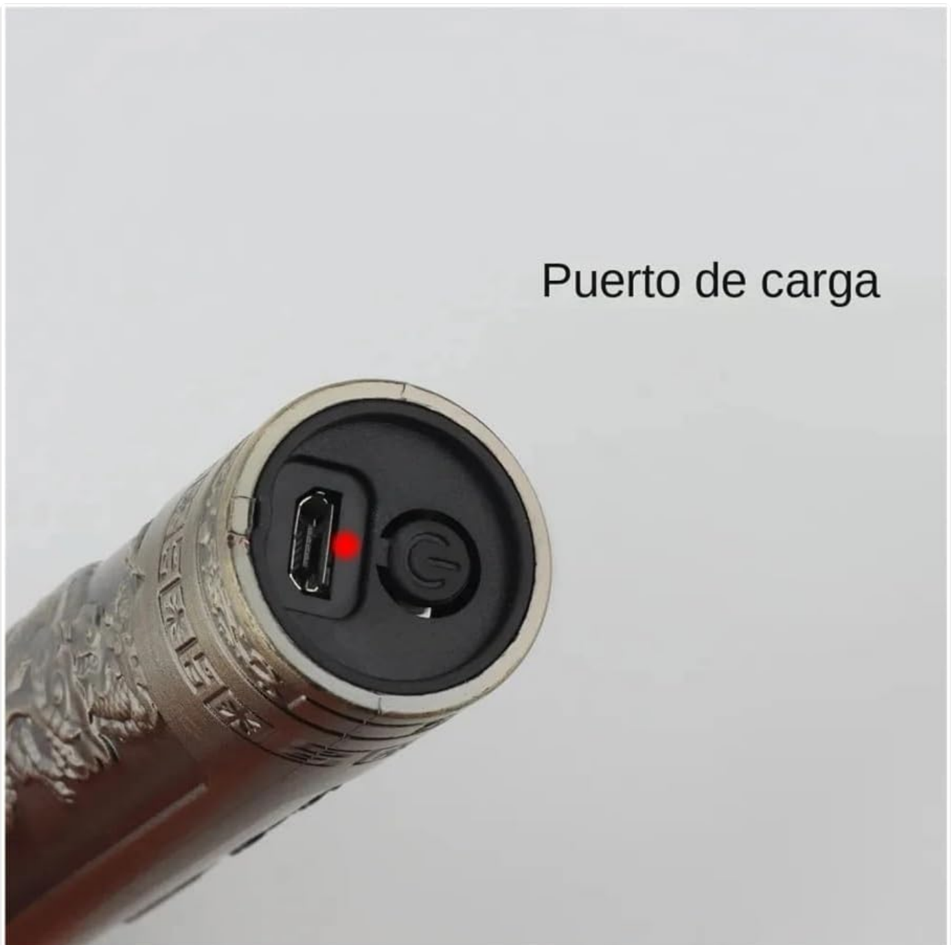
Image: A detailed view of the USB charging port on the hair clipper, showing where the charging cable connects.