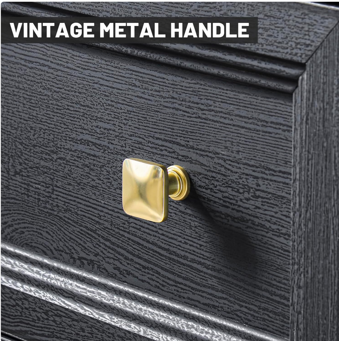
Image: A close-up of the vintage metal handle, highlighting the aesthetic detail of the cabinet.