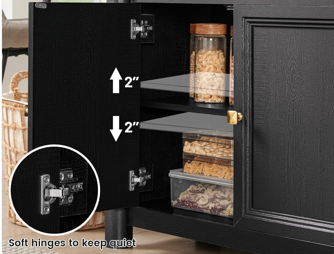
Image: The interior of the cabinet showing adjustable/removable shelves, allowing for flexible storage configurations.

With adjustable/removable shelves flexibly accommodate items of all sizes