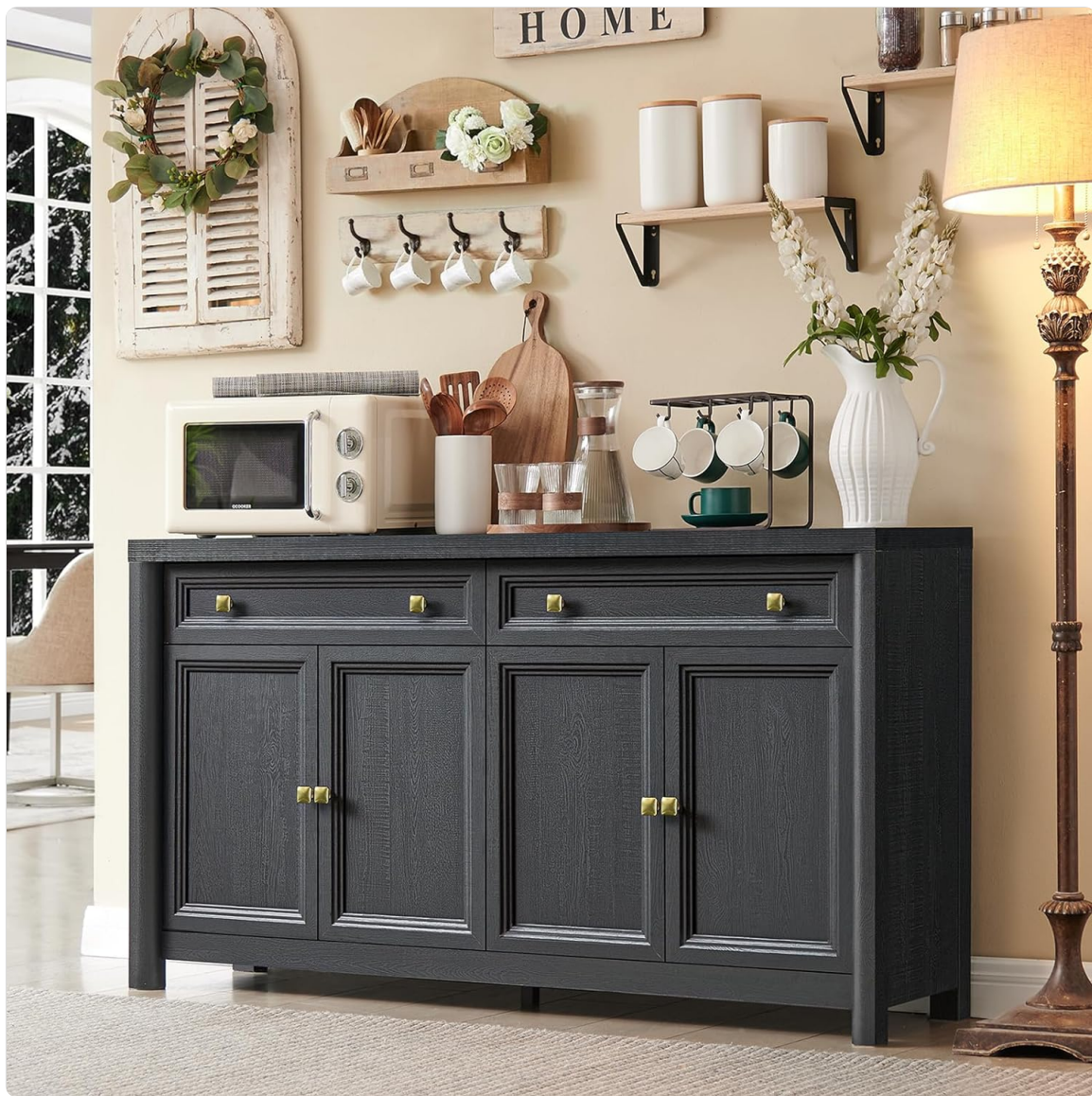
Image: The Standifurno Farmhouse Buffet Cabinet, showcasing its design and placement in a home environment.