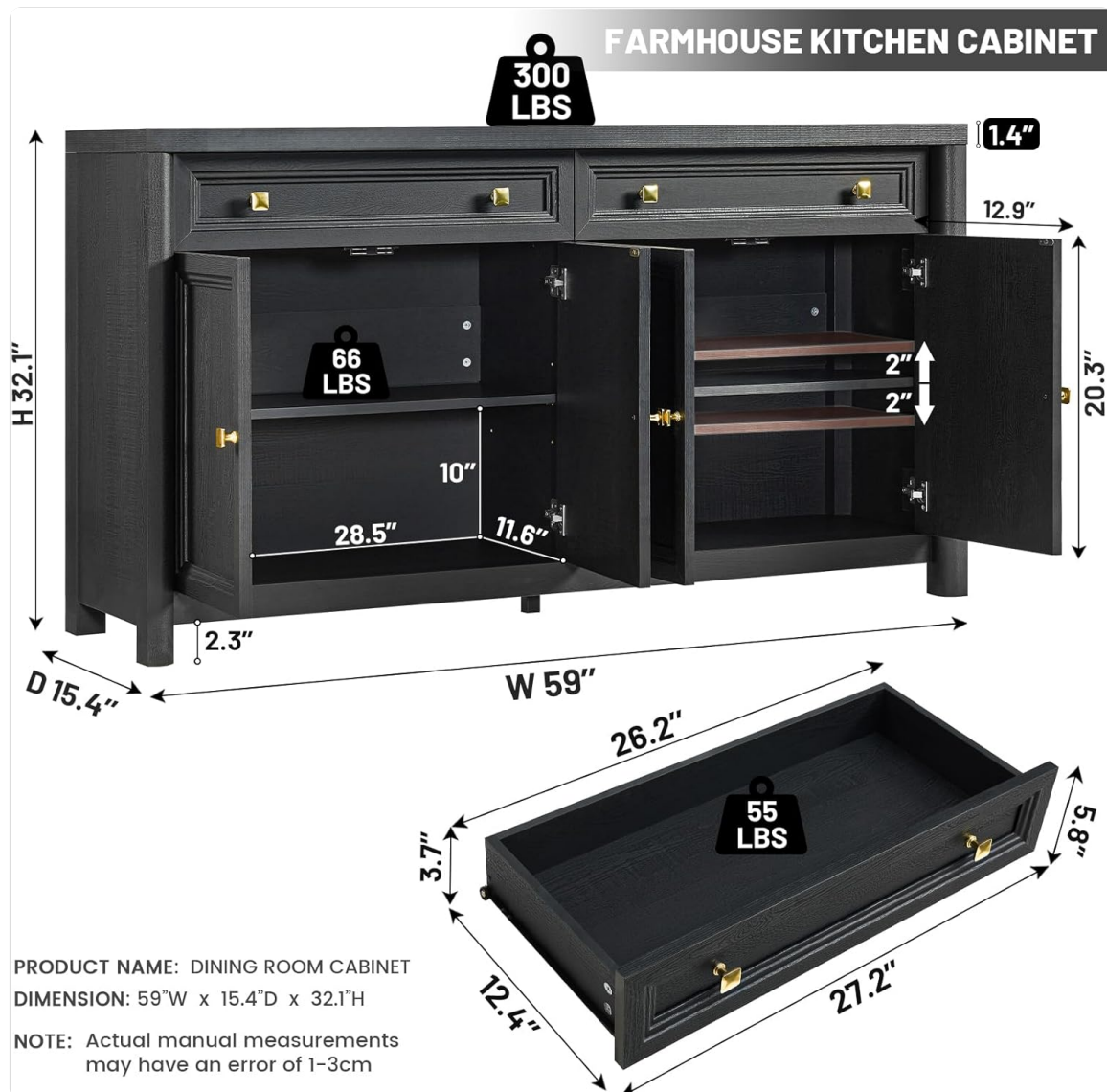
Image: Visual representation of the cabinet's dimensions (59"W x 15.4"D x 32.1"H) and internal storage measurements.