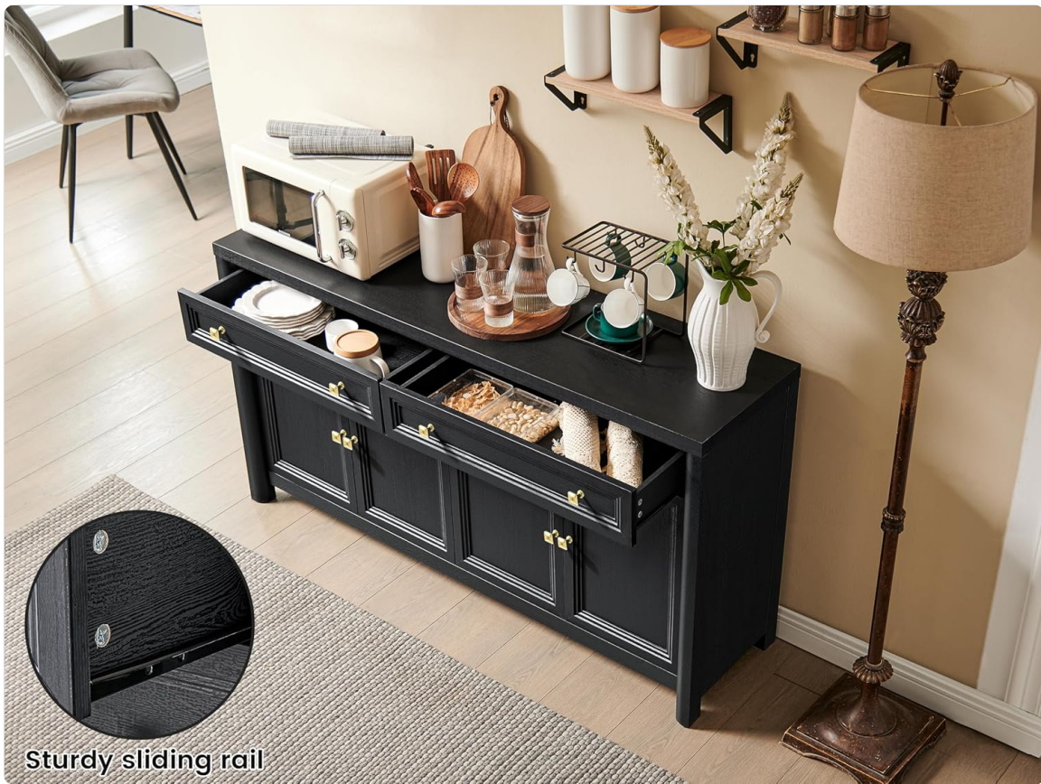
Sturdy sliding rail

Image: The cabinet with drawers pulled out, highlighting the smooth-gliding rails and ample space for utensils and smaller items.