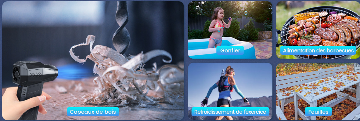
Image: The Solareye X13FR air duster being used for outdoor cleaning tasks, such as blowing wood chips, inflating pool toys, and clearing leaves.

Video: A demonstration of the Solareye X13FR air duster in action, showcasing its effectiveness for quick cleaning tasks and DIY projects.