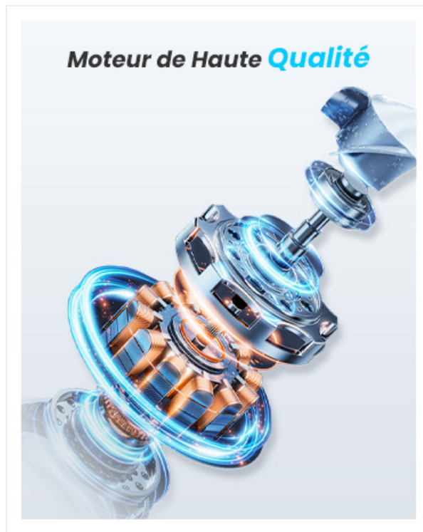
Image: An exploded view of the Solareye X13FR's high-quality motor, highlighting its internal components and efficient design.