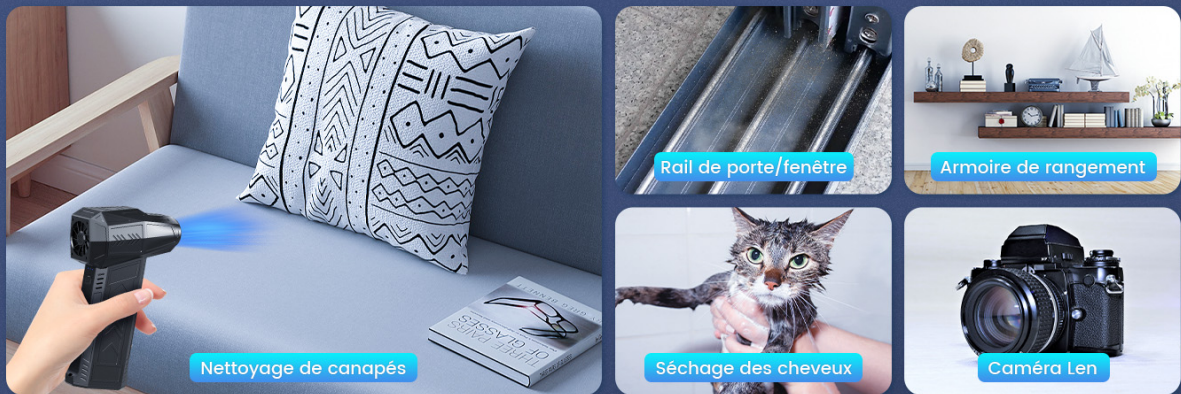
Image: The Solareye X13FR air duster used for various home cleaning tasks, such as cleaning sofas, window tracks, and drying pet hair.