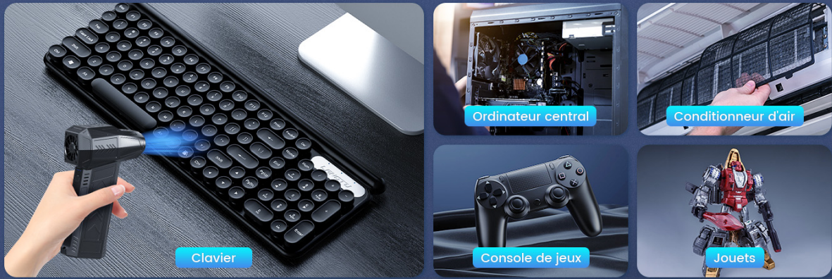
Image: The Solareye X13FR air duster being used to clean various electronic devices, including a keyboard, computer tower, and game console.