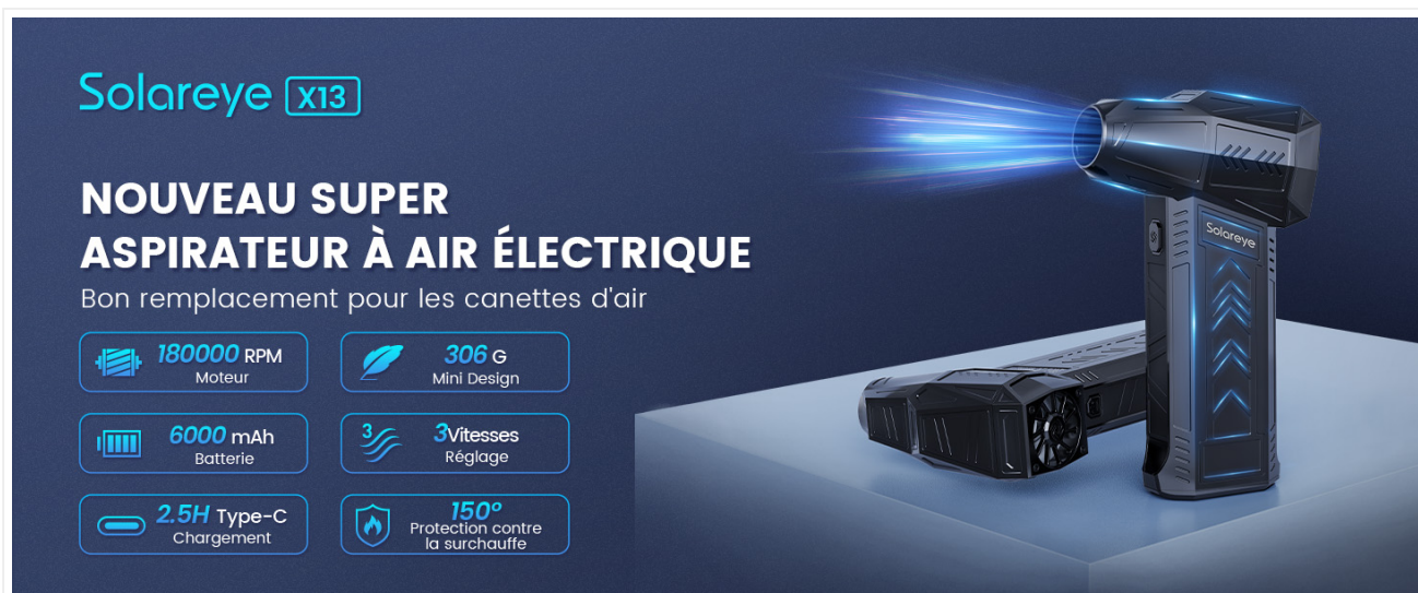
Image: A visual comparison highlighting the advantages of the Solareye X13FR electric air duster over traditional canned air, emphasizing reusability and efficiency.