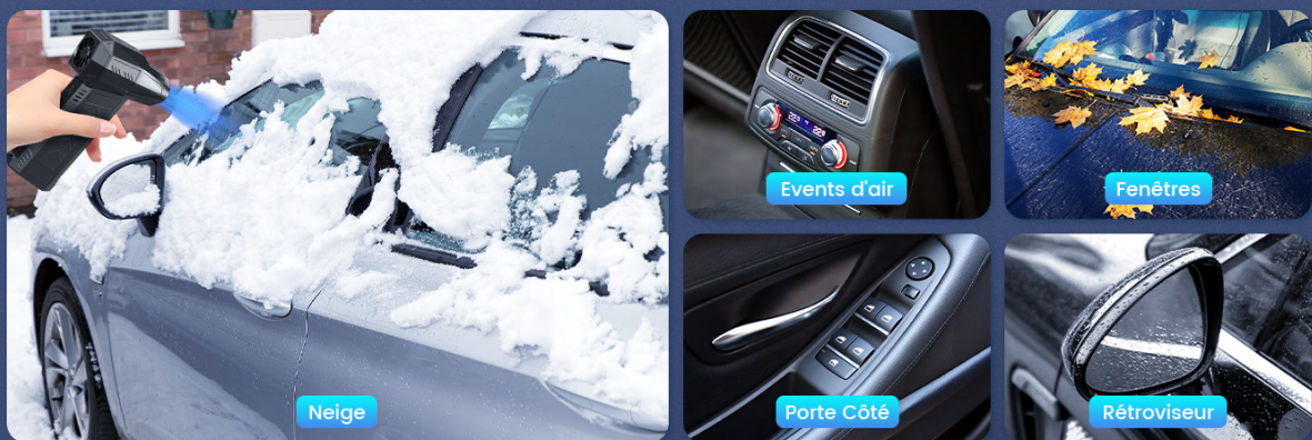
Image: The Solareye X13FR air duster demonstrating its utility for car cleaning, including snow removal, cleaning air vents, and drying windows.