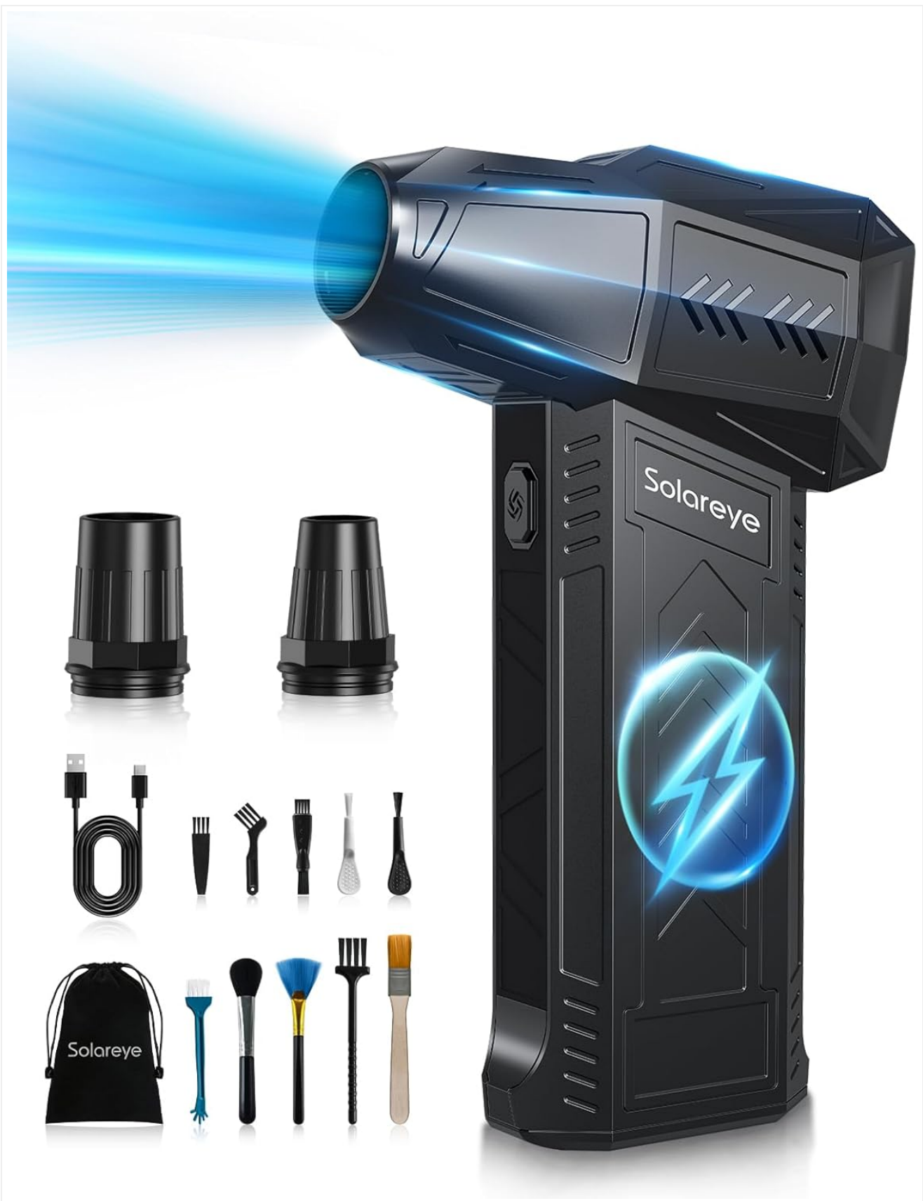
Image: The Solareye X13FR Compressed Air Duster, a compact and powerful cleaning device.