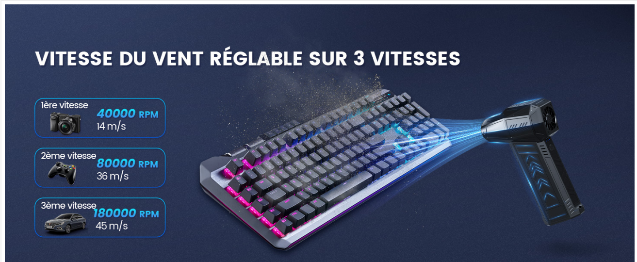
Image: The Solareye X13FR air duster demonstrating its three adjustable speed settings (40,000 RPM, 80,000 RPM, 180,000 RPM) for varied cleaning tasks.