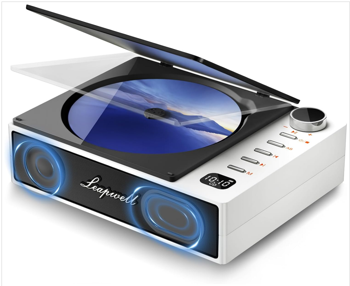
Image: A white Leapwell Portable CD Player with its top lid open, revealing a CD. The front speakers are illuminated with a blue glow, and control buttons are visible on the right side.