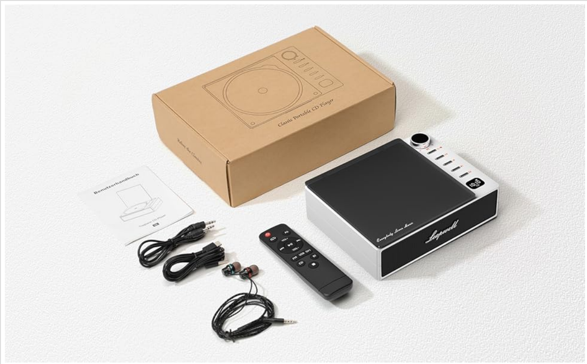
Image: The Leapwell Portable CD Player shown with its remote control, earphones, AUX cable, USB-C charging cable, and user manual, all neatly arranged next to its packaging box.