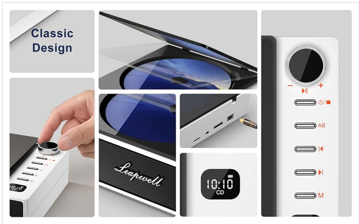
Image: A collage showcasing various design elements and features of the CD player, including the volume knob, the open CD lid, the USB-C and optical ports, and the digital display.