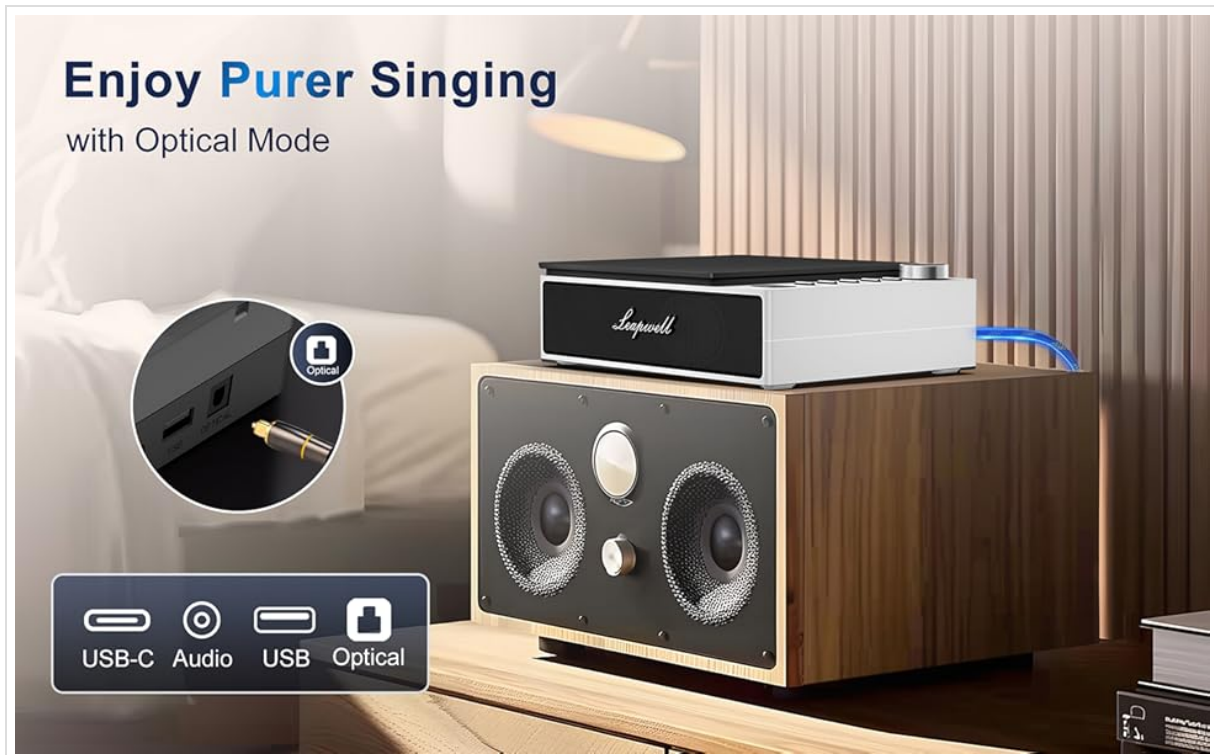
Image: The CD player is shown connected to a larger external speaker system using an optical cable, highlighting its capability for high-quality audio output.