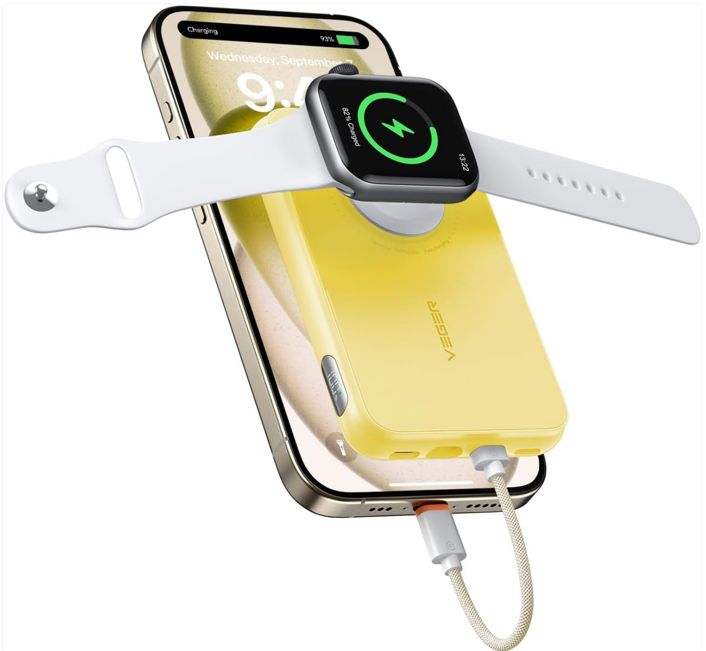
Figure 1: VEGER V1171 Portable Charger in use, charging an iPhone via the built-in cable and an Apple Watch via the magnetic module. The power bank is yellow.

The image above illustrates the VEGER V1171 portable charger, showcasing its ability to charge both an iPhone and an Apple Watch simultaneously. The iPhone is connected via the integrated cable, while the Apple Watch is placed on the magnetic charging pad. The power bank itself is shown in a yellow finish.