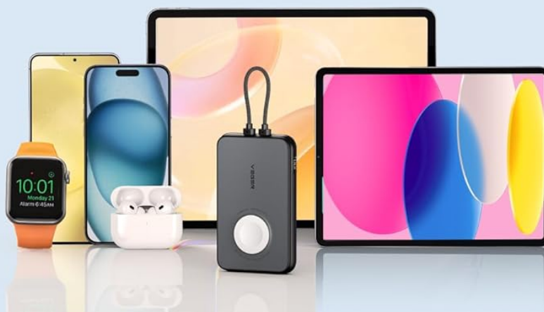
Figure 7: An illustration of the wide compatibility of the VEGER V1171 portable charger, showing various iPhone, Android, iPad, Apple Watch models, and other low-current devices like portable fans and AirPods.

This image visually represents the extensive compatibility of the VEGER V1171 portable charger, capable of charging a wide range of devices from iPhones and Android smartphones to iPads, Apple Watches, and even smaller gadgets like portable fans and AirPods.