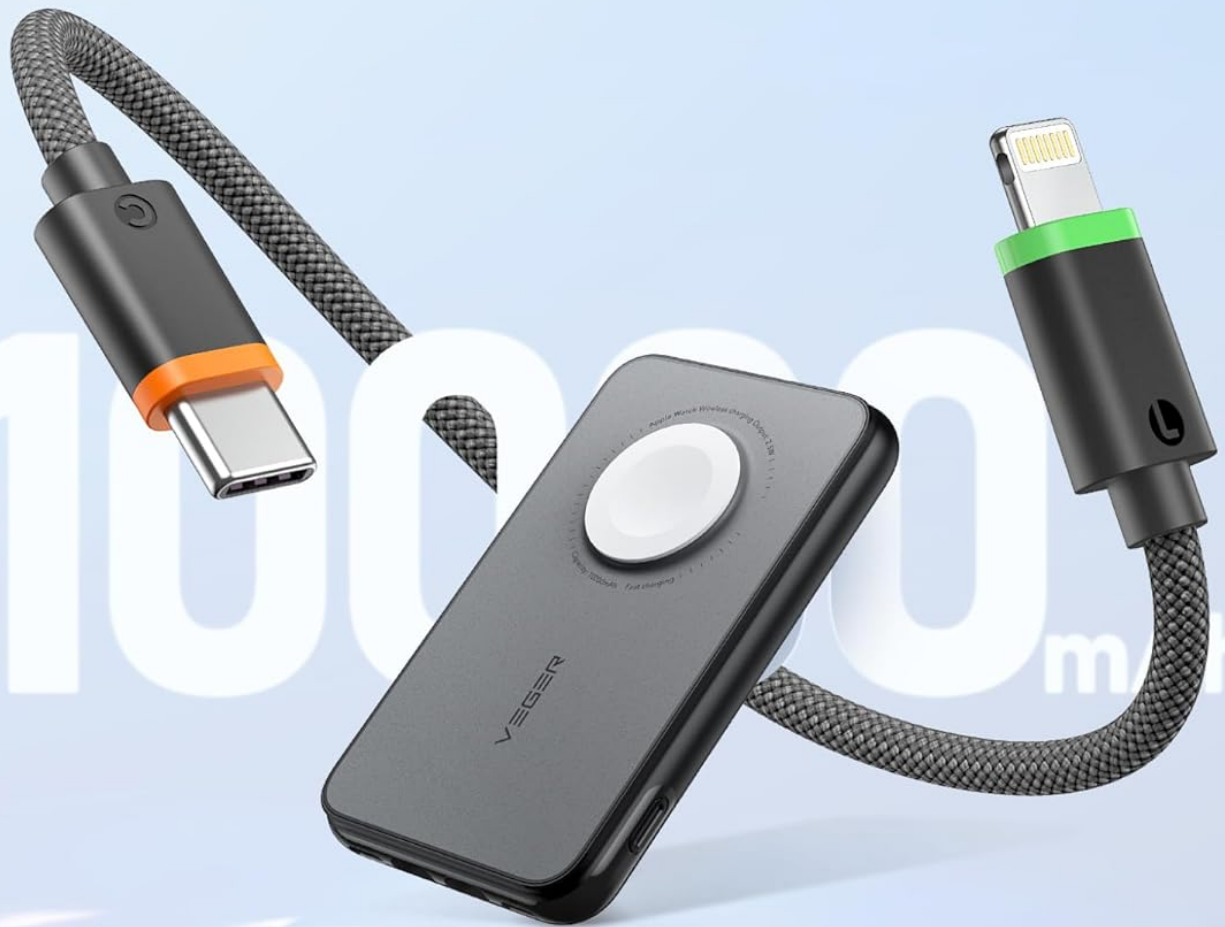
Figure 2: Detail of the bidirectional USB-C to iOS built-in cable and the USB-C output port on the VEGER V1171 portable charger.

This image highlights the versatile charging options of the power bank, featuring its built-in bidirectional USB-C to iOS cable and an additional USB-C port for output. This design allows for flexible charging of various devices.