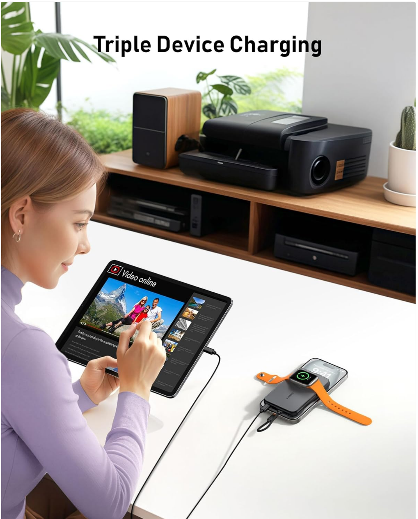
Figure 5: A user demonstrating triple device charging with the VEGER V1171 portable charger, simultaneously charging an iPad, an Apple Watch, and another device via the USB-C port.

This image illustrates the capability of the VEGER V1171 to charge three devices concurrently: an iPad connected via a cable, an Apple Watch on its magnetic pad, and another device connected to the USB-C port. This highlights its multi-device charging functionality.