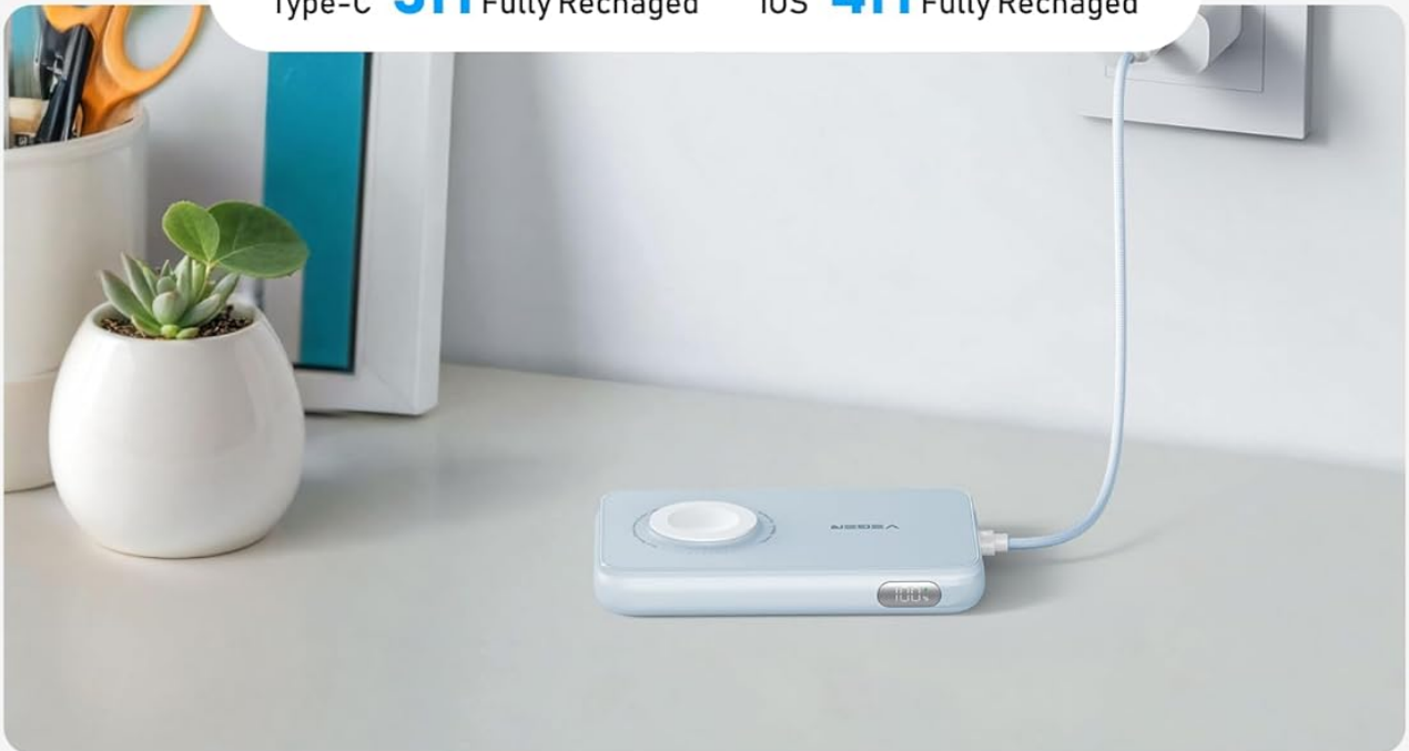
Figure 4: The VEGER V1171 portable charger being recharged. The top image shows recharging via a USB-C cable, while the bottom image shows recharging using the built-in iOS cable, indicating recharge times of 3 hours for Type-C and 4 hours for iOS.

Type-C 3H Fully Recharged iOS 4H Fully Recharged