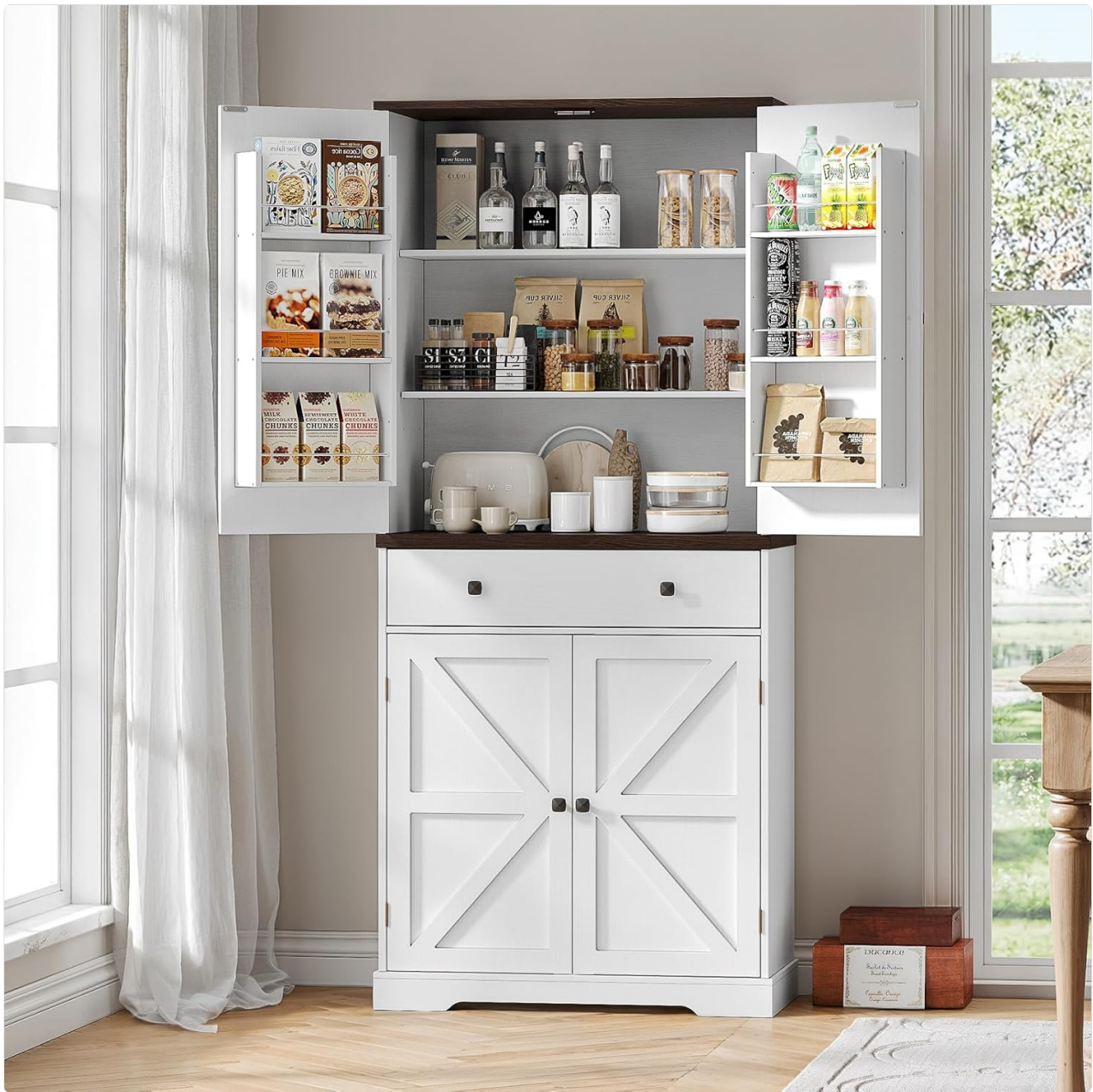
Image: The ONBRILL 71-inch Farmhouse Kitchen Pantry Cabinet in a room setting, showcasing its elegant design.