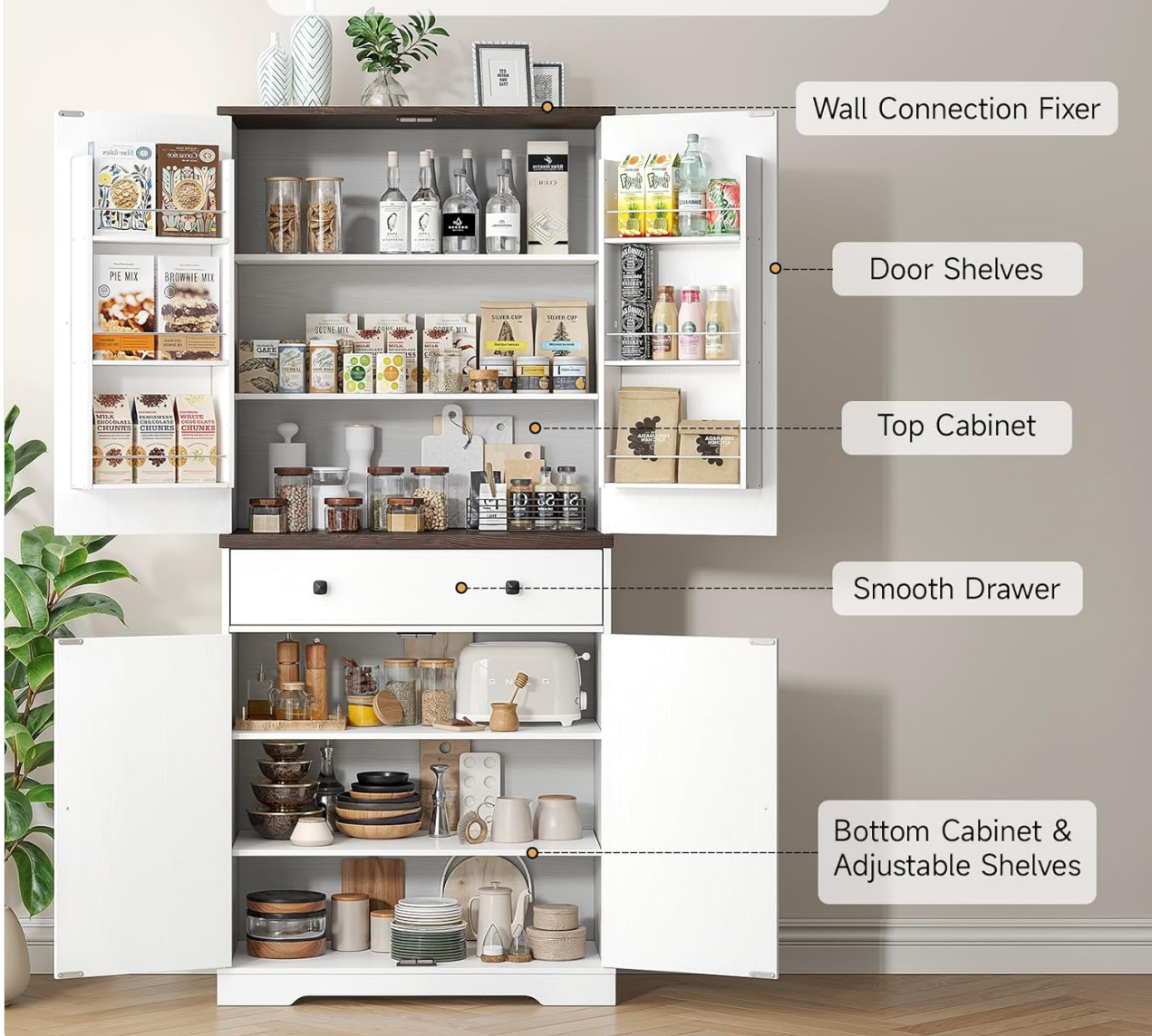
Image: The interior of the ONBRILL pantry cabinet, demonstrating its ample storage capacity with items like spices, drinks, and small appliances.