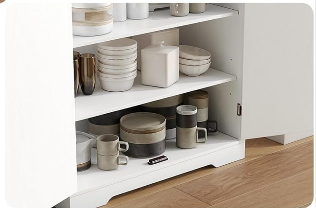
Image: Detailed views highlighting the door shelves for small items, the smooth-gliding drawer, and the flexible storage options with adjustable shelves.

Flexible storage keeps lots of items neatly in one place and meet your needs