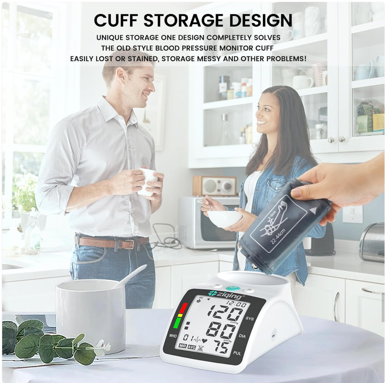
Figure 3: The monitor features an integrated cuff storage design for convenience.

UNIQUE STORAGE ONE DESIGN COMPLETELY SOLVES THE OLD STYLE BLOOD PRESSURE MONITOR CUFF EASILY LOST OR STAINED, STORAGE MESSY AND OTHER PROBLEMS!