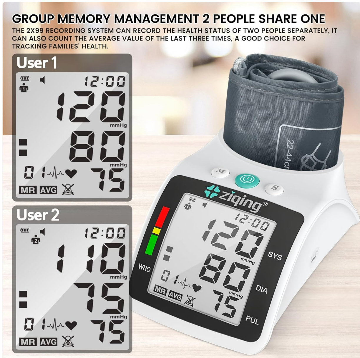
Figure 5: The monitor features group memory management for two users, storing 99 readings each.

The monitor supports two users (User 1 and User 2) and stores up to 99 readings for each user, totaling 198 memory sets. This allows for easy tracking of individual health trends.