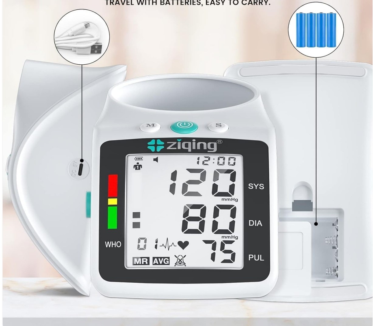
Figure 2: The monitor can be powered by 4 AAA batteries or via the included USB cable.

AT HOME WITH POWER, SAVE MONEY AND ENVIRONMENTAL PROTECTION; TRAVEL WITH BATTERIES, EASY TO CARRY.