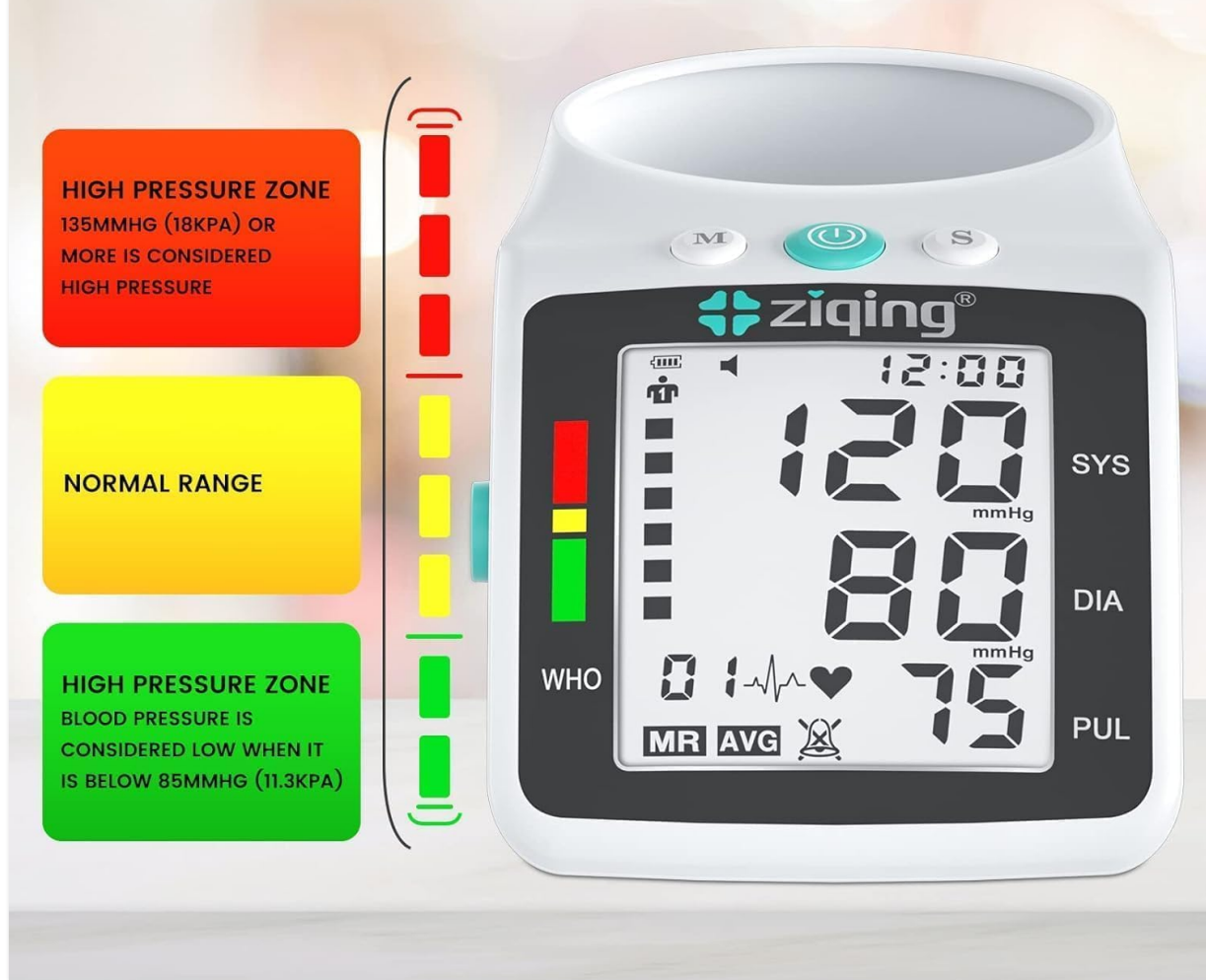
Figure 6: WHO classification indicator on the monitor display.

WHEN THE MEASUREMENT VALUE EXCEEDS 135MMHG AND IS LOWER THAN 85MMHG, THE MACHINE WILL SHOW IRREGULAR HEARTBEAT ICON FLASHING PROMPT.