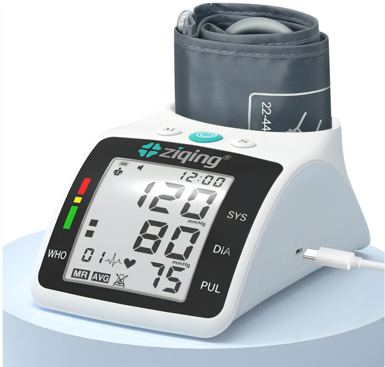
Figure 1: Front view of the Double love Blood Pressure Monitor with cuff.