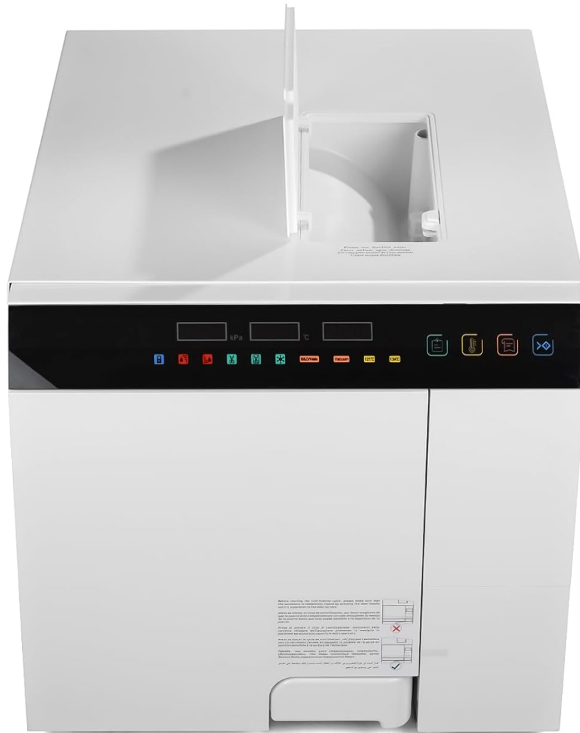
Figure 4: Distilled Water Tank Access.