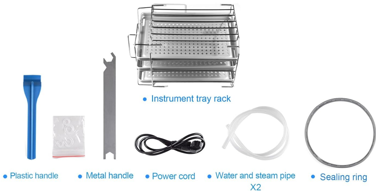
Figure 8: Included Accessories.