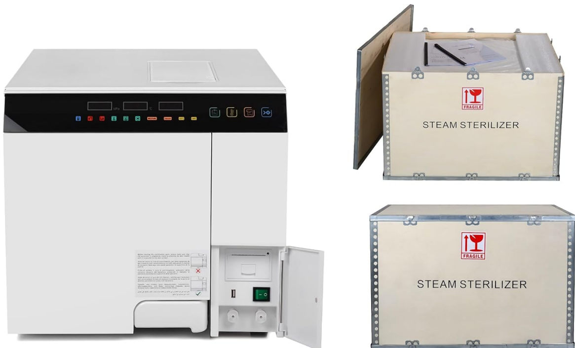
Figure 2: Sterilizer and Packaging.