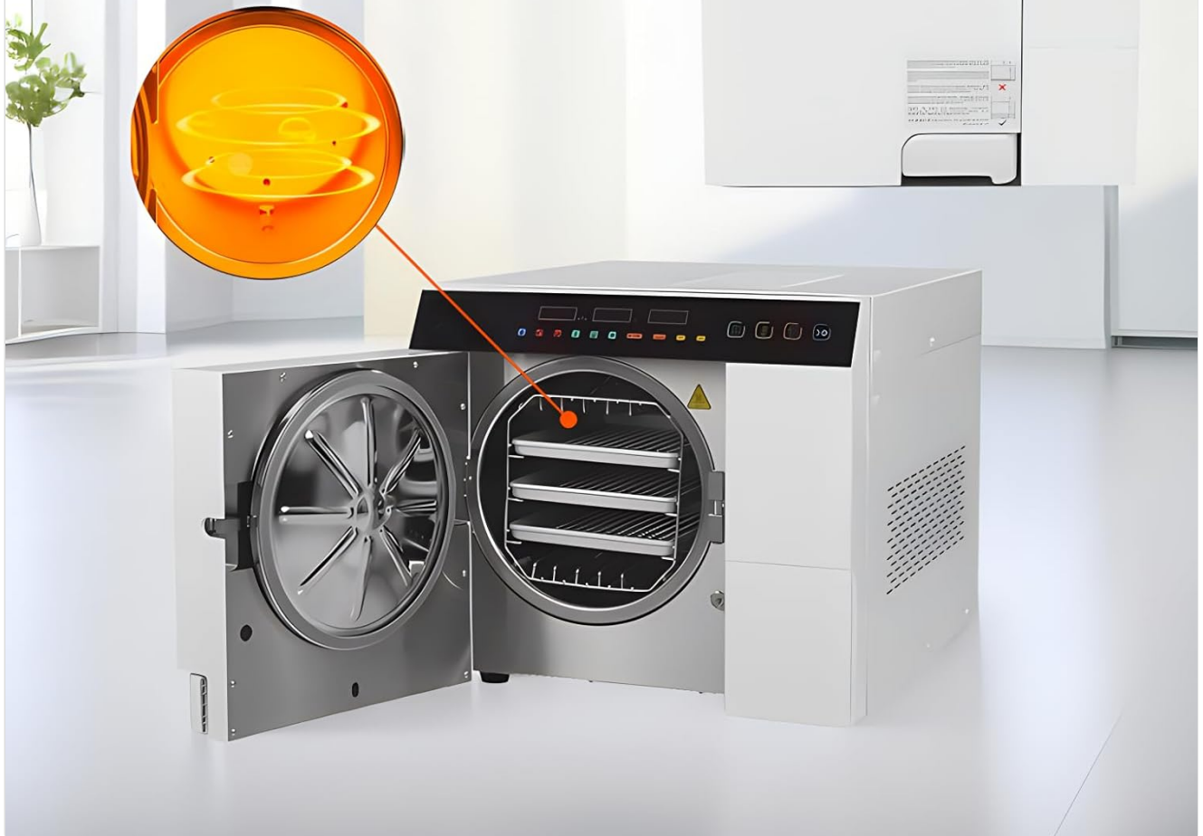
Figure 5: Loading Instruments into the Chamber.