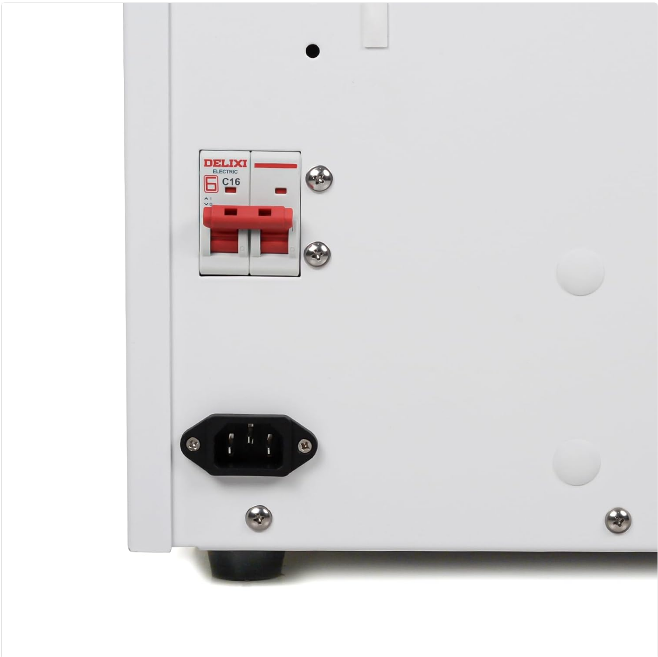
Figure 3: Power Connection Points.