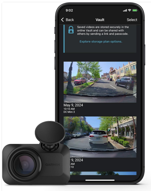
Figure 1: Garmin Dash Cam Mini 3

The Garmin Dash Cam Mini 3 is an ultracompact, voice-controlled dash camera designed to automatically record high-definition 1080p video with a wide 140-degree field of view. It captures important details day and night, and automatically saves video of detected incidents. Featuring a built-in Garmin Clarity polarizer, it reduces windshield glare for clear video. The device integrates with the Garmin Drive smartphone app, allowing for secure online storage of video clips via a paid Vault subscription and active Wi-Fi network connection. Voice control supports commands in English, German, French, Spanish, Italian, and Swedish for saving video and managing audio recording. Please be aware that some jurisdictions may regulate or prohibit the use of this device.