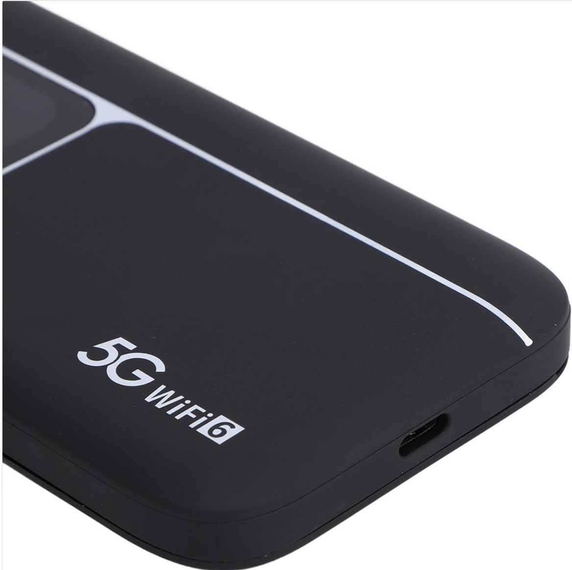
Image: A detailed view of the device's side, showing the USB-C charging port and the SIM card slot, which is covered by a small flap.