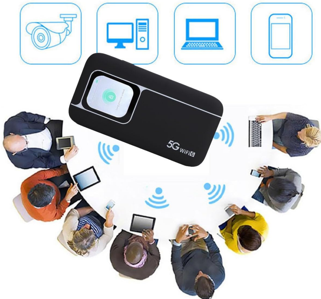
Image: An illustration depicting various electronic devices, such as laptops, tablets, and smartphones, wirelessly connected to the mobile hotspot, demonstrating its multi-device capability.