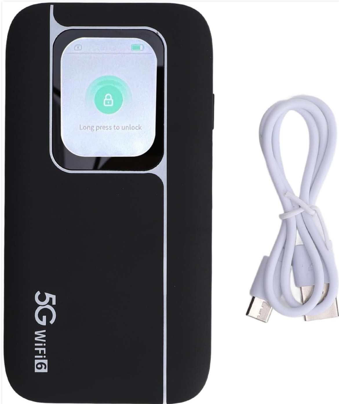
Image: The Wisoqu 5G WiFi6 LTE Mobile Hotspot device shown alongside its included USB charging cable.