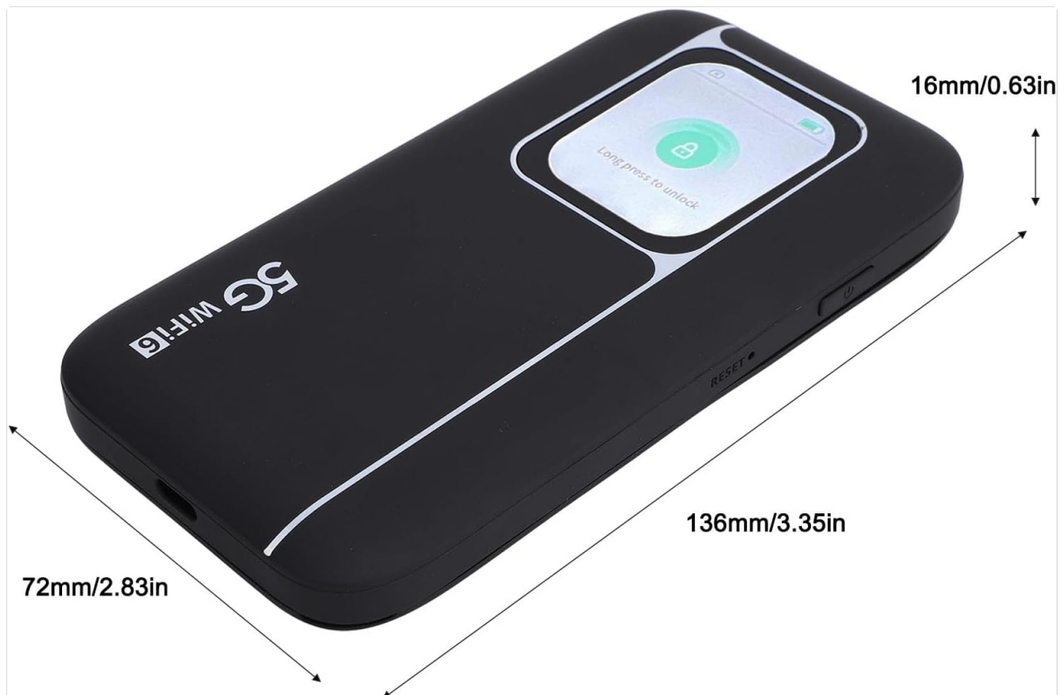
Image: The mobile hotspot device shown with its length (136mm/3.35in), width (72mm/2.83in), and thickness (16mm/0.63in) clearly